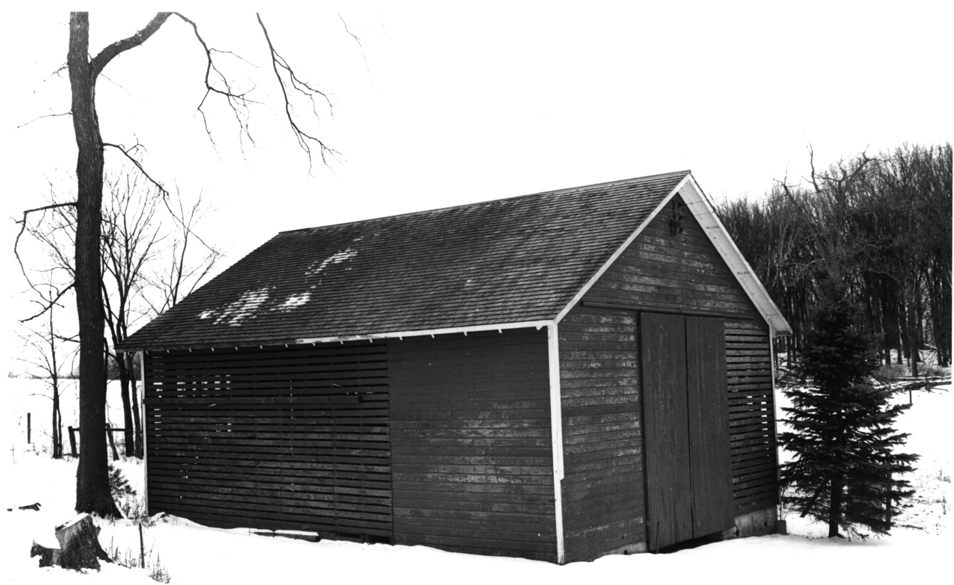
CORNCRIB BROMAN Farmstead Kandiyohi Twp., Kandiyohi Co., MN 010694-9