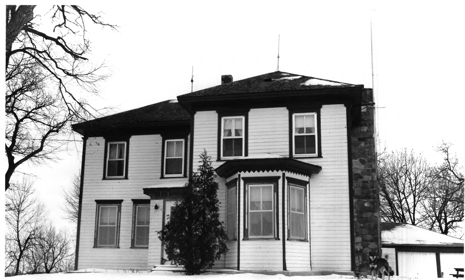
Farmhouse Broman Farmstead Kandiyohi Twp., Kandiyohi Co., MN 010694-6