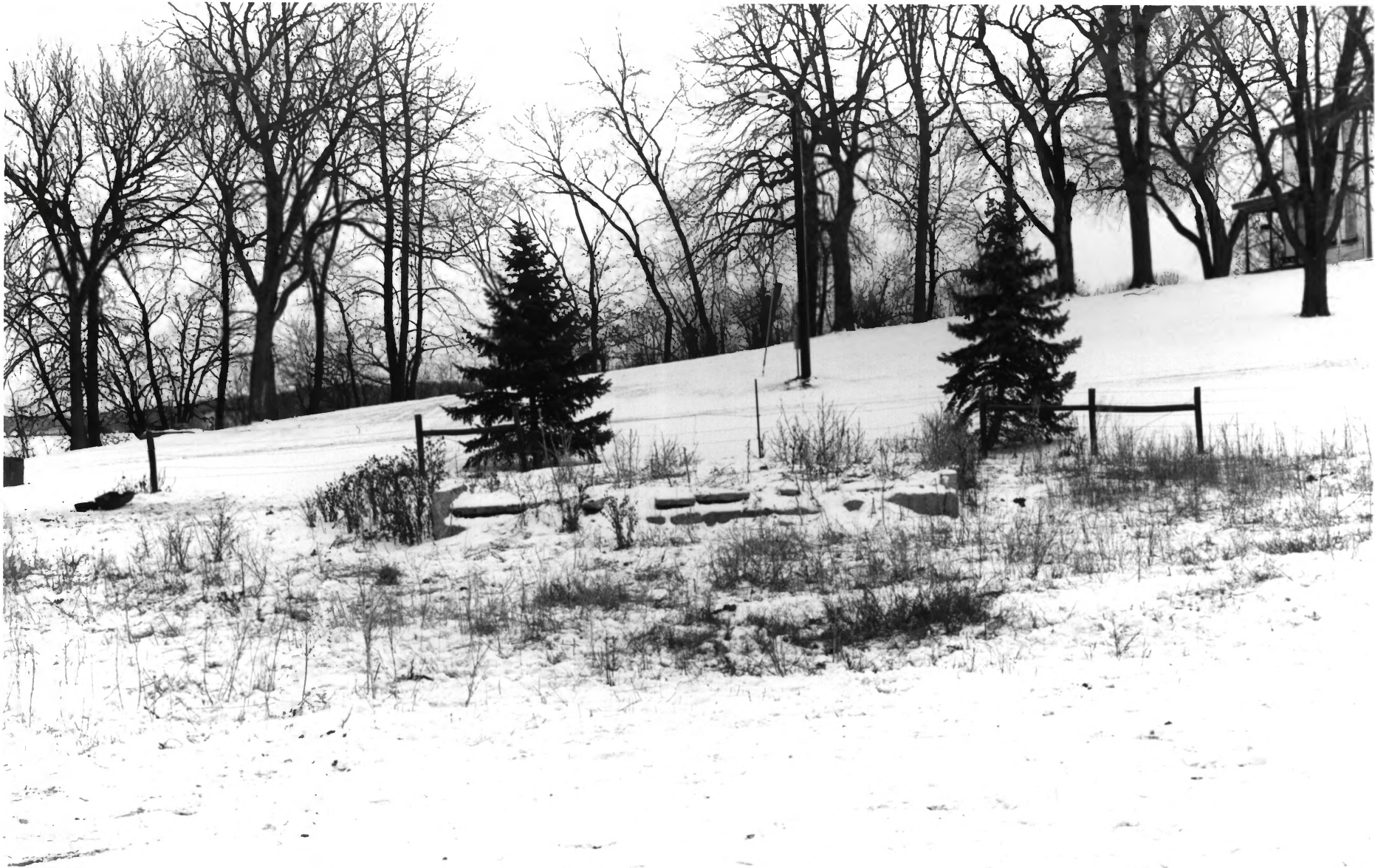
HOG Shed Foundation Broman Farmstead Kandiyohi Twp, Kandiyohi Co., MN 010694-18