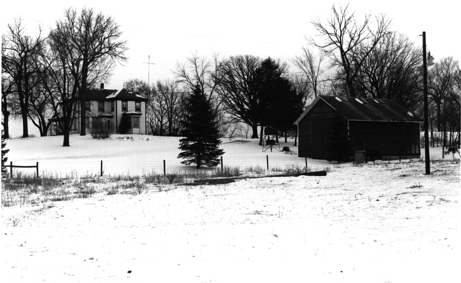
Farmhouse and CORNER Broman Farmstead Kandiyohi Twp., Kandiyohi Co., MN 010694-19