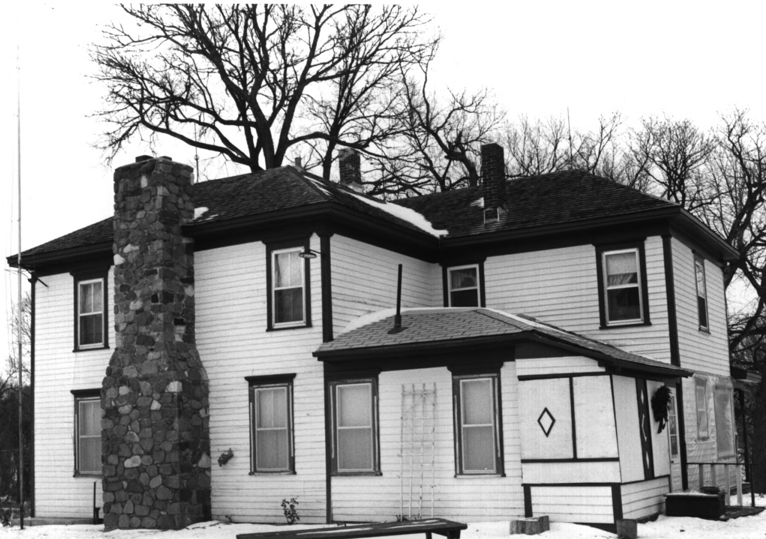
Farmhouse BROMAN FARMSTEAD KANDIYOHİ TWP., KANDIYOHİ CO., MN 010694-3