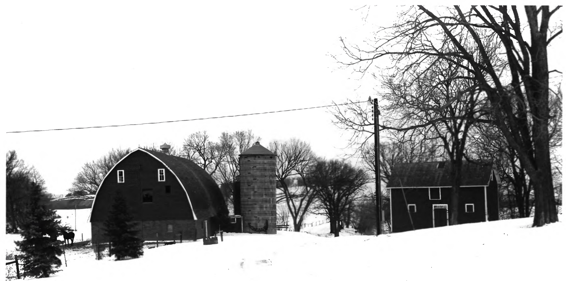
BARN, SILO, and GRAVARY BROMAN Farmstead Kandiyohi Twp., Kandiyohi Co., MN 010694-8