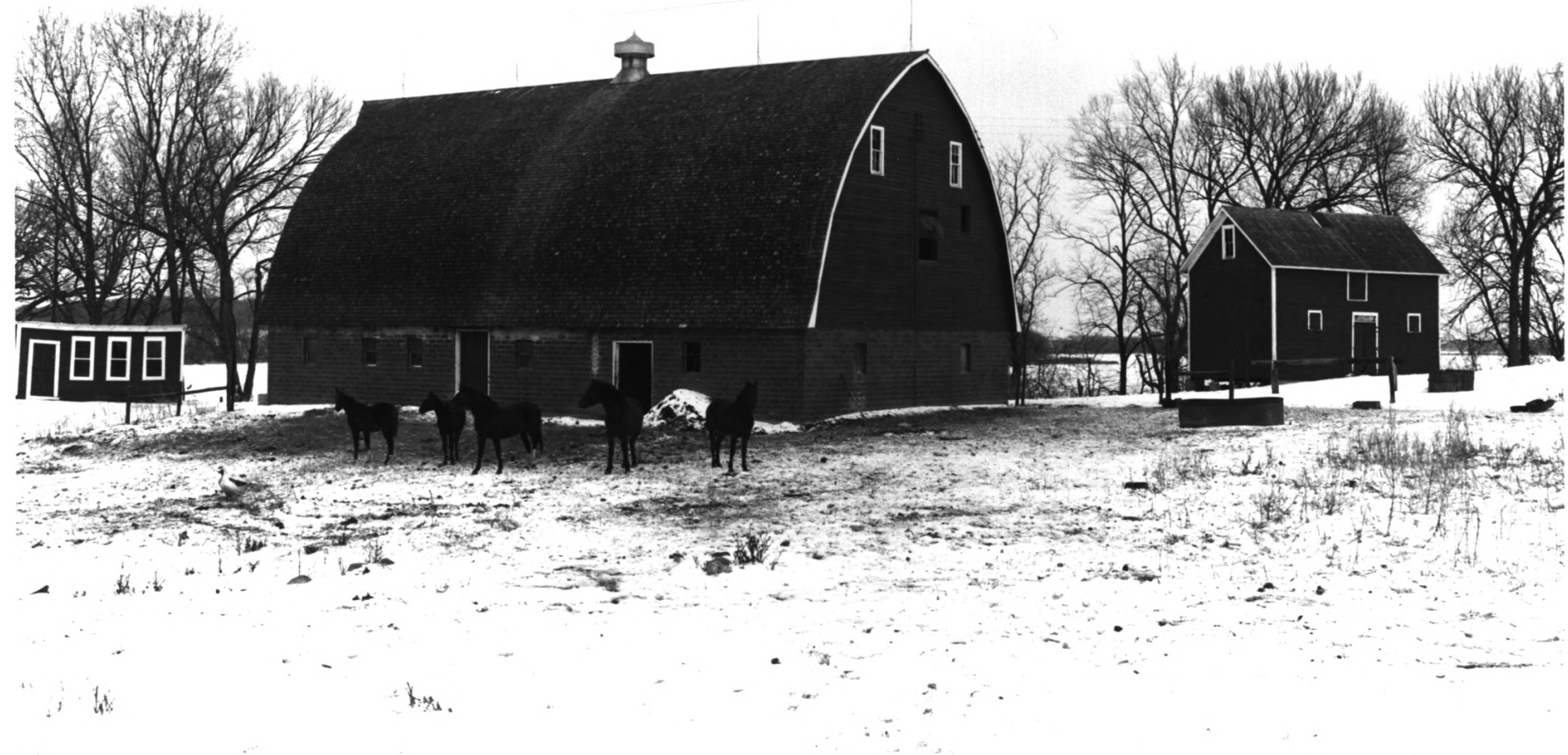
BARN AND GRANARY BROMAN FARMSTEAD KANDIYOHİ TWP., KANDIYOHİ CO., MN 010694-17