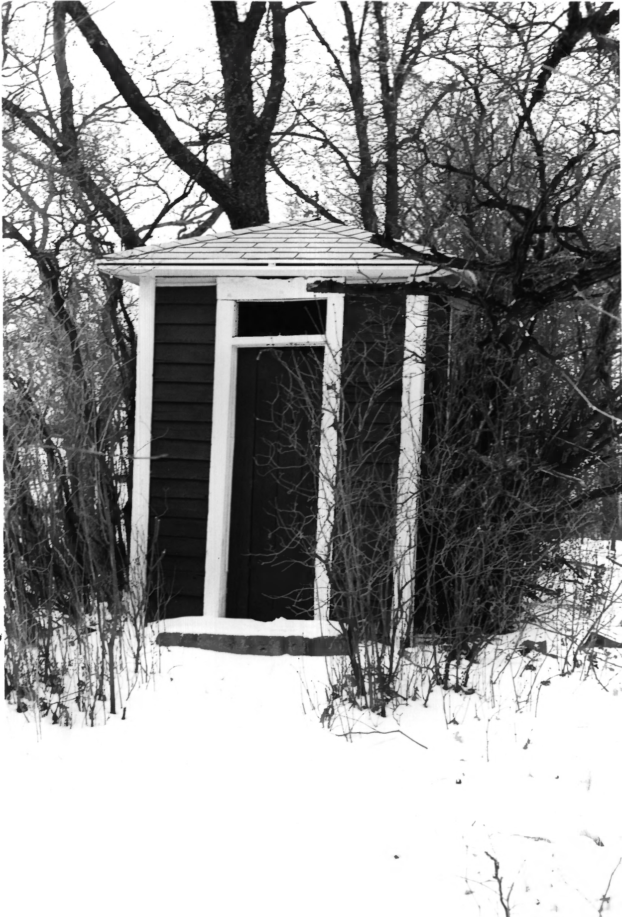
Privy Bromard Farmstead Kandiyohi Twp, Kandiyohi Co, MN 010694 - 2