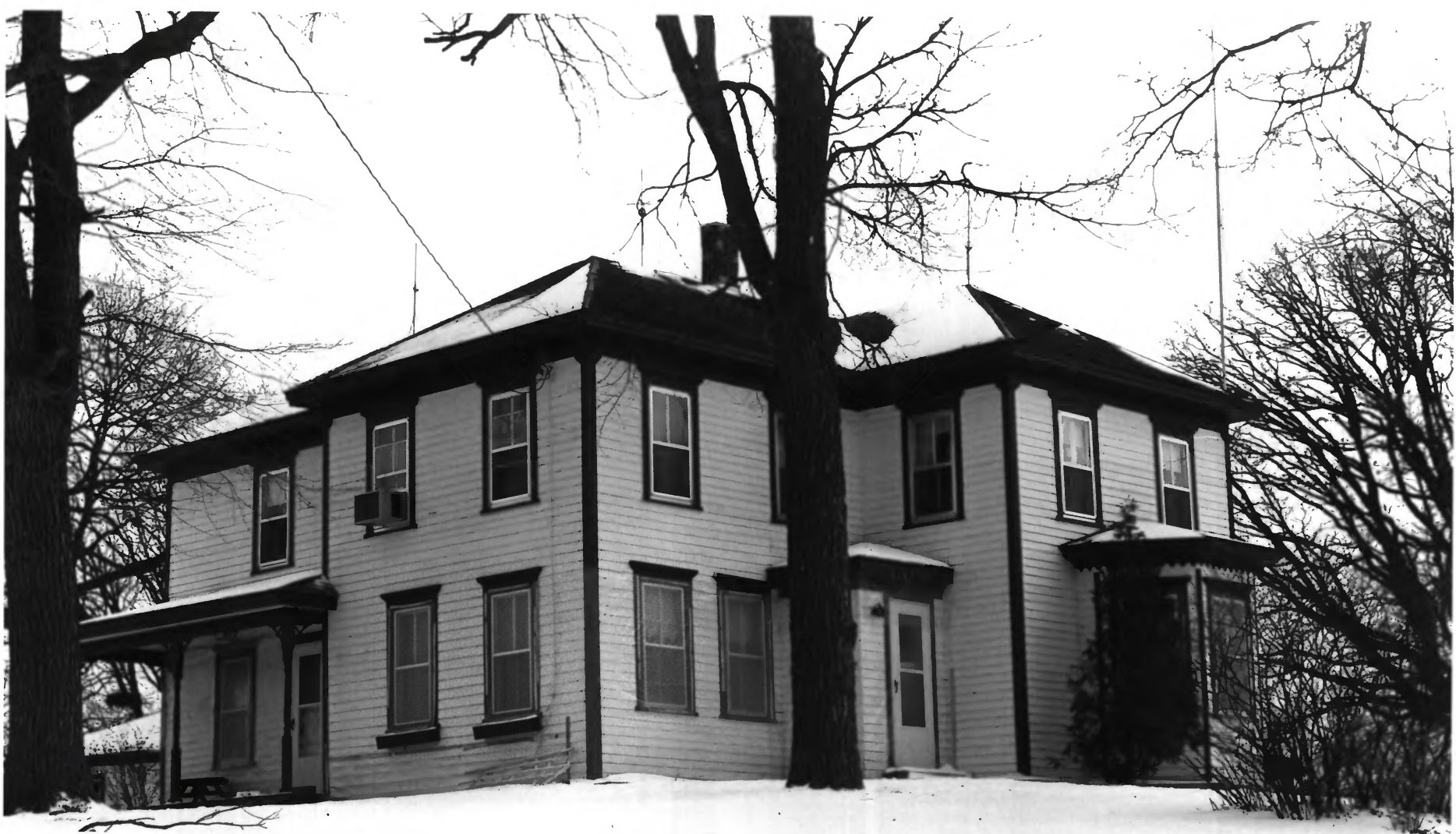
FARMHOUSE BROMAN FARMSTEAD KANDIYOHI TWP., KANDIYOHI CO., MN C10694-10