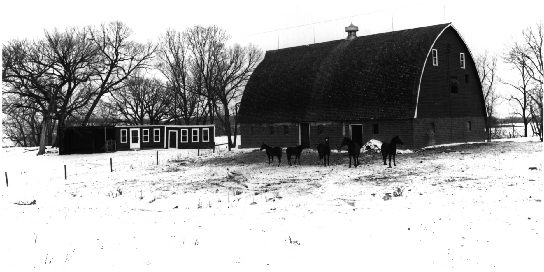
Poultry Shed and Barn Broman Farmstead Kandiyohi Twp, Kandiyohi Co., MN