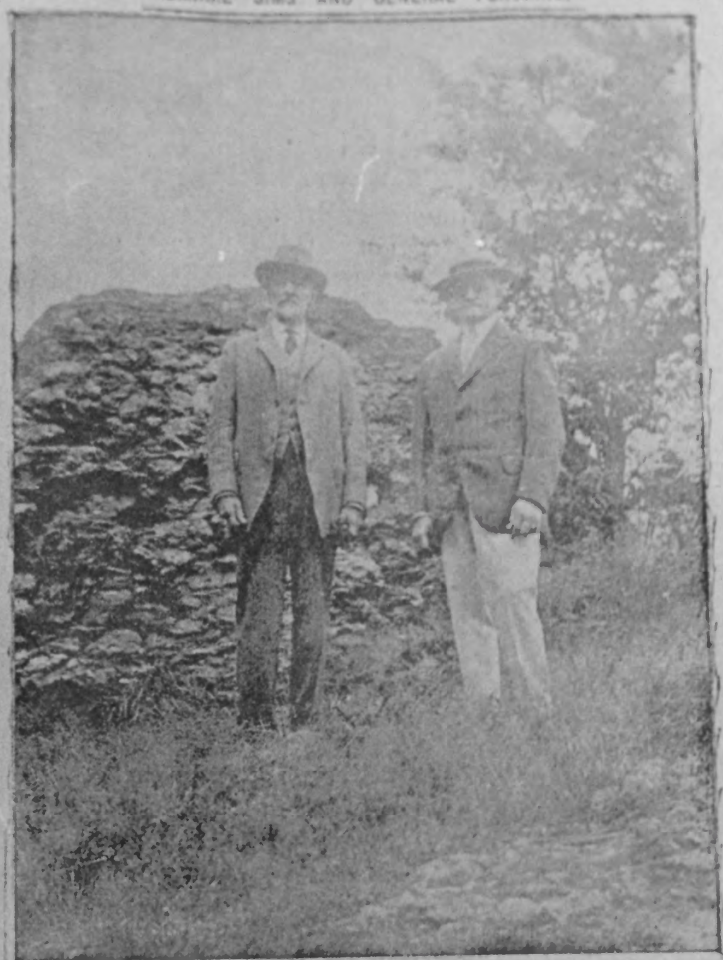
First Photograph Ever Taken of Heads of American Naval and Military Forces in the World War, Together, Made at Miantinomi Memorial Park, During Recent Visit of General Pershing to This City.