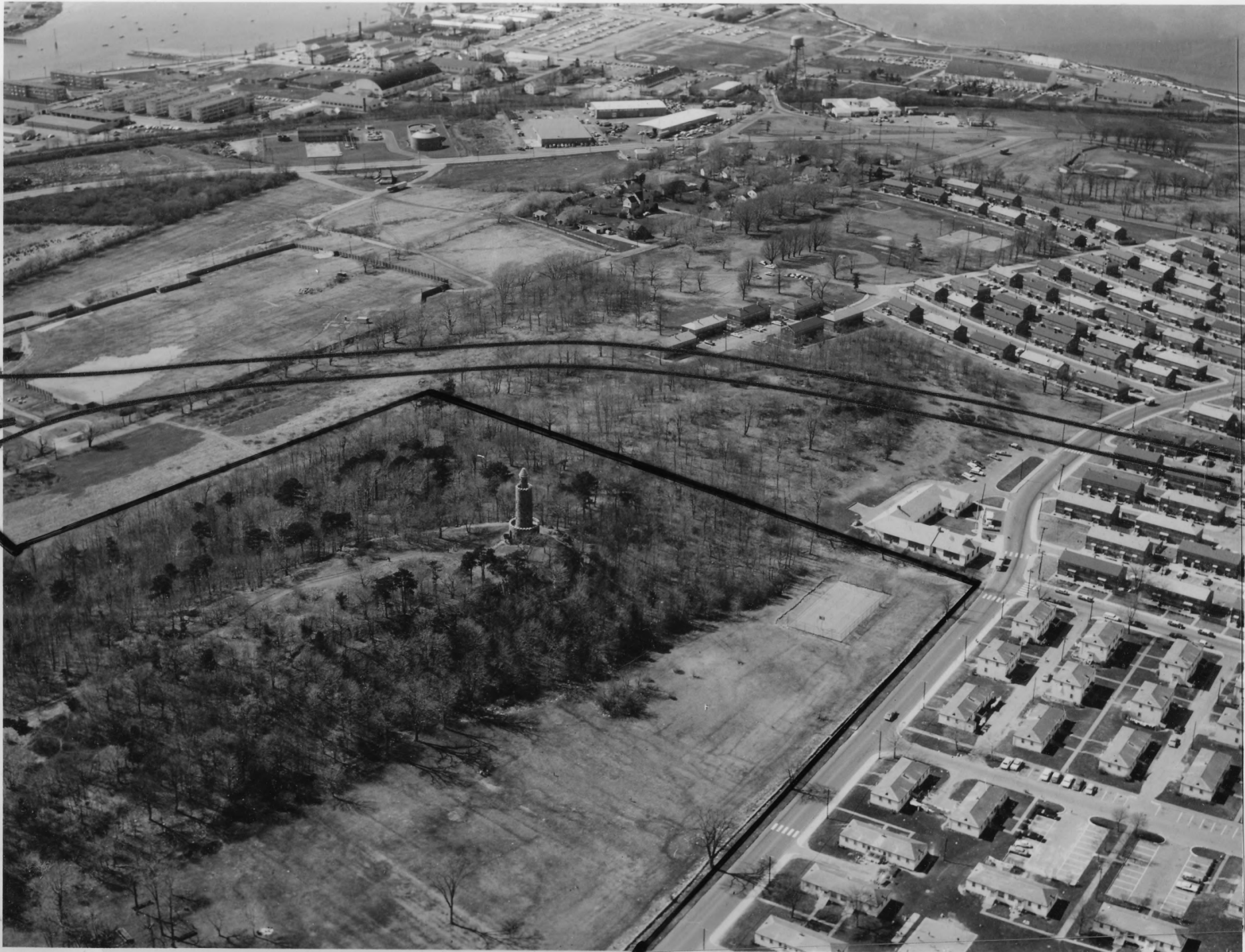
Forth Co. Camp 1911