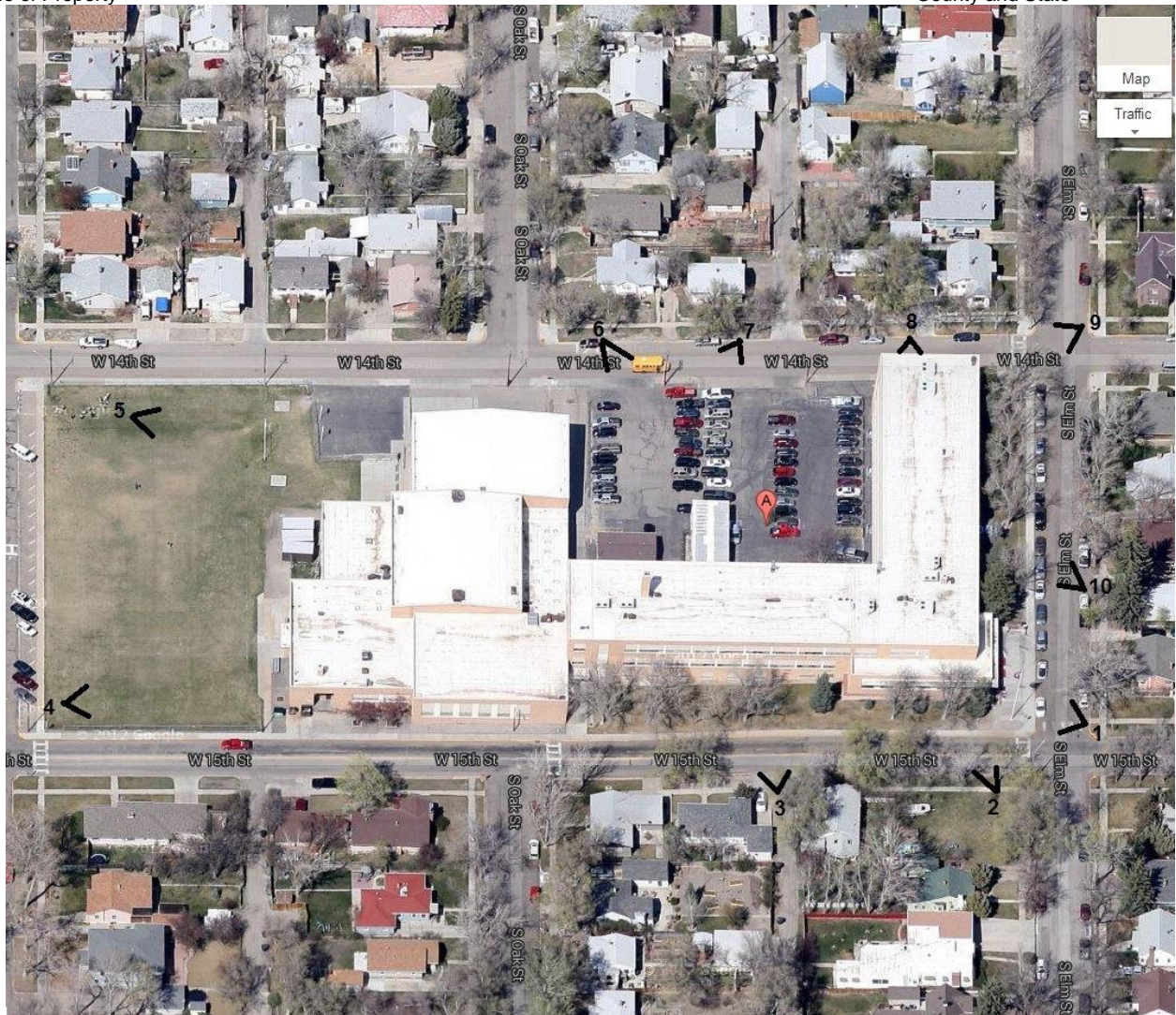
Photo key map. Dean Morgan Junior High School, Natrona County, Wyoming

Paperwork Reduction Act Statement: This information is being collected for applications to the National Register of Historic Places to nominate properties for listing or determine eligibility for listing, to list properties, and to amend existing listings. Response to this request is required to obtain a benefit in accordance with the National Historic Preservation Act, as amended (16 U.S.C. 460 et seq.).