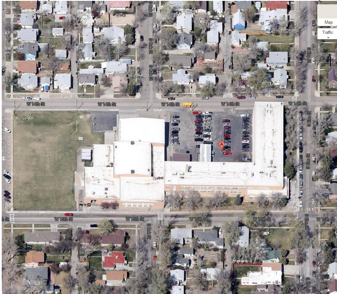
Satellite image of Dean Morgan JHS (from Google maps, accessed June 22, 2014; https://maps.google.com/maps?q=dean+morgan+junior+high&ll=42.836093,-106.330029&spn=0.002668,0.003165&t=h&z=19 )