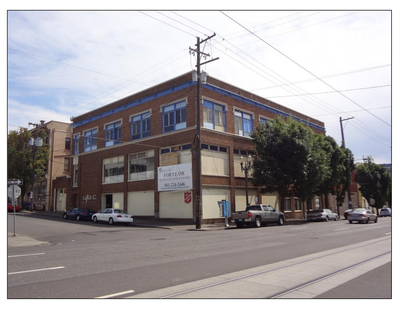
Salvation Army Industrial Home building, northwest corner, looking southeast