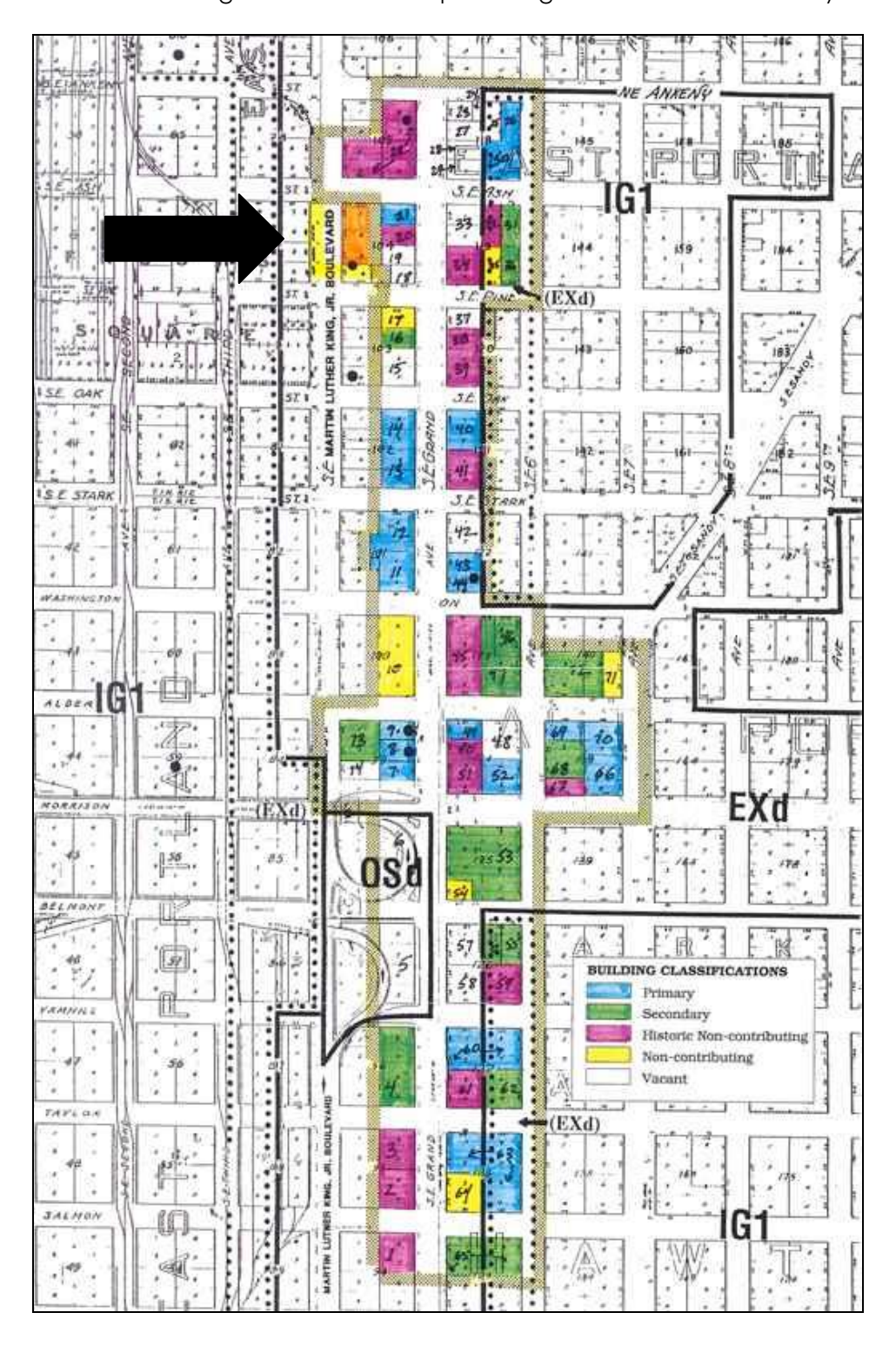
Figure 2: Amended 1991 Building Classifications map showing revised District boundary