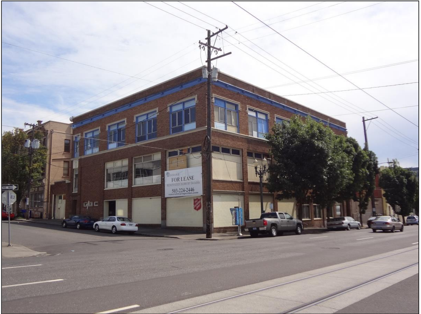
Salvation Army Industrial Home building, northwest corner, looking southeast