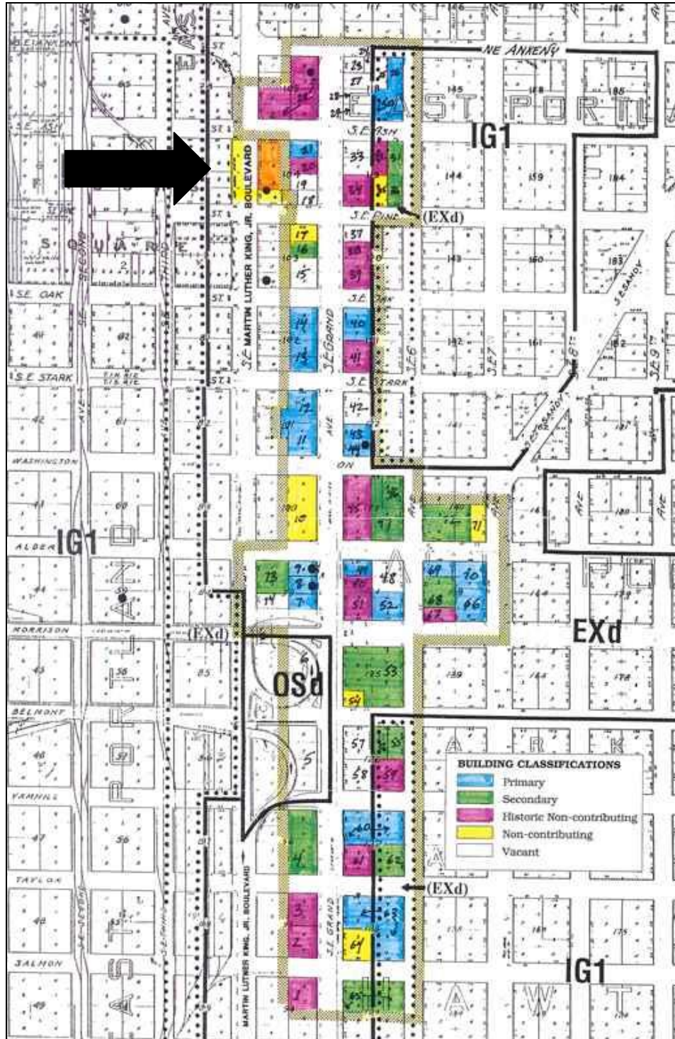
Figure 2: Amended 1991 Building Classifications map showing revised District boundary