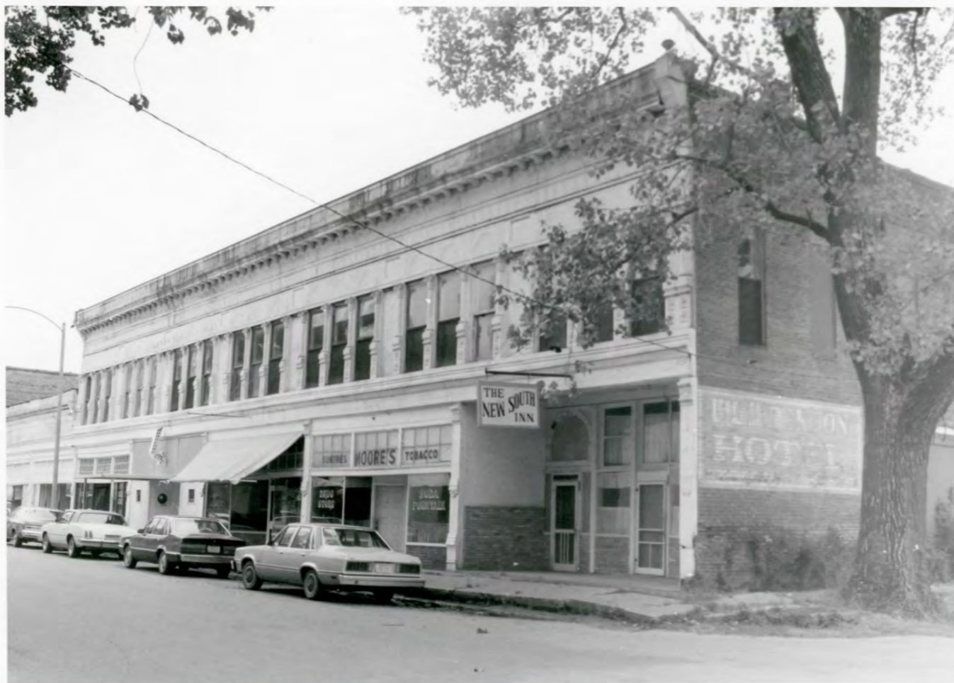
CL-46 New South Inn 132-164 Second HISTORIC RESOURCES OF CLARENDON Jeff Lewellen, photographer. Negatives at AHPP Viewed from the Southwest.