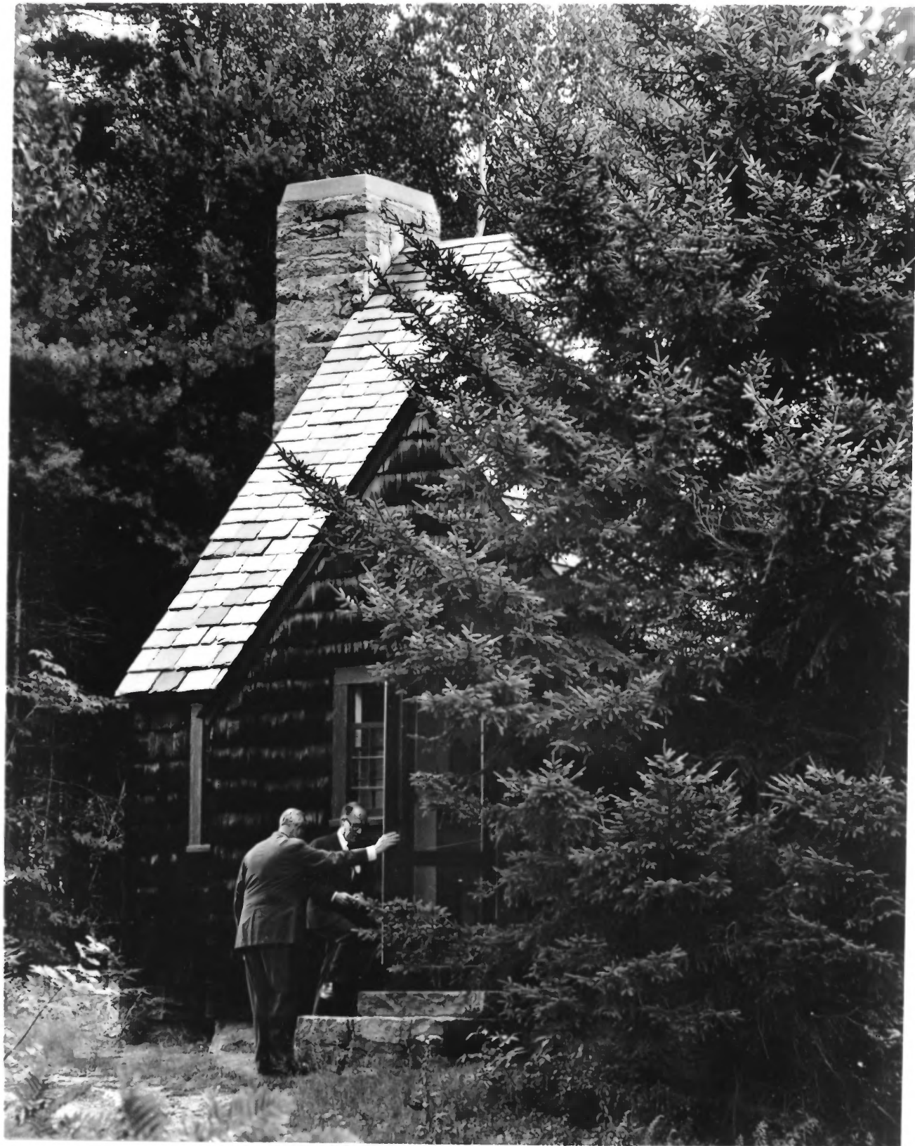
CREATIVE SECLUSION -- Each year the MacDowell Colony in Peterborough, New Hampshire, provides needed seclusion for about 120 writers, composers, and artists in studio cottages such as this one tucked in among the trees. More than 1,500 colonists have stayed there since the late composer Edward MacDowell and his wife shared their farm with a sculptor and a writer in 1907. (67-3693. Accompanies Feature F-67-524.)