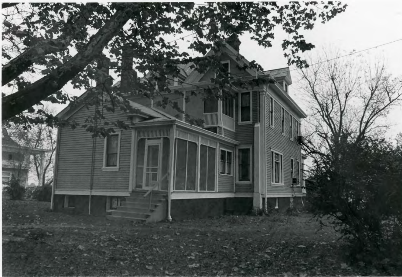
West House Helena, Arkansas November, 1982 Negative on file at AHPP Viewed from the West