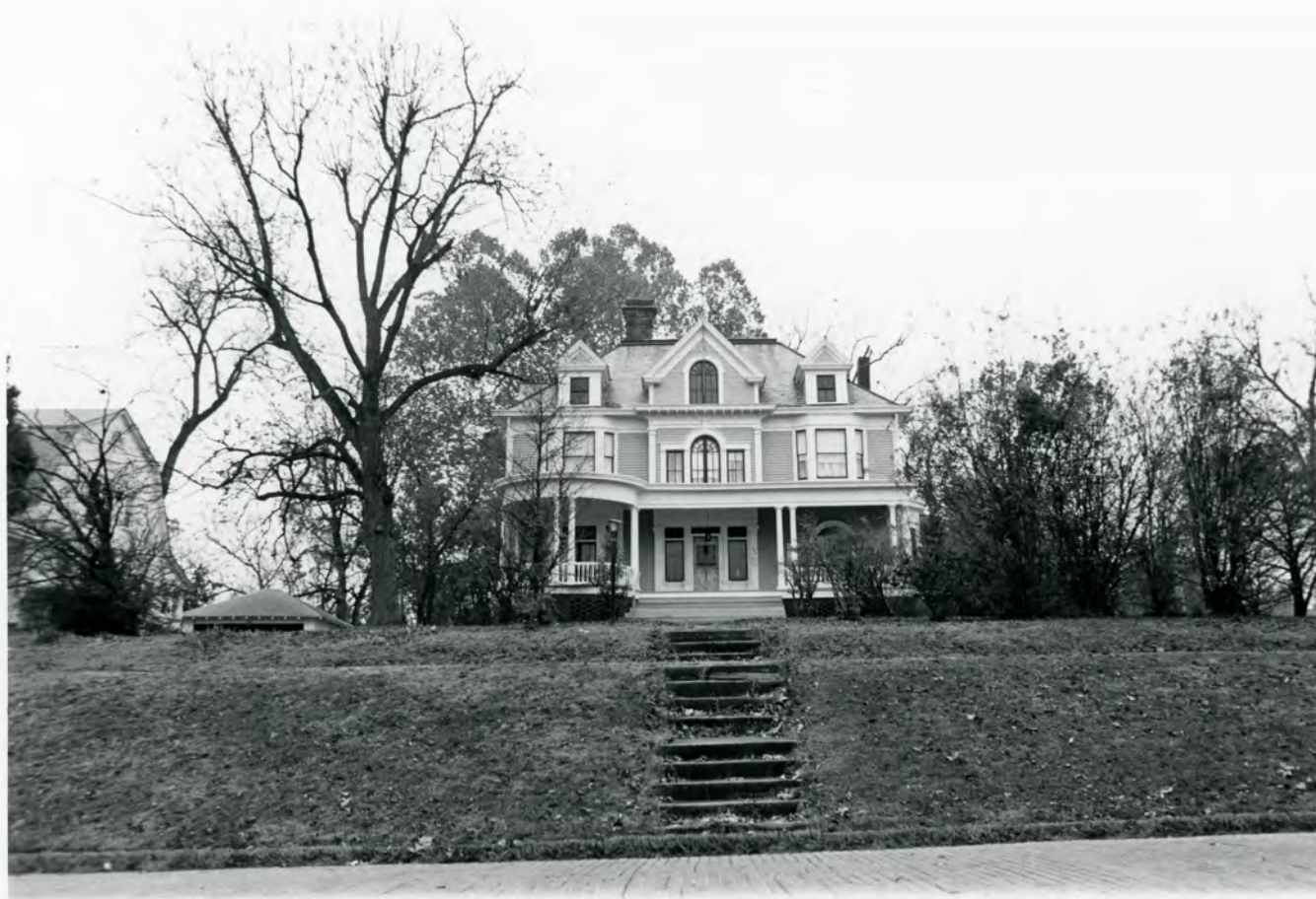
West House Helena, Arkansas November, 1982 Negative on file at AHPP Viewed from the East