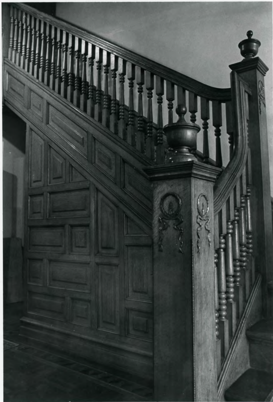
West House Helena, Arkansas November, 1982 Negative on file at AHPP Stairway