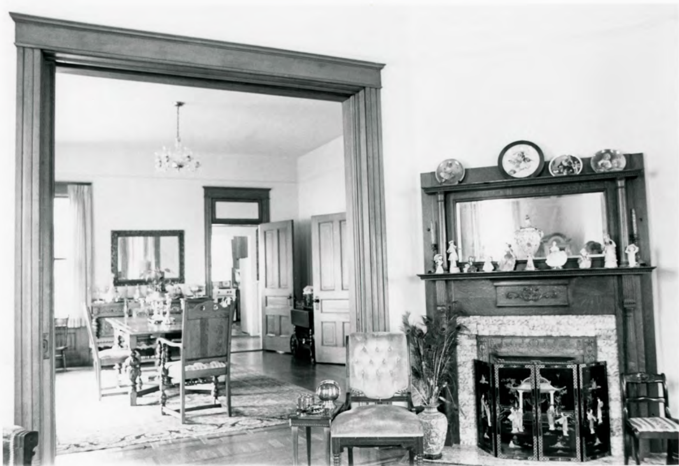
West House Helena, Arkansas November, 1982 Negative on file at AHPP Parlor