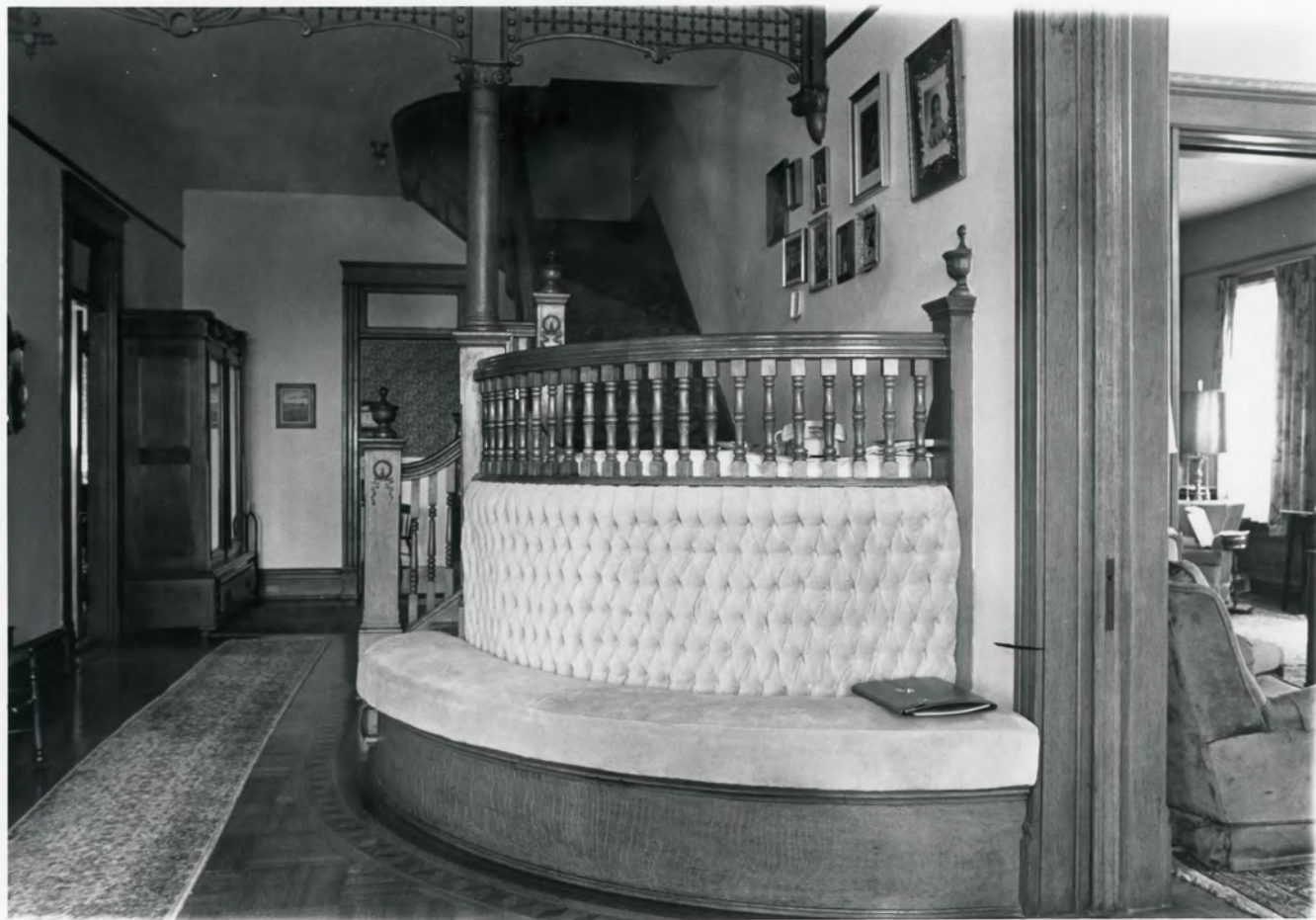
West House Helena, Arkansas November, 1982 Negative on file at AHPP Entry Hall and Stairway