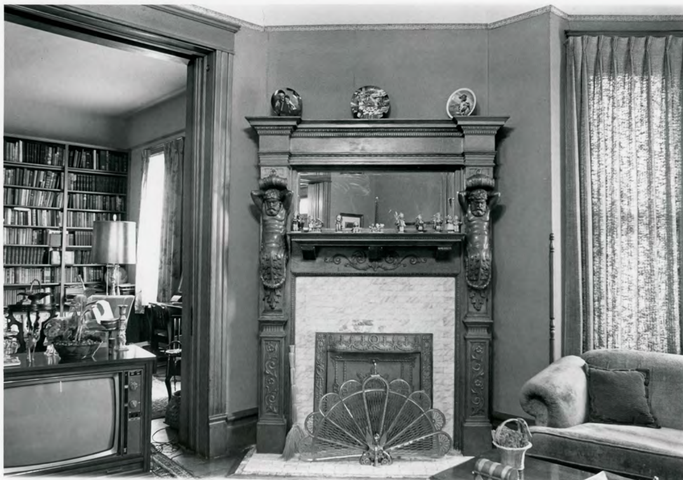
West House Helena, Arkansas November, 1982 Negative on file at AHPP Interior