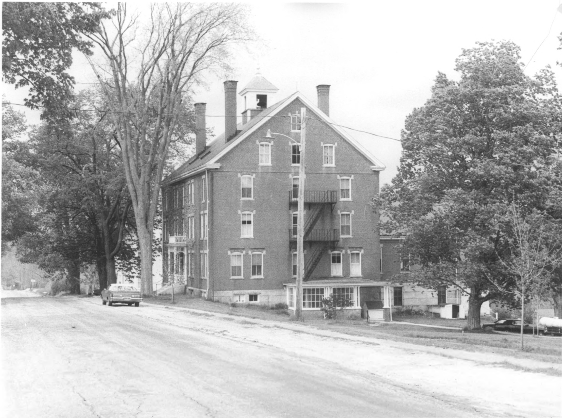
Central Dwelling House, Shaker Village, New Gloucester, Maine.