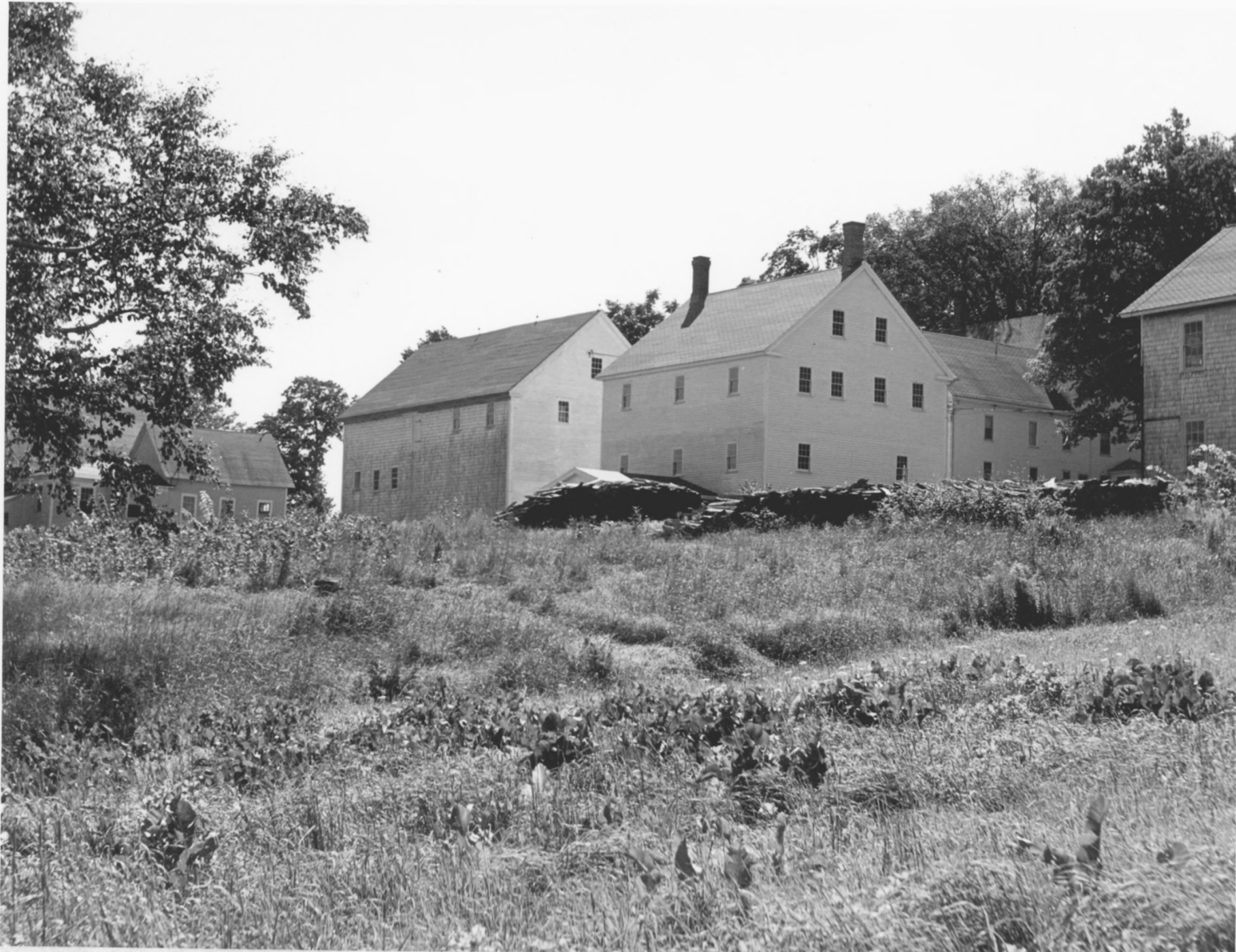
Shops and outbuildings, Shaker Village, Sabbathday Lake, Maine