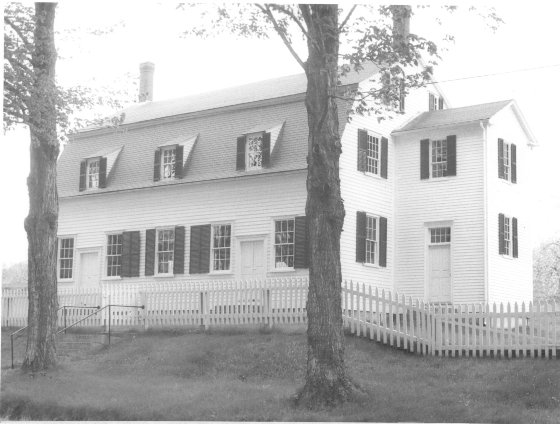
Meeting House, Shaker Village, New Gloucester, Maine