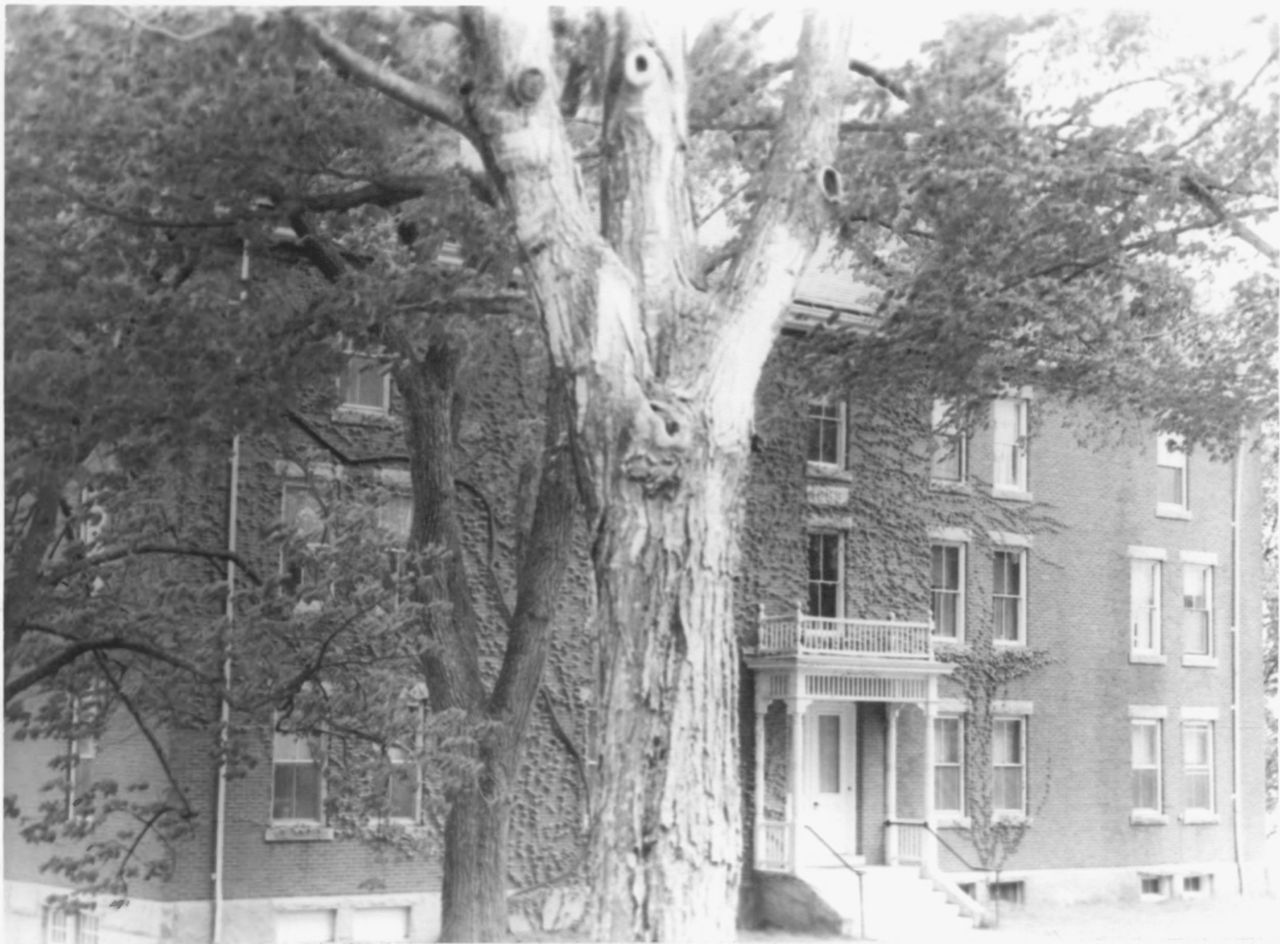
Central Dwelling House, Shaker Village, New Gloucester, Maine