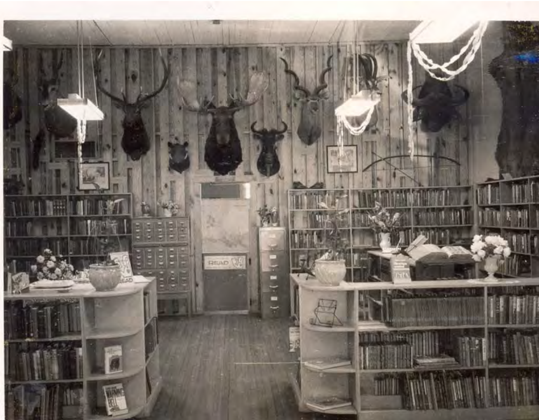
Figure 6. An interior view of the Claiborne Parish Library (circa 1947). The library was the first establishment to be successfully integrated in Claiborne Parish. This took place in 1965.