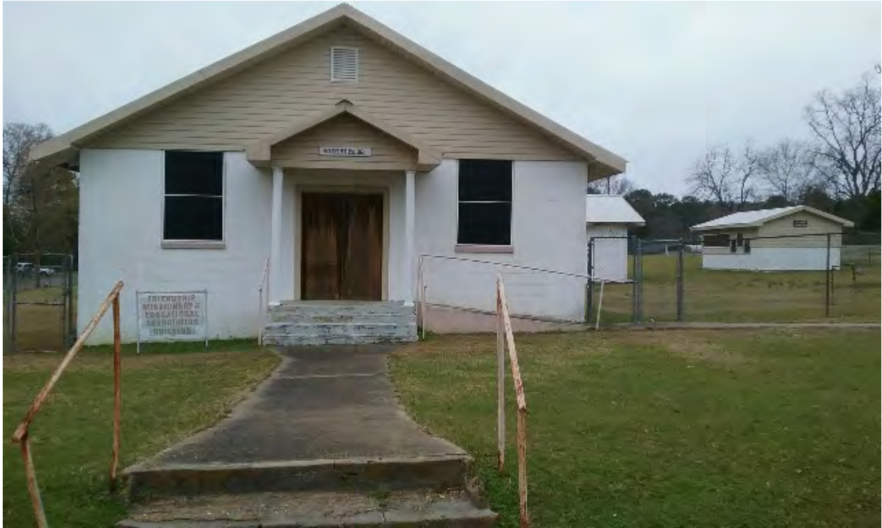
Figure 1. Friendship Missionary and Educational Association Building located in Homer, LA. This building held some of the meetings of the Claiborne Parish Civil League when they weren't being held at Friendship CME Church.

Claiborne Parish, Louisiana County and State