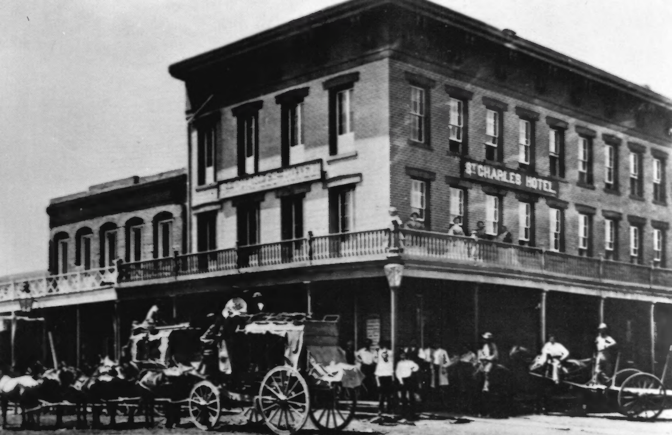
ST CHARLES HOTEL - CARSON CITY, NEVADA