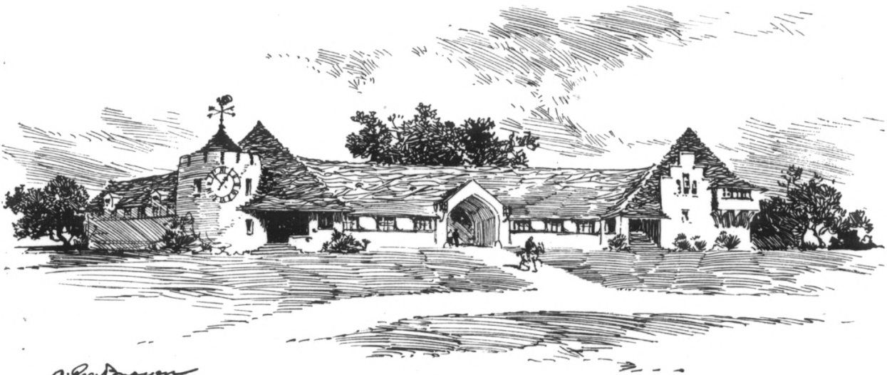
BULINGAME COUNTY CLUB STABLES, A. PAGE BROWN, ARCHITECT.

Moore's Bohemian Club building is not as good a drawing as Moretti generally does. It is anything but clear in color, being heavy and cloudy and reflecting but little credit on