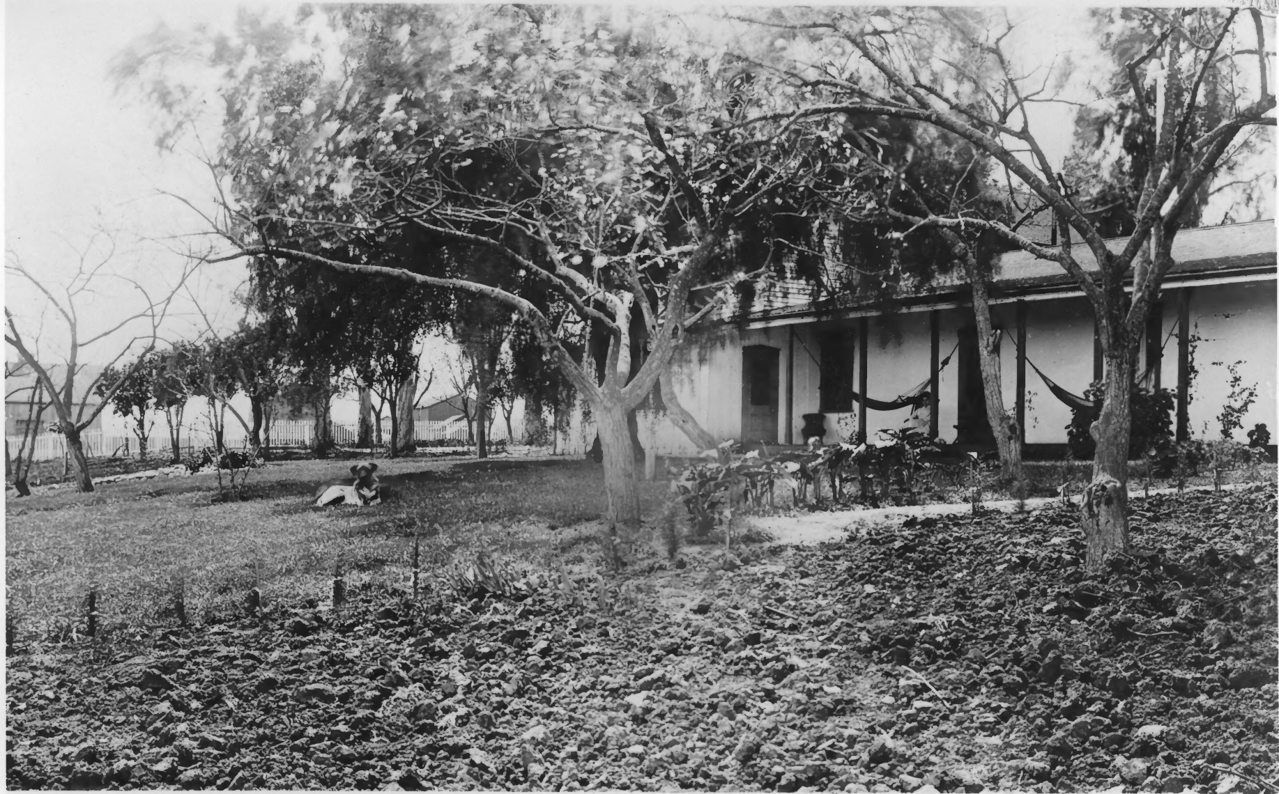
The Adobe in 1889.