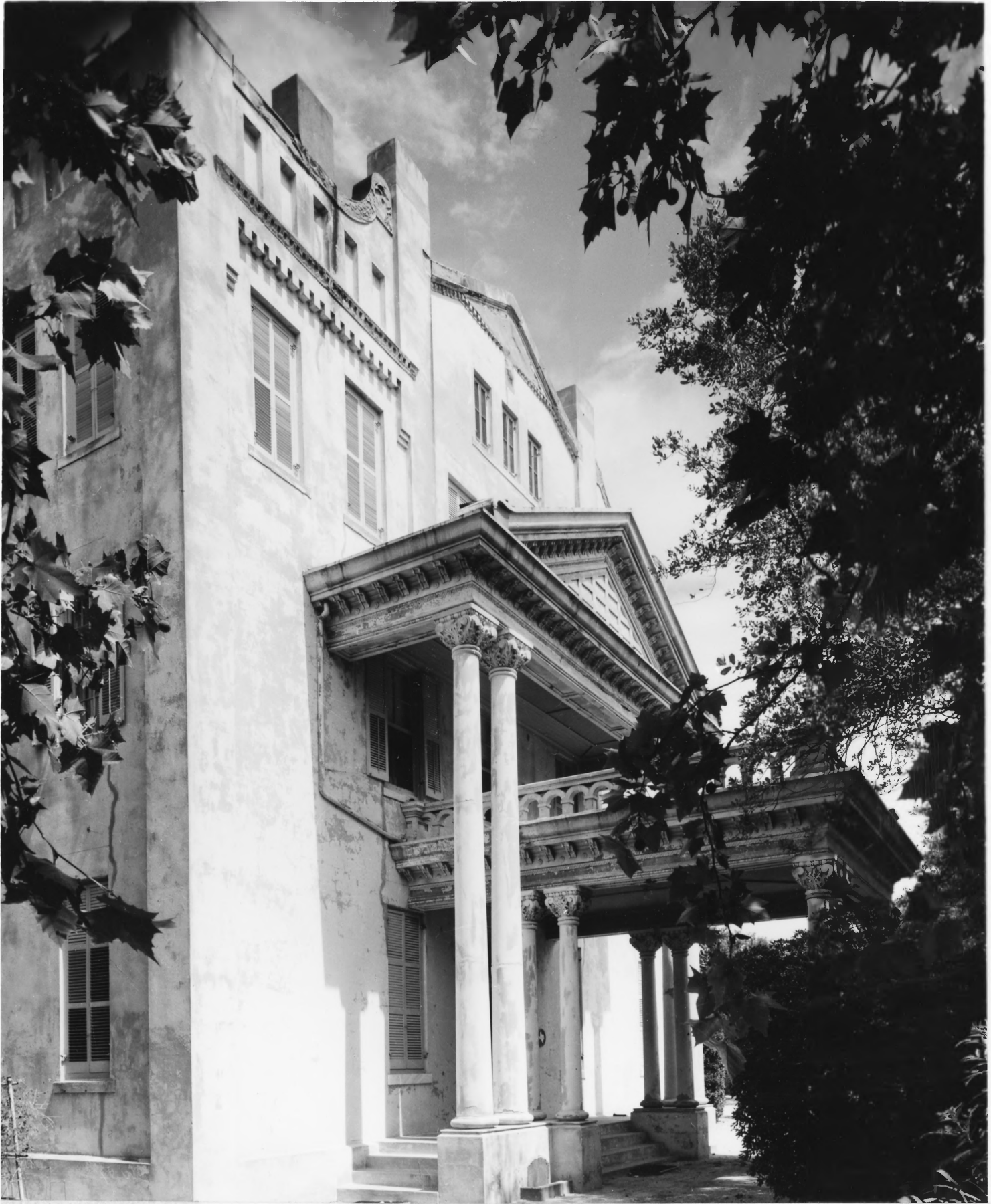
John Henry Hutchings House, Galveston, Texas