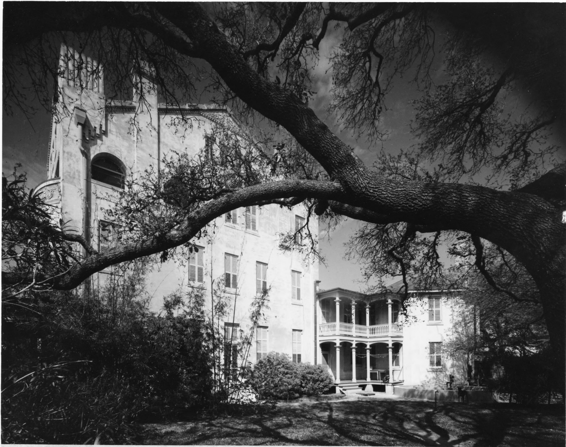
John Henry Hutchings House Galveston, Texas