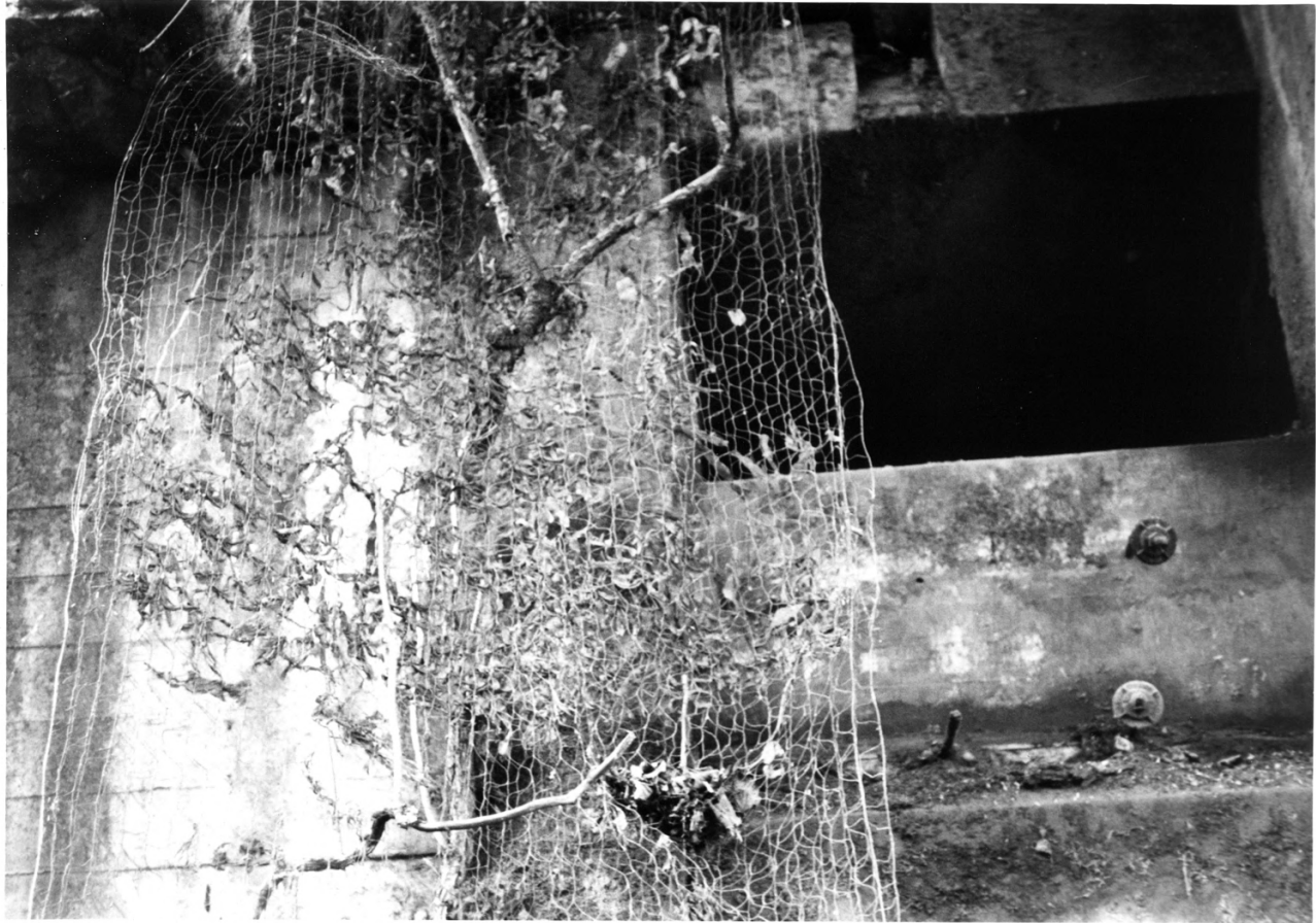
7. Second-floor opening of a large, igloo-type magazine on Makhmati Island. Note the chicken wire and fragments of burlap that camouflaged the face of the magazine.