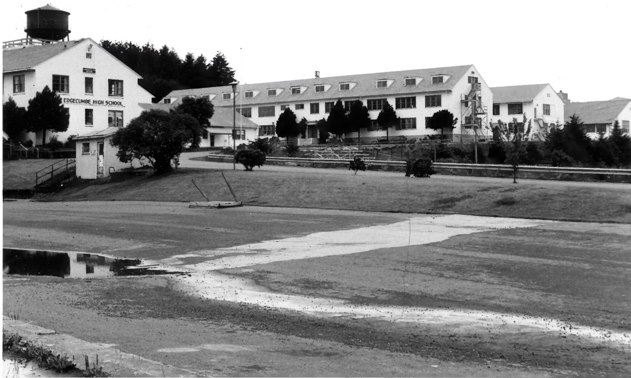
2. Sitka Naval Air Station. On left is the administration building. The building with the dormer windows and the structure behind it served as comfortable barracks. On the right a portion of the mess hall may be seen.