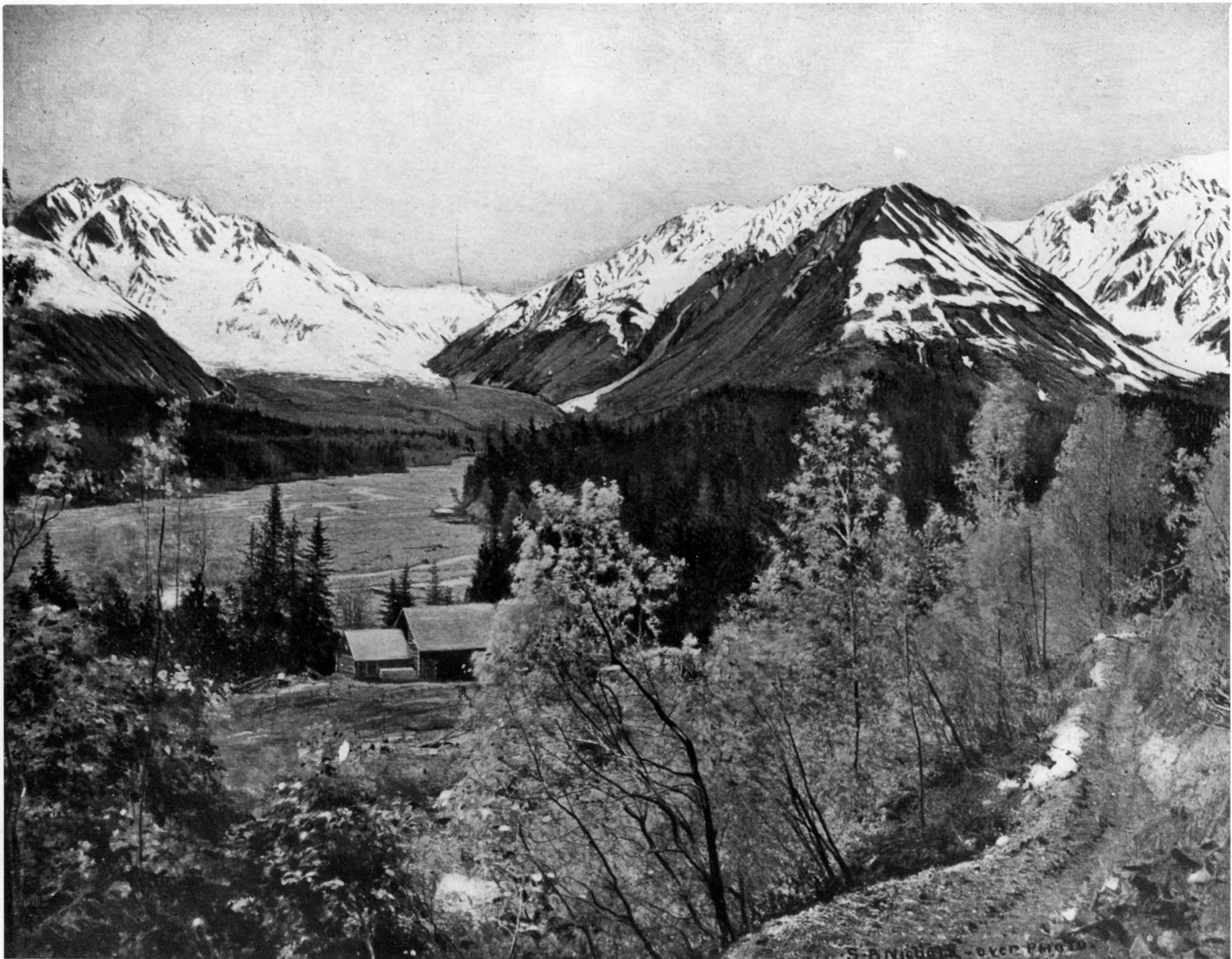
S. B. NICHOLS - OVER PHOTO