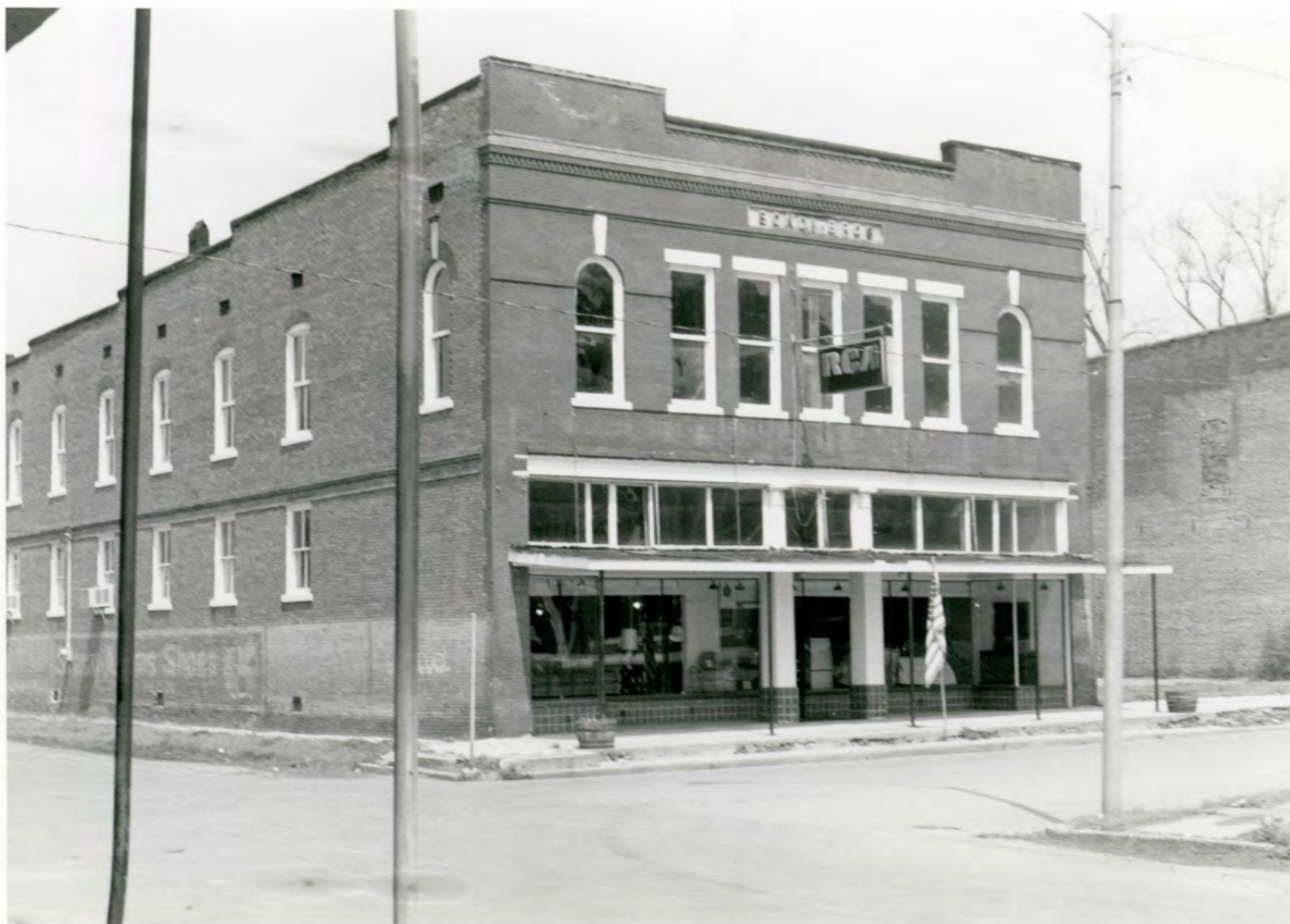
CL-3 Bondi Bros. Store 104 Madison HISTORIC RESOURCES OF CLARENDON Negatives at AHPP Viewed from the Southwest