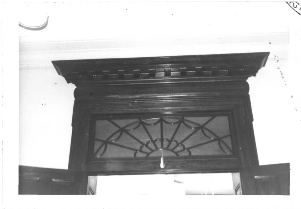
INTERIOR DETAIL - OAK MILLWORK