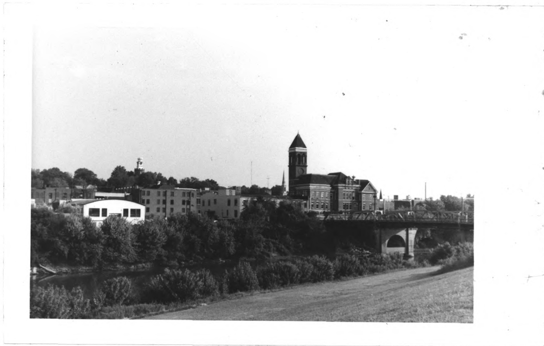
ROME SKYLINE - COURTHOUSE