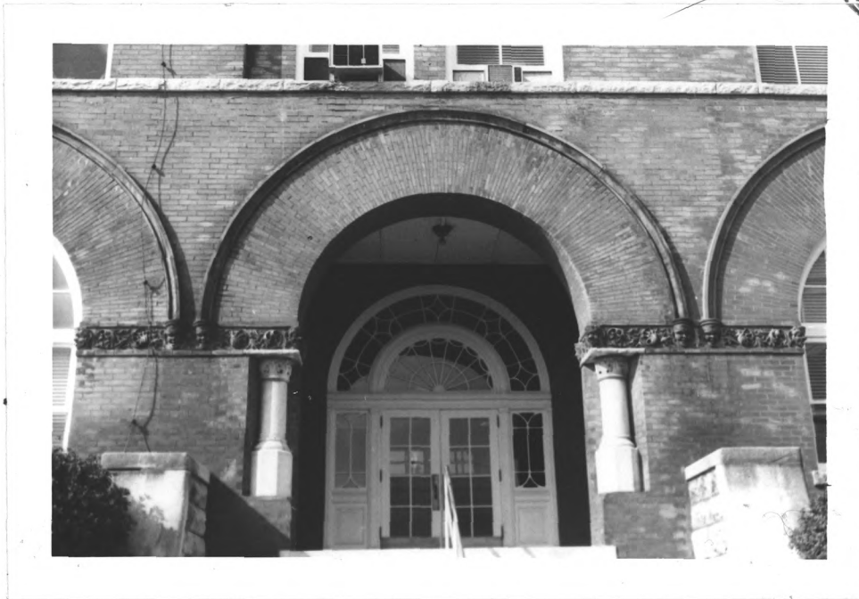
EXTERIOR DETAIL - ENTRANCE