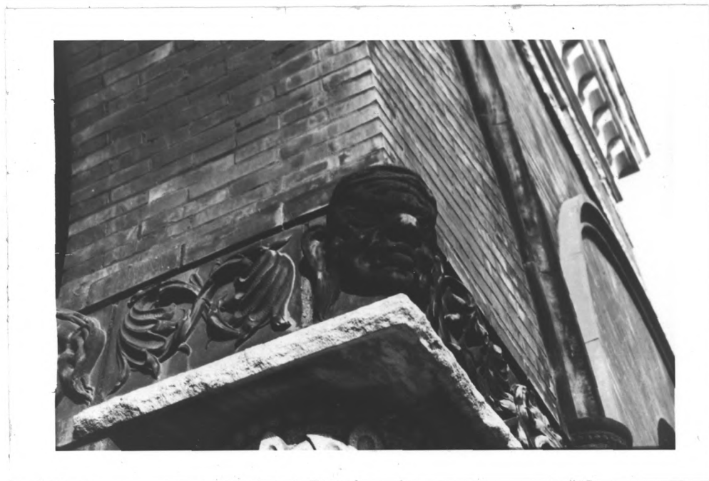
EXTERIOR DETAIL - GARGOYLE