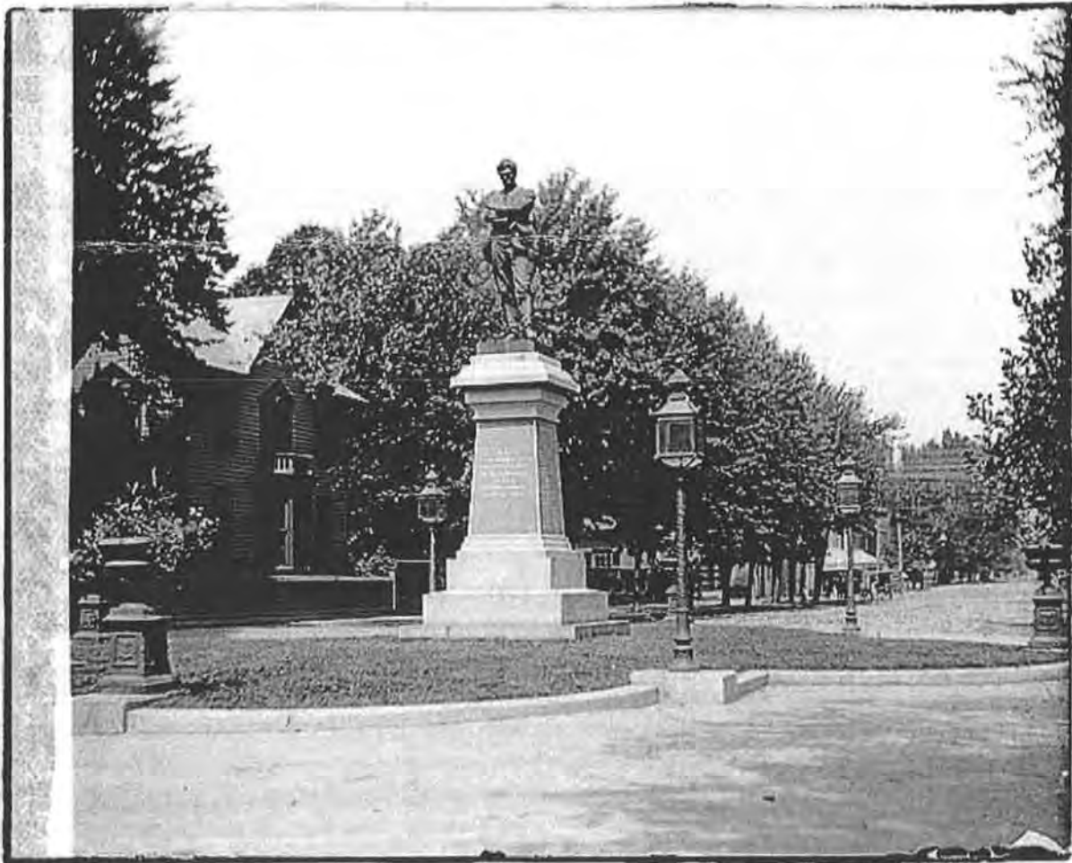
Figure 1. Appomattox Statue, looking north west taken, prior to 1930.