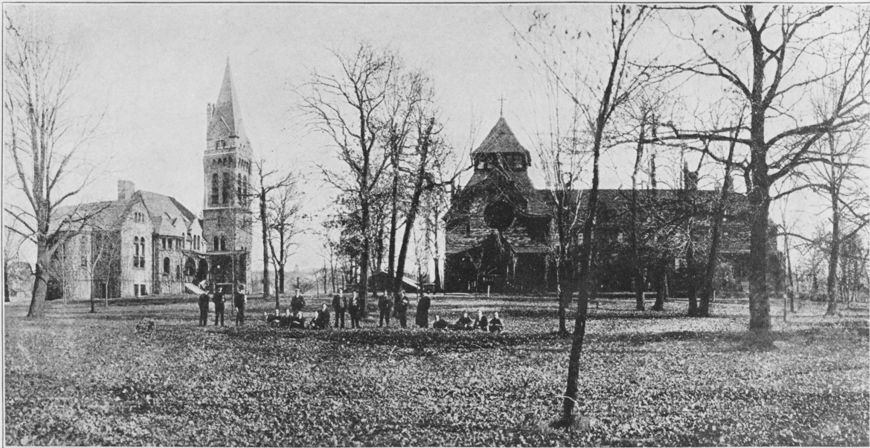
SEABURY DIVINITY SCHOOL, 1858