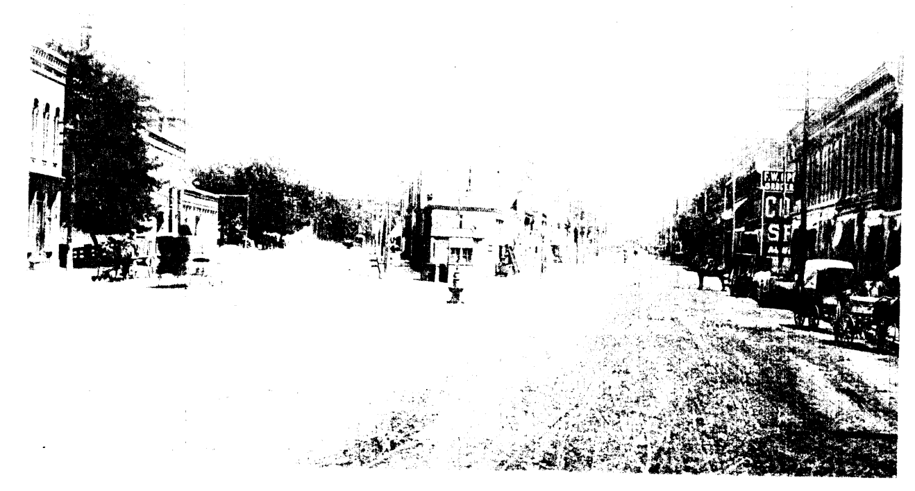
JUNCTION MAIN AND PEARL STREETS.