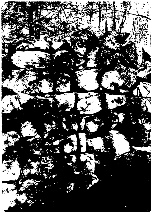
DETAIL OF WALL