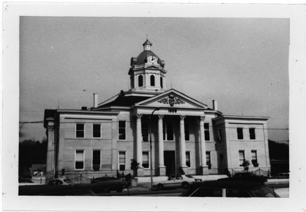
CHATTOOGA COUNTY COURTHOUSE

One of the finest buildings in Chattooga County, this courthouse faces the main street of town and is an architectural focal point for Summerville.