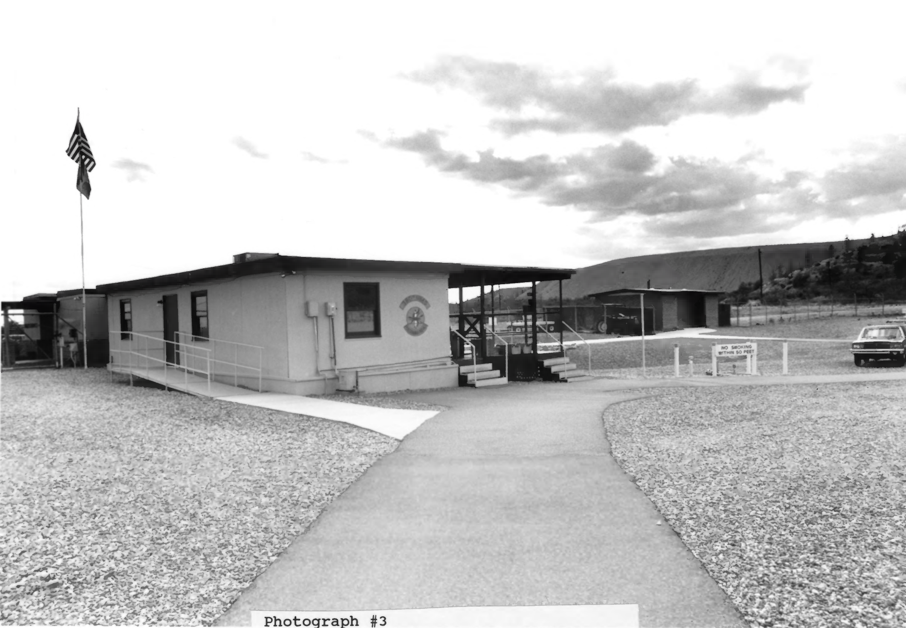
Photograph #3 Titan II ICBM Missile Site 8 (571-7) Green Valley, Pima Co., Arizona Museum at left foreground, restroom at center background. David K. Stumpf, 1992