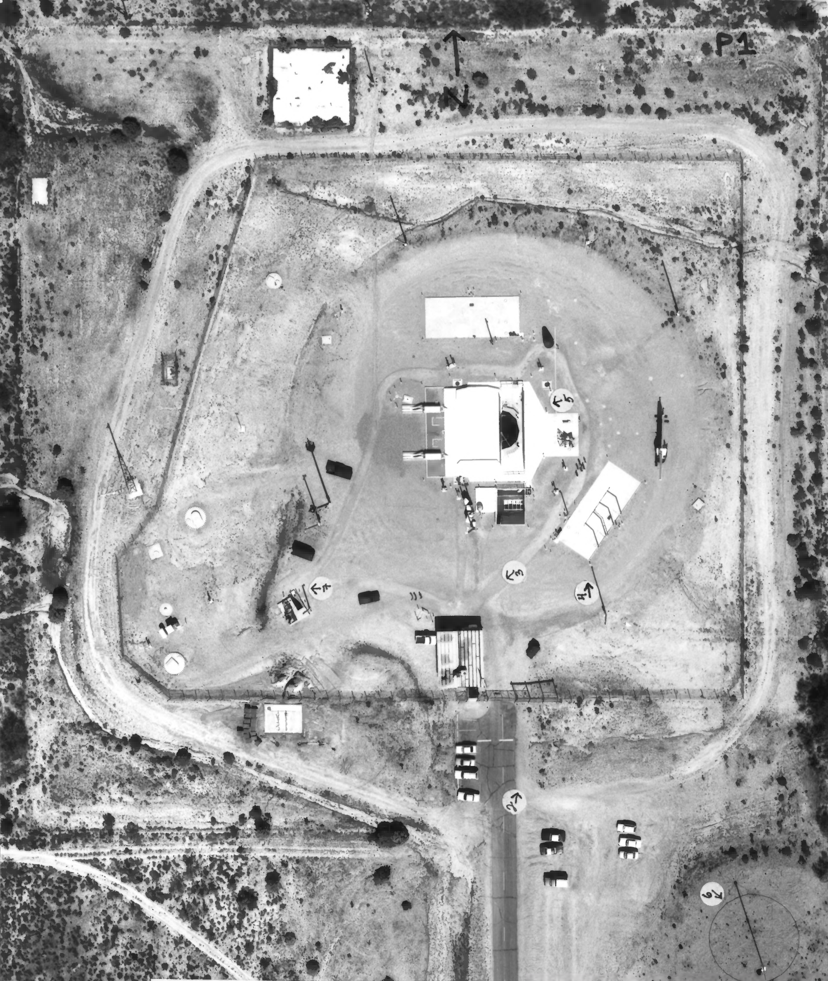
Photograph #1 Titan II ICBM Missile Site 8 (571-7) Green Valley, Pima Co., Arizona Aerial view during conversion of site to a museum. (Angles of photographs #2 - #7 are indicated) Cooper Aerial Survey, Tucson, AZ, 1987