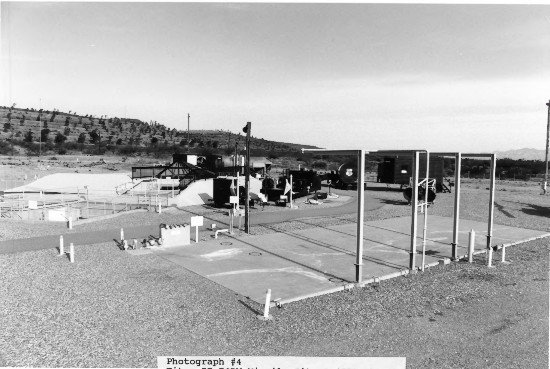
Photograph #4 Titan II ICBM Missile Site 8 (571-7) Green Valley, Pima Co., Arizona Looking northwest across fuel hardstand and silo closure door. David K. Stumpf, 1992