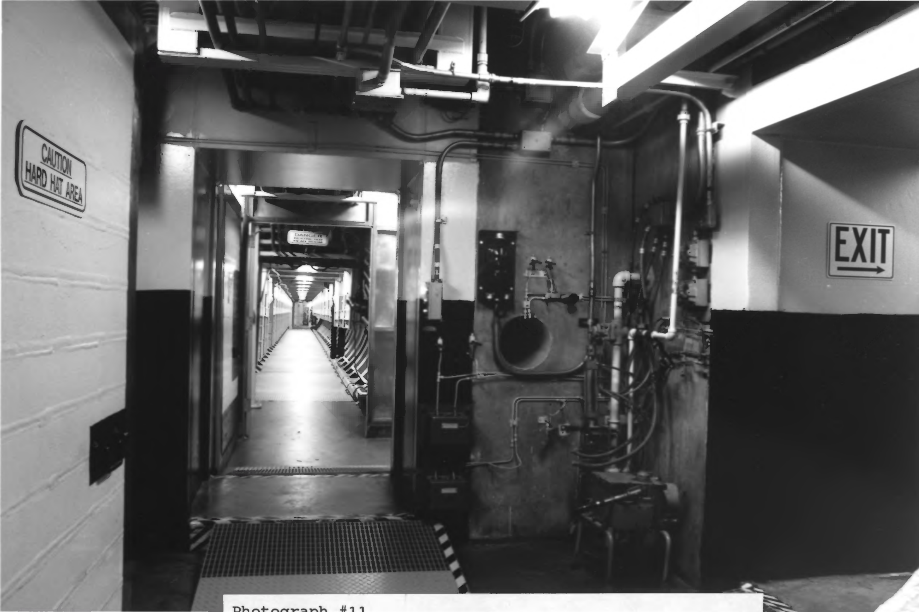
Photograph #11 Titan II ICBM Missile Site 8 (571-7) Green Valley, Pima Co., Arizona View from Blast Lock area, down 205' cableway to silo. David K. Stumpf, 1992