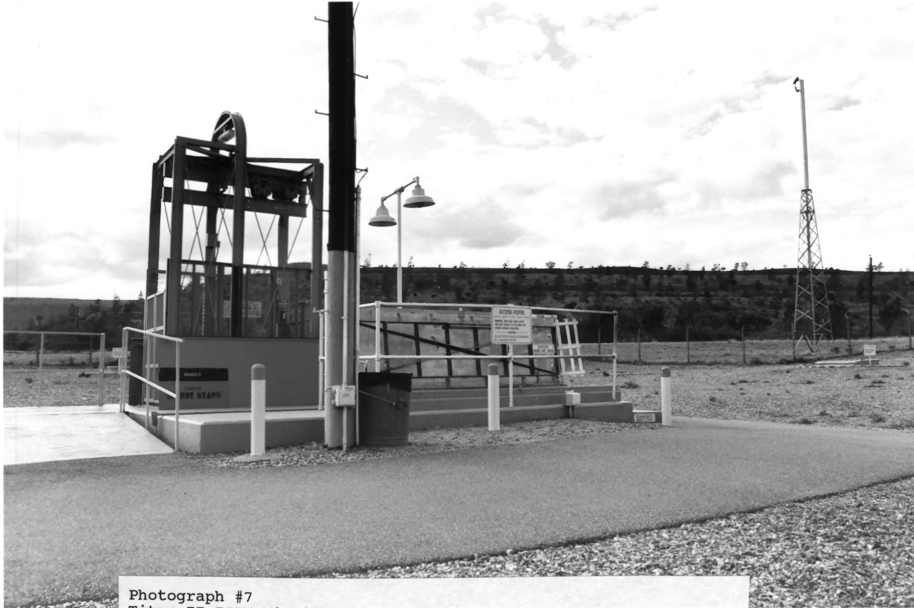
Photograph #7 Titan II ICBM Missile Site 8 (571-7) Green Valley, Pima Co., Arizona Access portal with elevator raised. IRCS antenna (non-contiguous contributing resource) in right background. David K. Stumpf, 1992