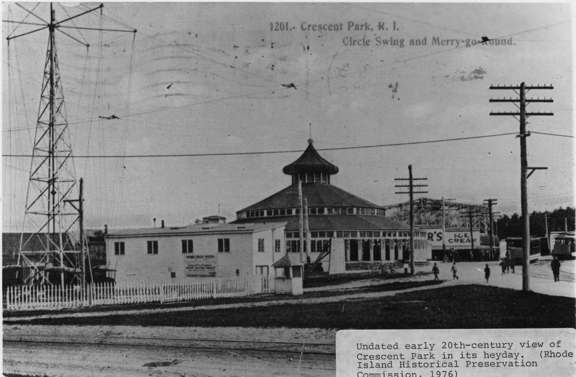
Undated early 20th-century view of Crescent Park in its heyday.