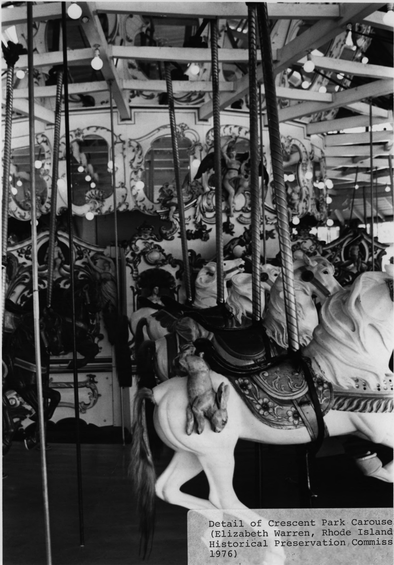
Detail of Crescent Park Carousel.