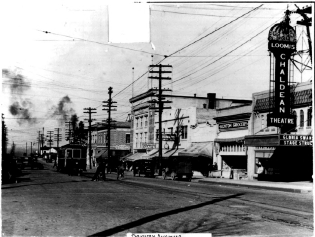
Denver Avenue North from Schofield St.