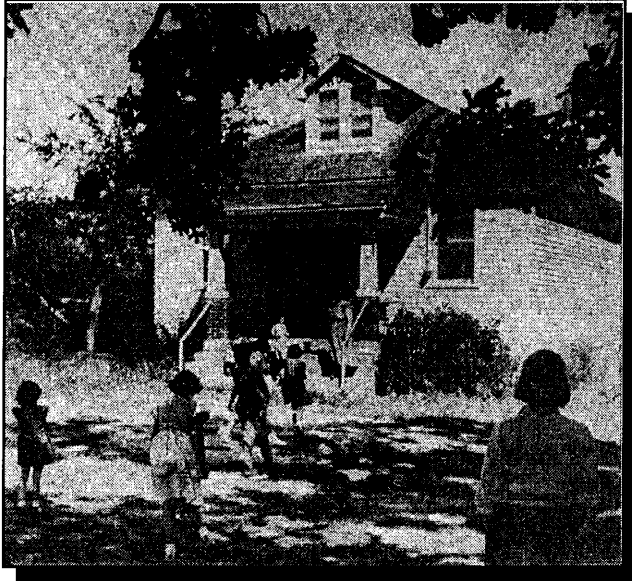
From Leavenworth Times , 3 September 1952.

the Hund School grounds was salty due to nearby Salt Creek, the students had to make daily trips to the nearby Hund residence for water.