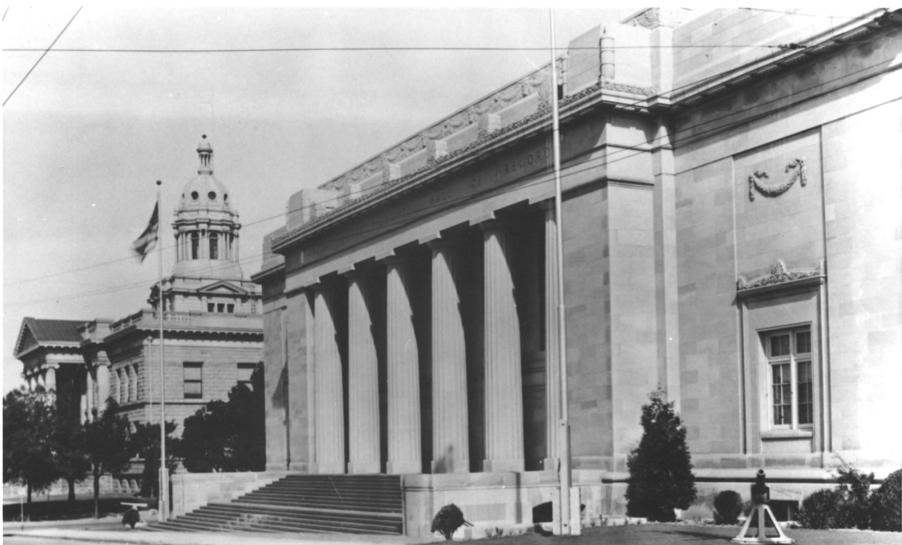
Hall of Records and Court House, Martinez, Calif.