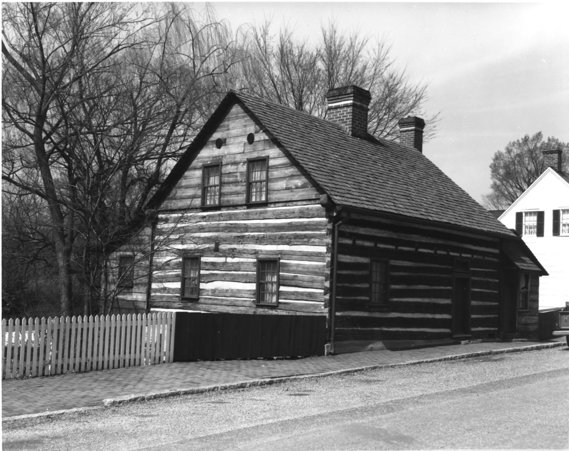
Old Salem Historic District, North Carolina, - Lick-Bonner House