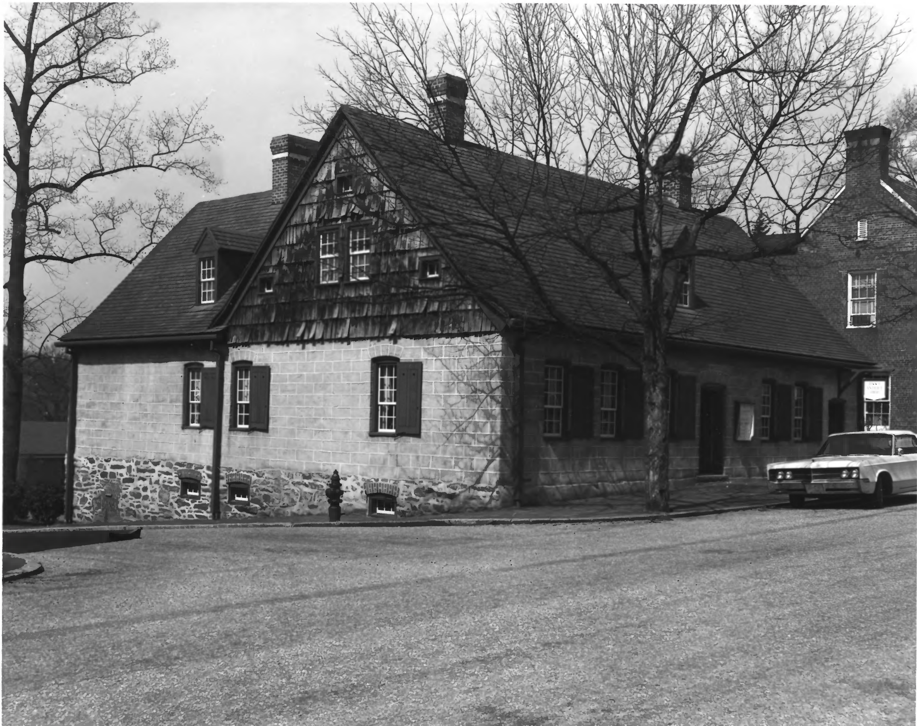
Old Salem Historic District, North Carolina, - Community Store