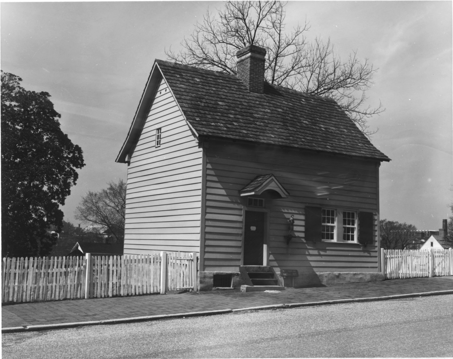
Old Salem Historic District, North Carolina - Miksch Tobacco Shop