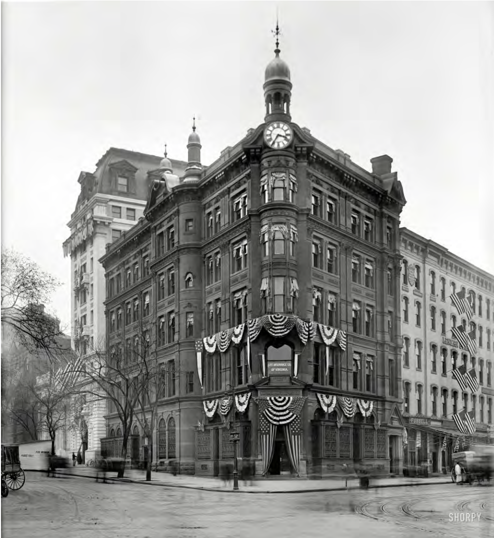
National Savings and Trust Co., 15 th and New York Avenue, circa 1912. View looking east showing the Swartzell, Rheem and Hensey Co. at 727 15 th Street, to left of National Savings and Trust Co. building.