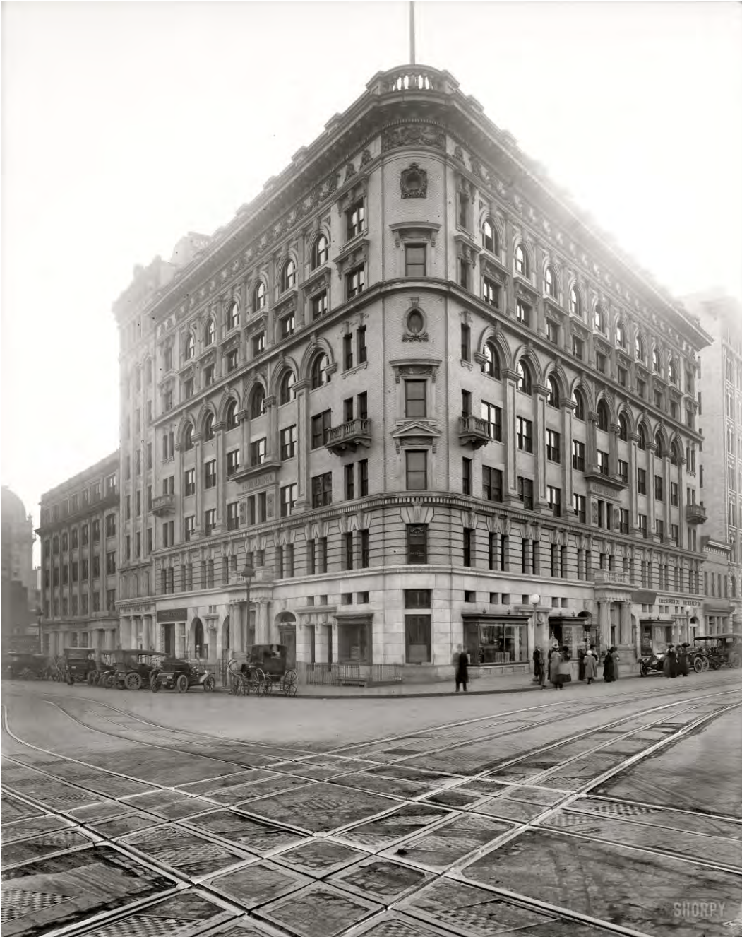
Historic view of the Bond Building at 14 th and New York Avenue, ca. 1915 ( www.shorpy.com )