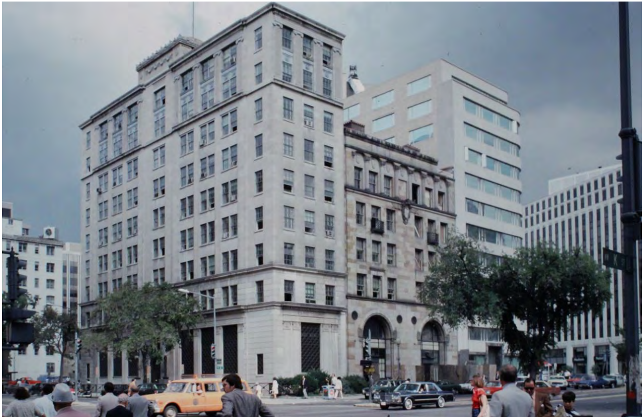
View looking at north side of K Street, ca. 1980, showing the Wire building at 15 th and Vermont Avenue and now-demolished office buildings next to it.