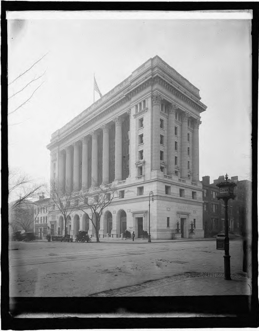
Historic View of Union Trust Building, ca 1915