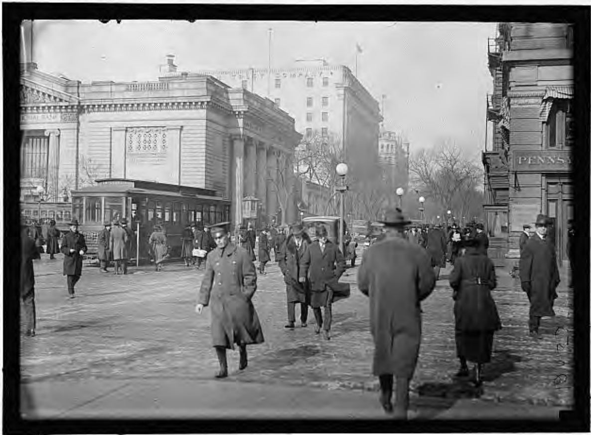
Historic view looking northwest on 15 th Street from New York Avenue showing American Security and Trust Company building at 1501 Pennsylvania Avenue on left and Union Trust Company building beyond it at center of photograph