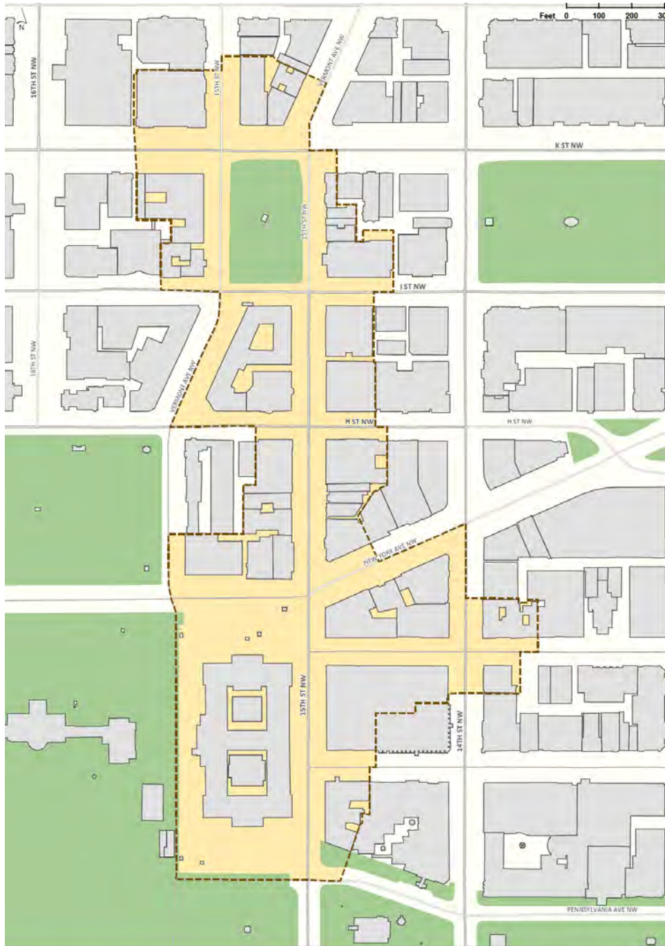
Financial Historic District