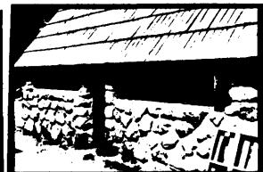
EAST ELEV. 8-3-84