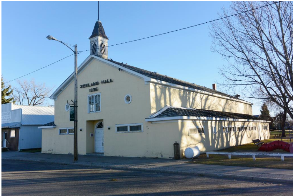
2 - Southwest corner of hall, from southwest