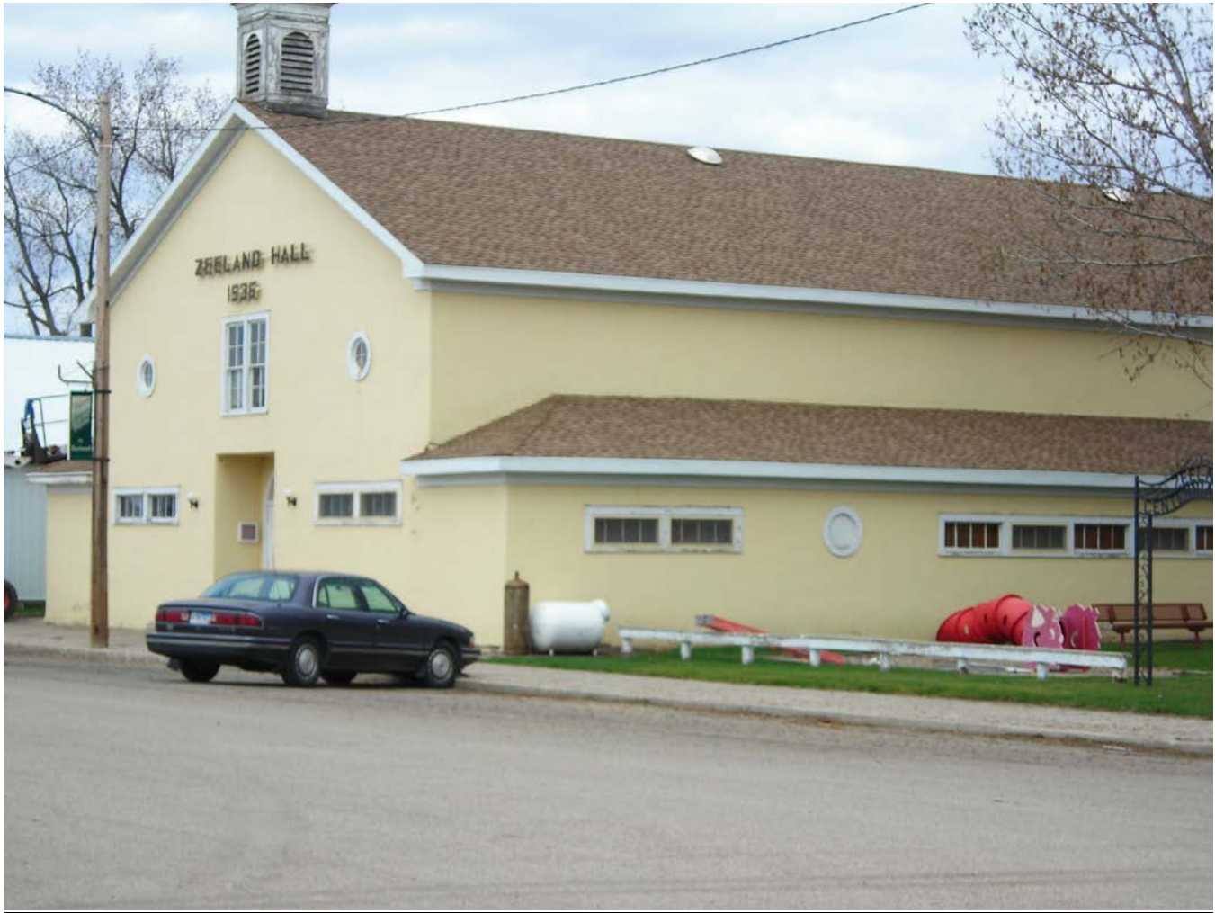
9 – From southwest after recent shingle replacement