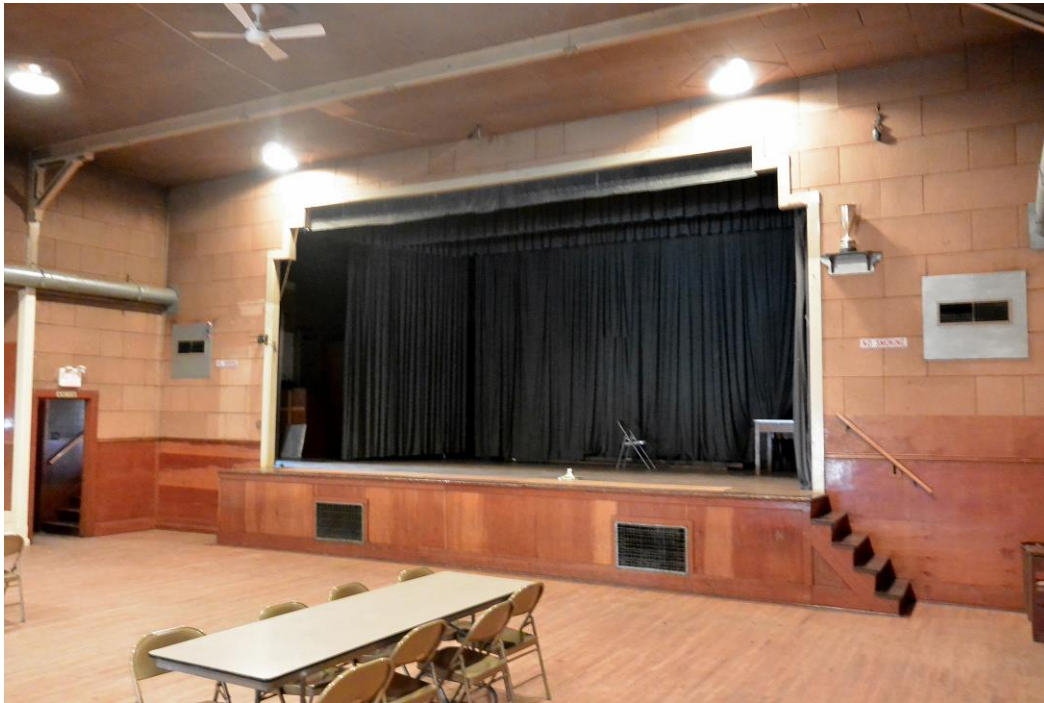
7 - Interior of hall, from southwest