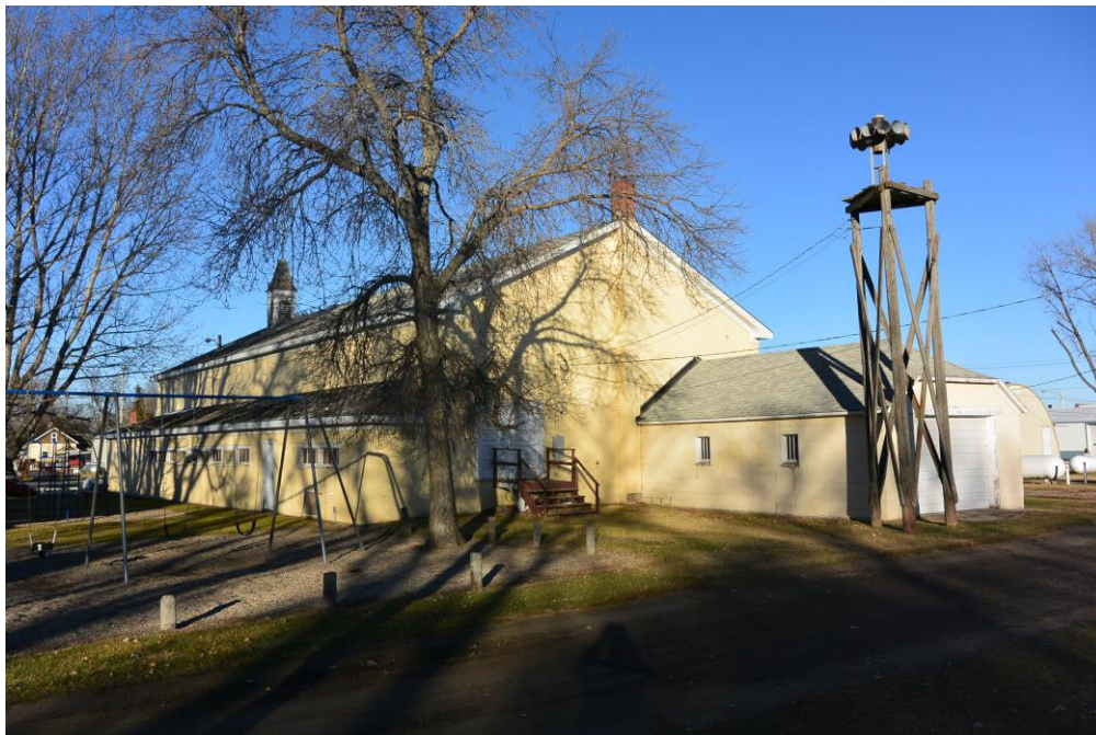
3 - Southeast corner of hall, from southeast