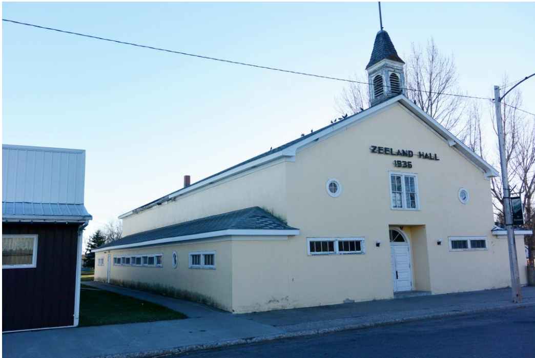
5 - Northwest corner of hall, from northwest