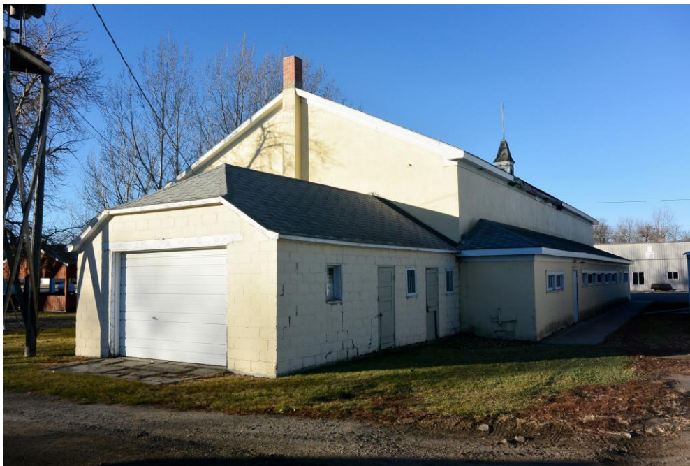
4 - Northeast corner of hall, from northeast