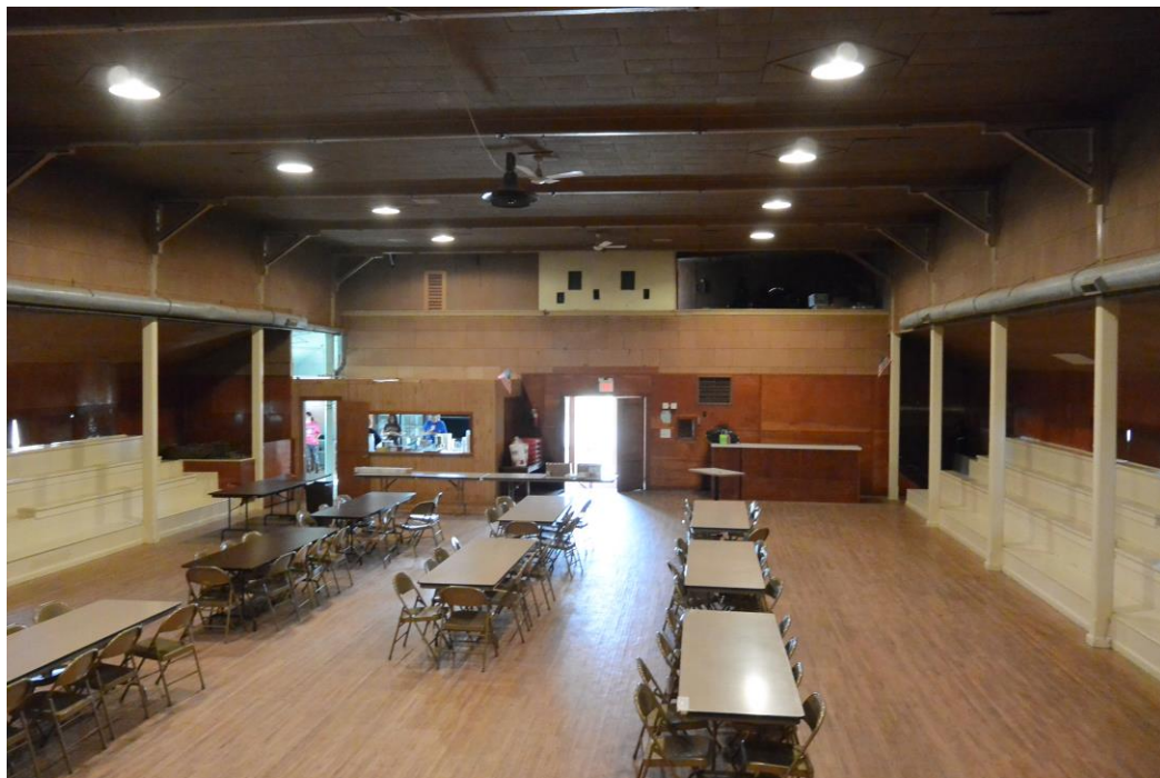
8 - Interior of hall, from east (from the stage)