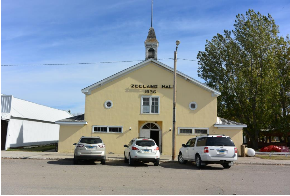
1 - Front of hall, from west