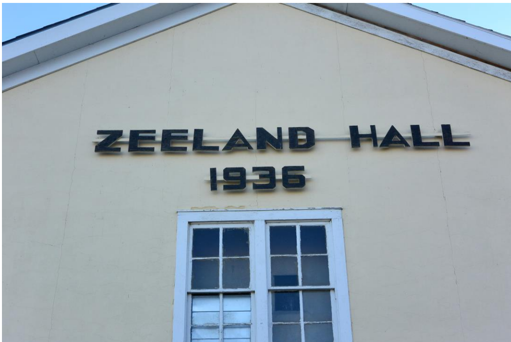
6 - Front gable of hall, from west