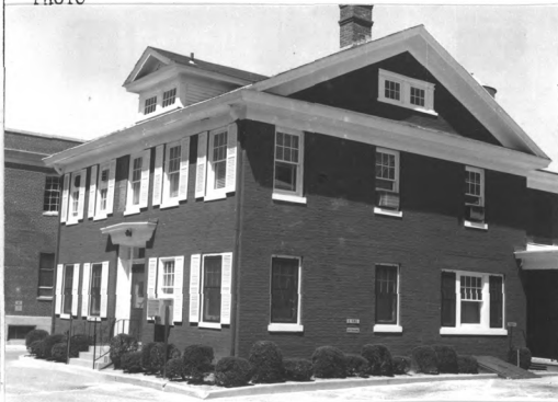
(11) Ocean County Jail Old Village of Toms River Multiple Resource Nomination Photographer: Charles Gaertner Date of photo: Spring 1978 Negative: Ocean County Museum View: Northwest