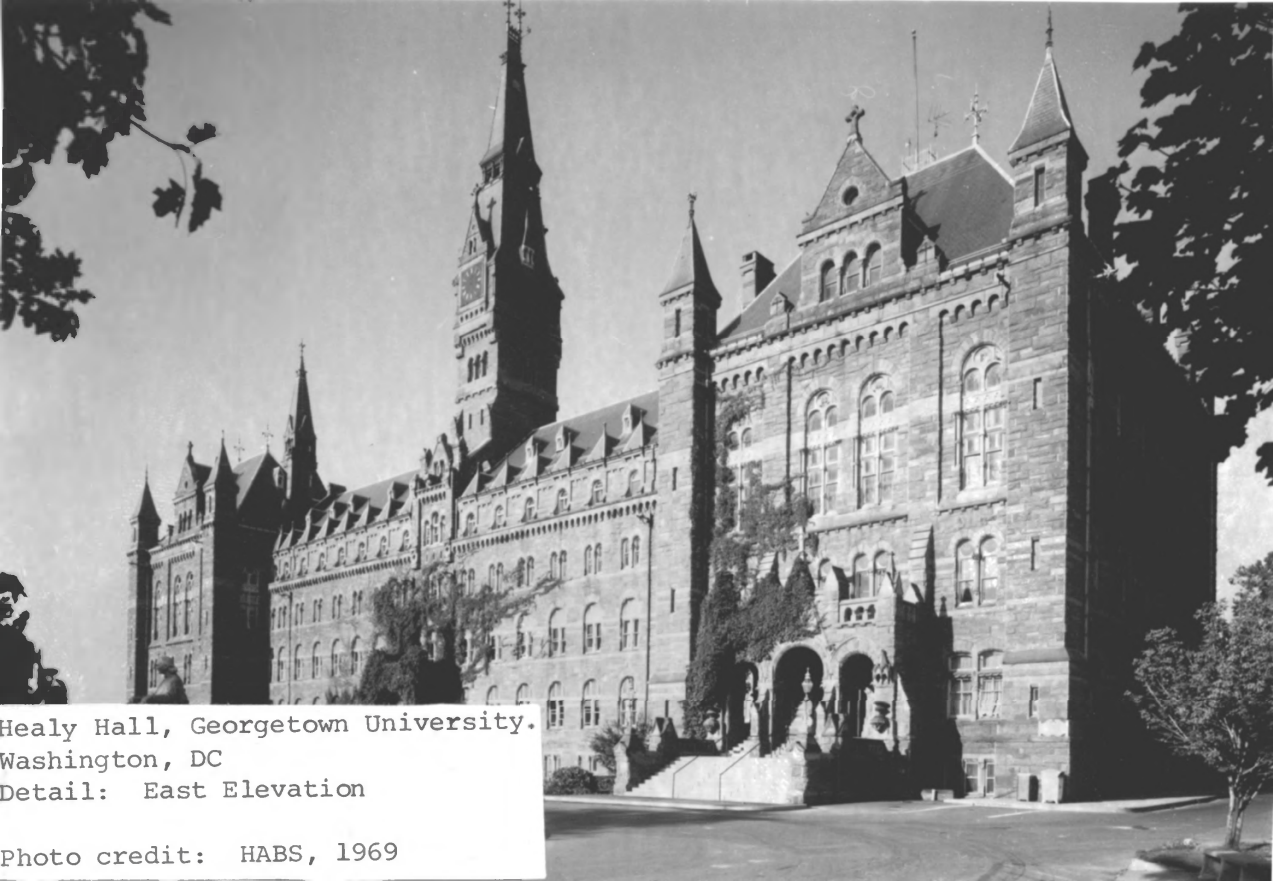
Healy Hall, Georgetown University. Washington, DC Detail: East Elevation