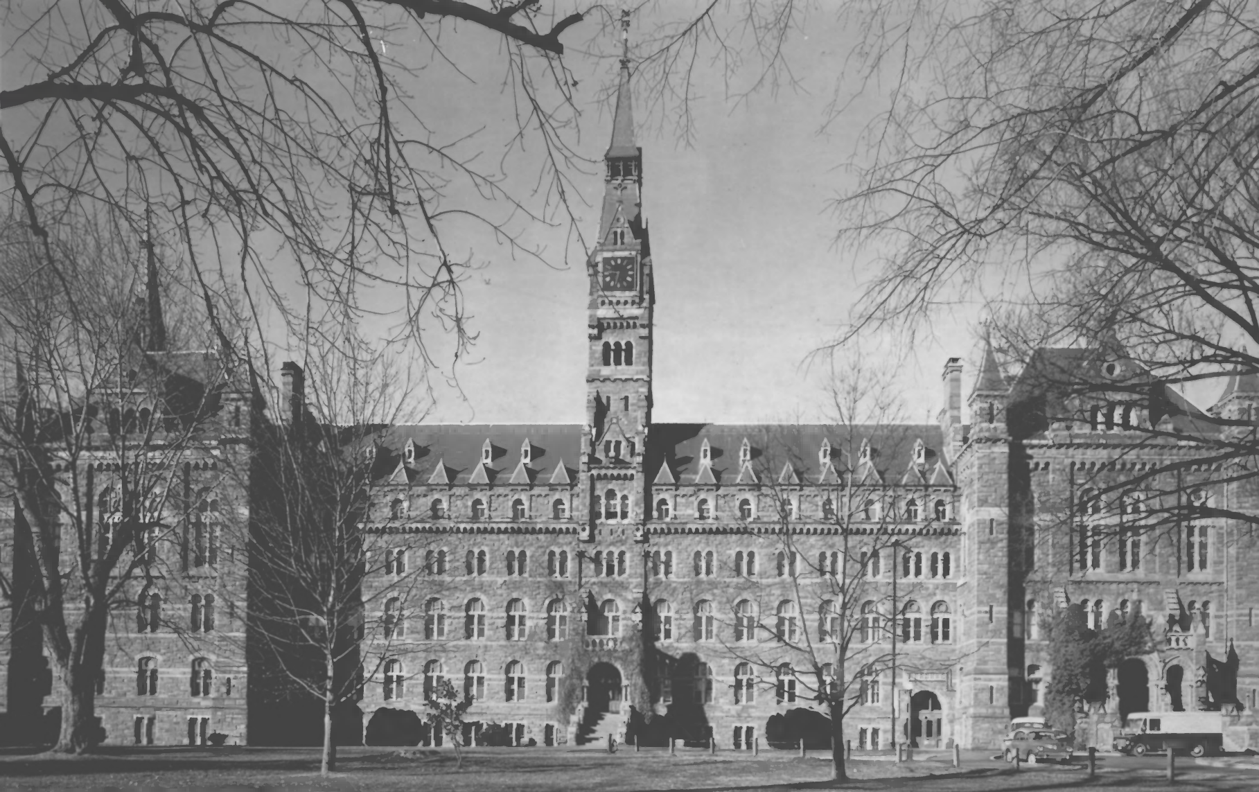
Healy Hall, Georgetown University. Washington, DC Detail: East Facade