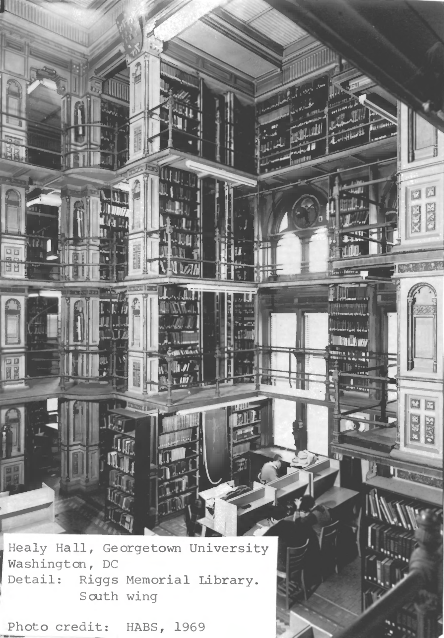
Healy Hall, Georgetown University Washington, DC Detail: Riggs Memorial Library. South wing