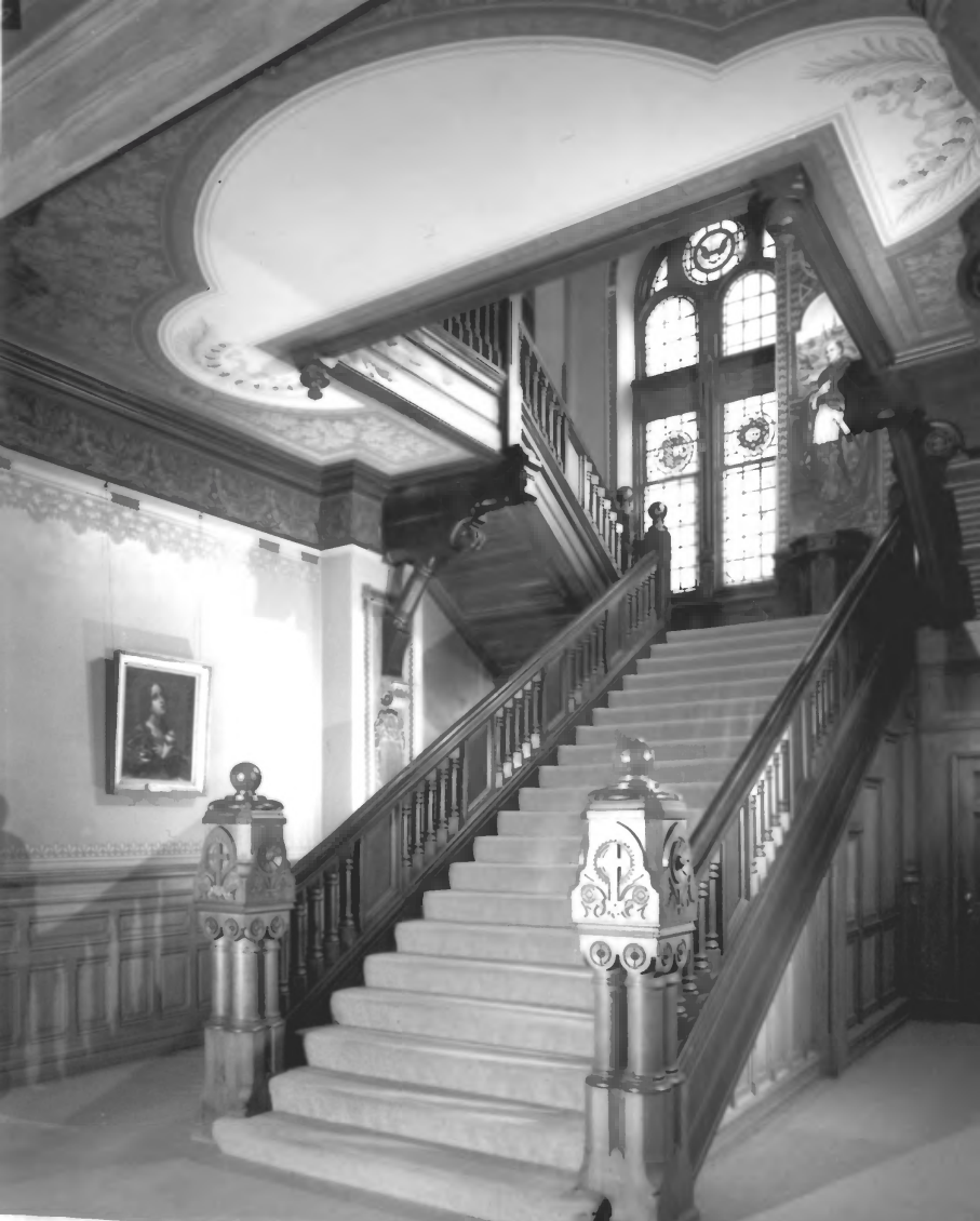
Healy Hall, Georgetown University Washington, DC Detail: Main stair, north pavilion