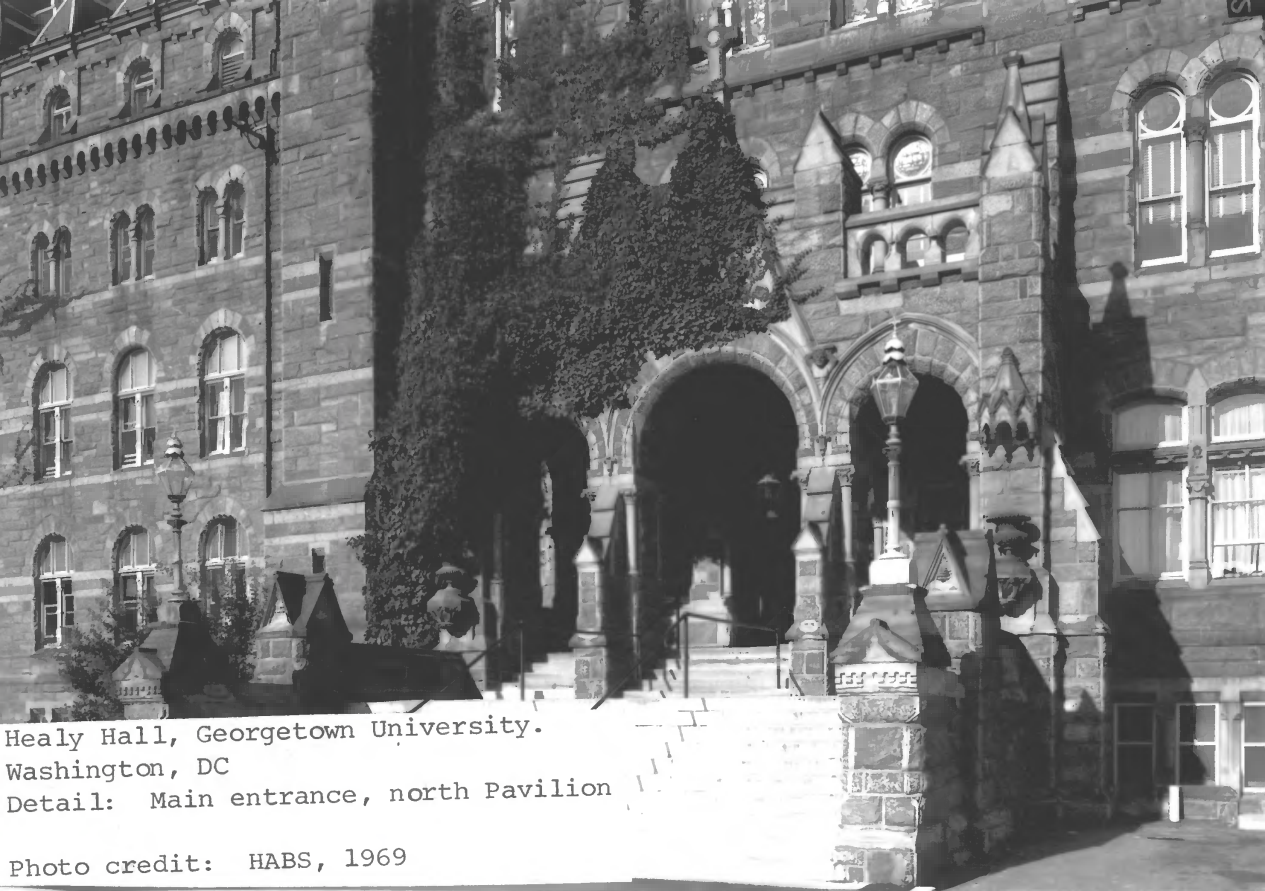
Healy Hall, Georgetown University. Washington, DC Detail: Main entrance, north Pavilion