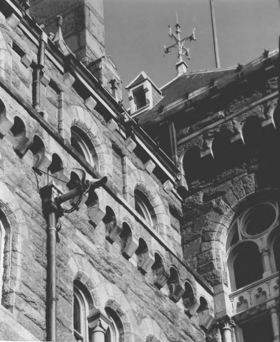
Healy Hall, Georgetown University Washington, DC Detail: East facade