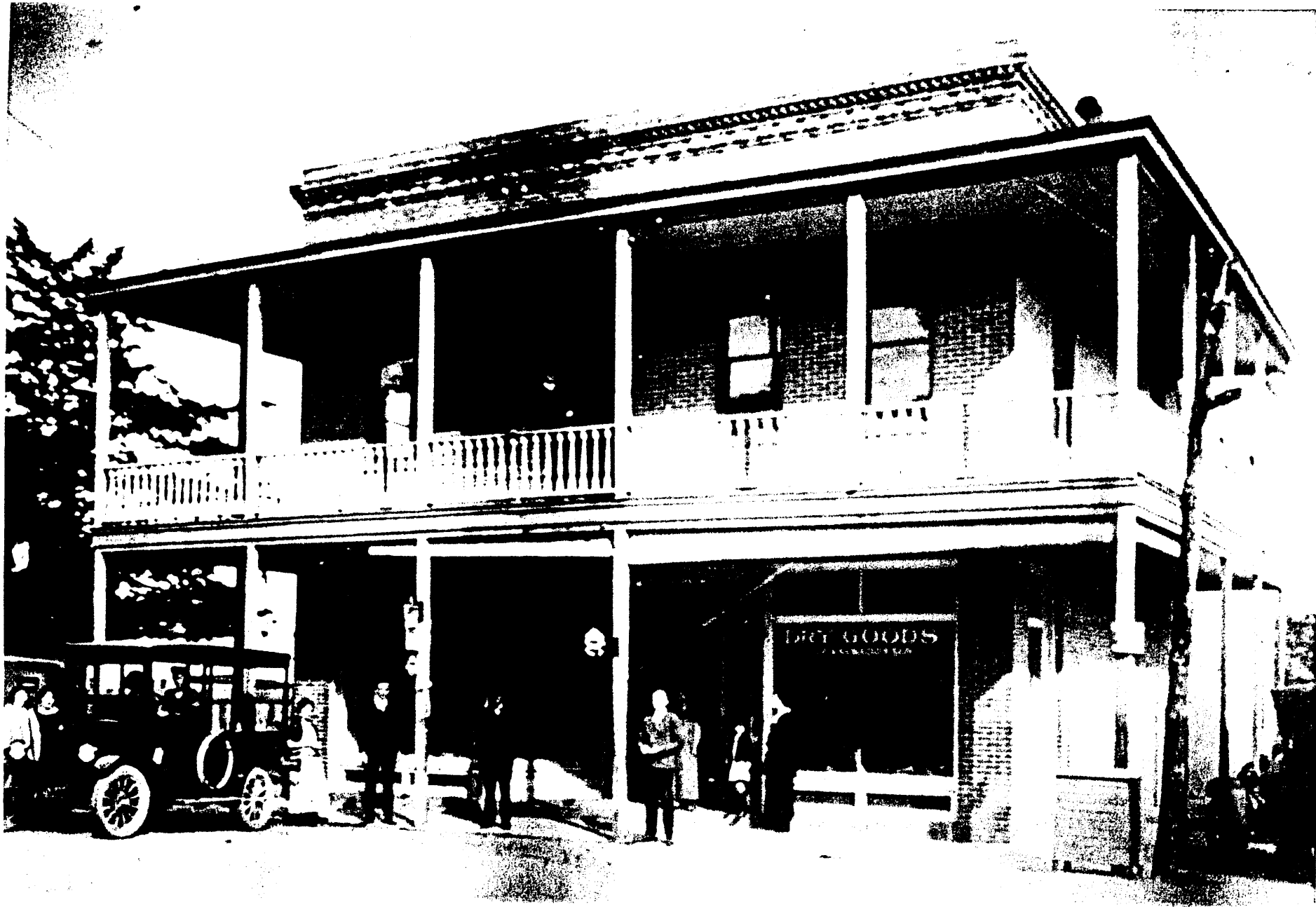
Varnado Store (Washington Parish, LA) prior to 1925 remodeling.