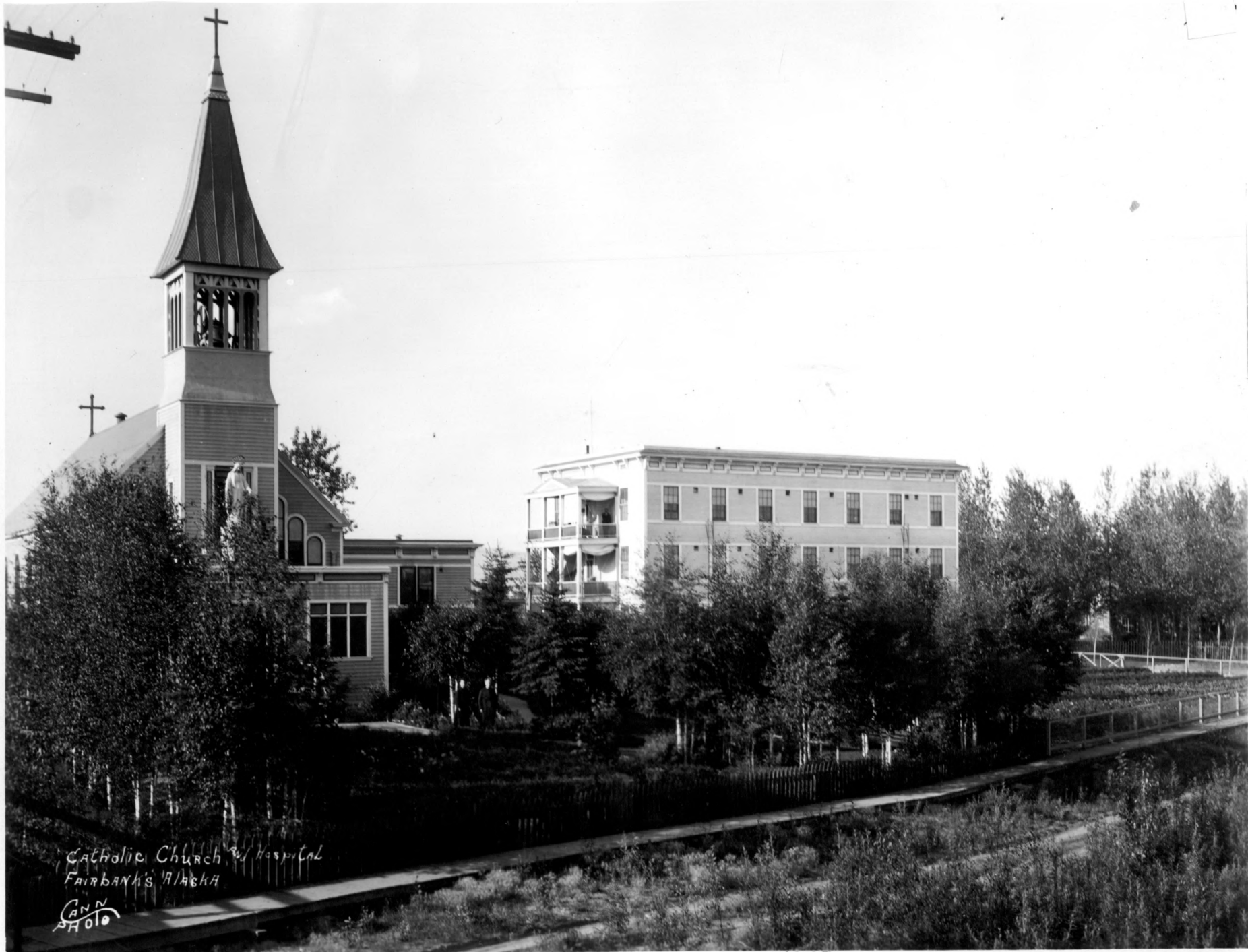
Catholic Church & Hospital Fairbanks, Alaska