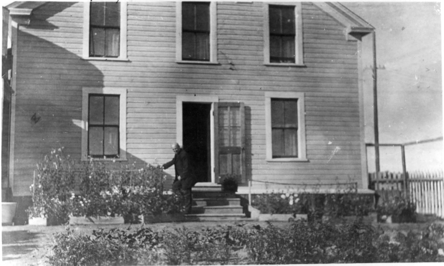
#1 REAR OF CHURCH OLD LOCATION FAIRBANKS