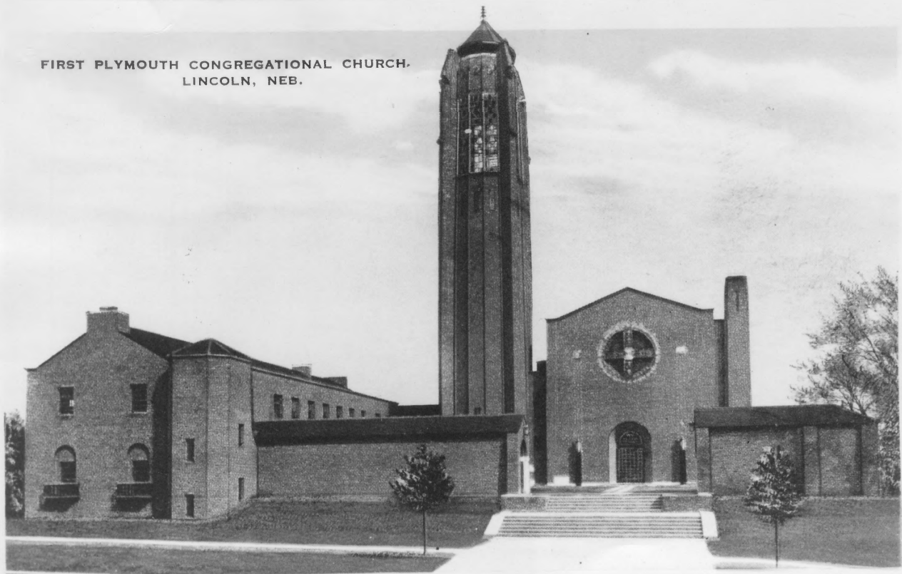
FIRST PLYMOUTH CONGREGATIONAL CHURCH. LINCOLN, NEB.