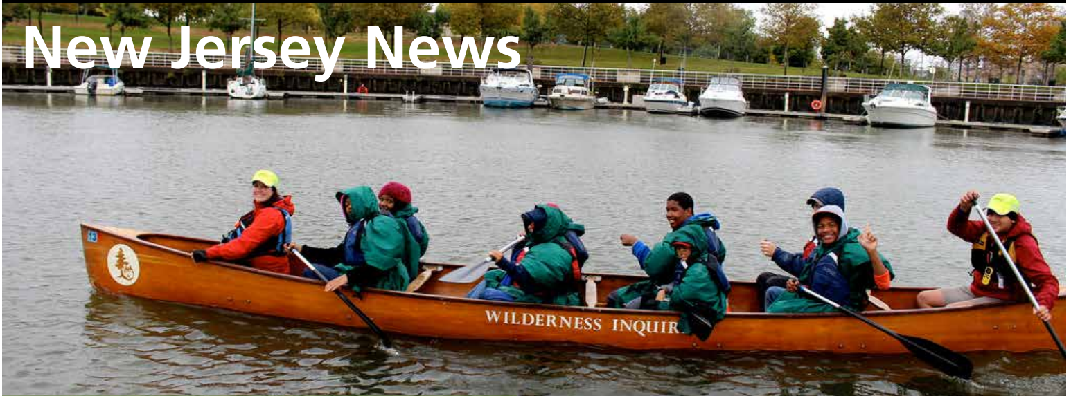
Brave Camden Forward School students paddle through the rain.