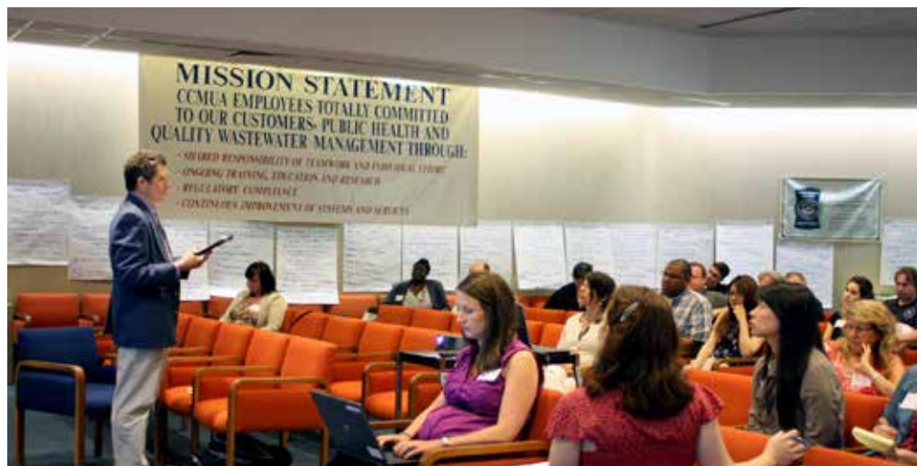
The federal co-leads of the Delaware River Urban Waters Federal Partnership held listening sessions in each of four focus cities, starting in Camden. During this meeting, challenges, opportunities, and needs along the river were discussed.

Assist with developing a steering committee and a work plan for trail implementation; facilitate public engagement and consensus-building.