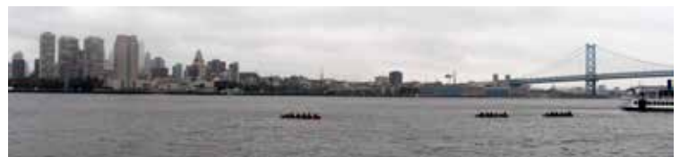
The big voyageur canoes look tiny on the Delaware River.

The event—an initiative of the Delaware River Urban Waters Federal Partnership—brought together federal and local resources to provide a unique opportunity for youth to learn about and reconnect with their nearby water resource. Over the course of four days on the Delaware and its tributaries, the Canoemobile engaged over 440 students in Wilmington, Philadelphia, Camden, and Chester.