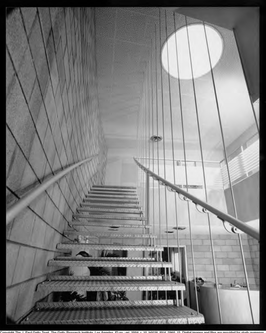
Figure 1. Interior staircase, looking northwest, 1960.