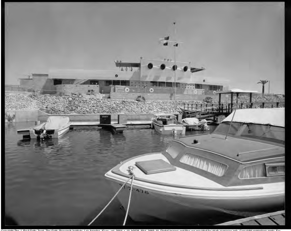
Figure 2. Southwest elevation, looking east, 1960.