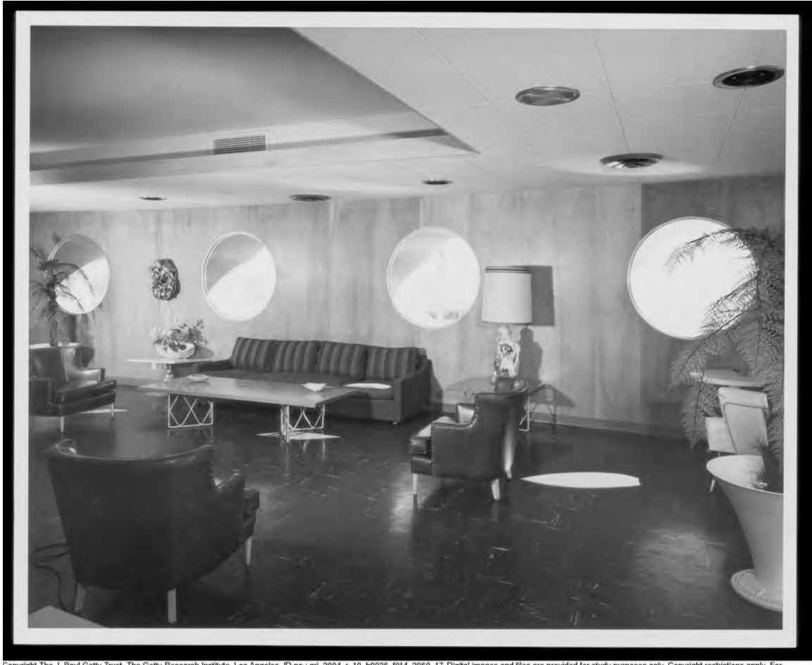
Figure 4. Interior view, second story, looking southwest, 1960.