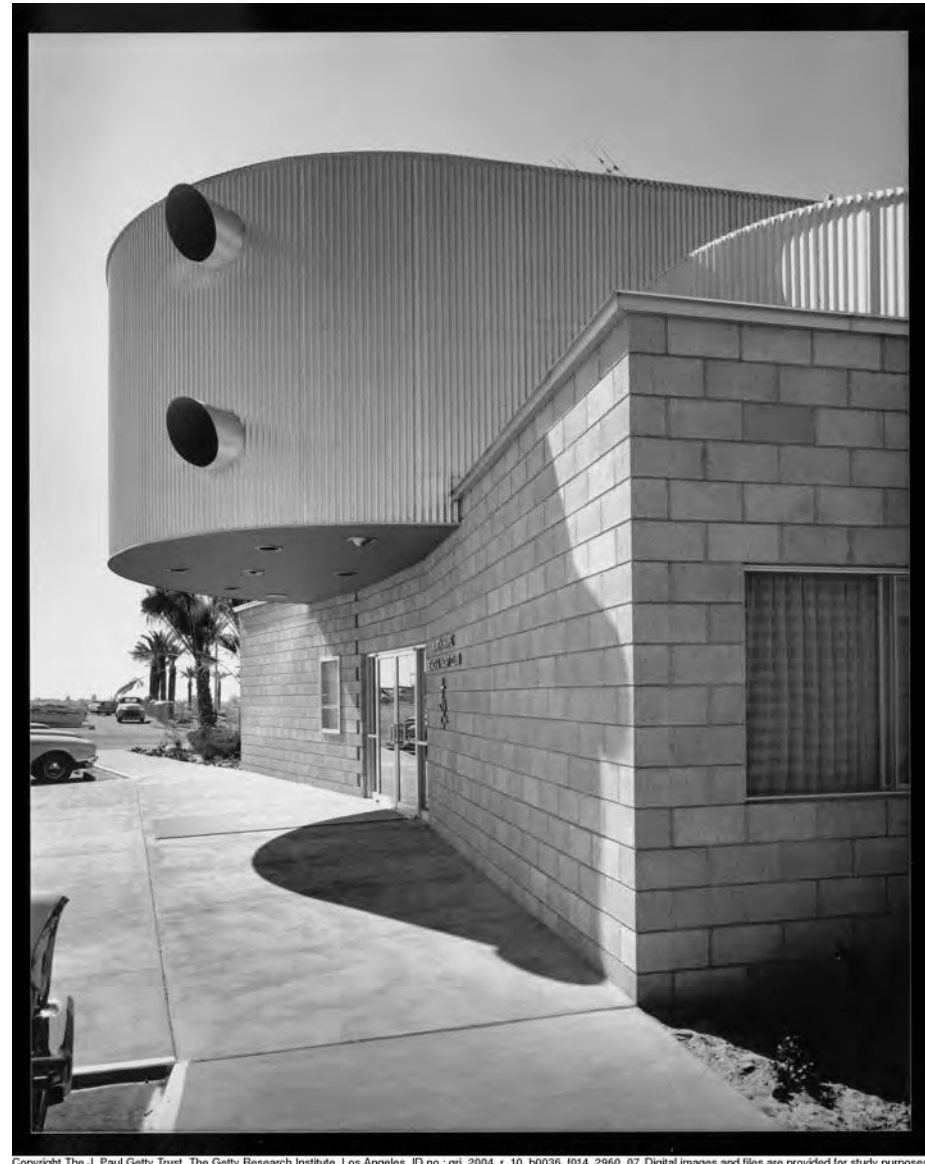
Figure 3. Northeast elevation, looking south, 1960.