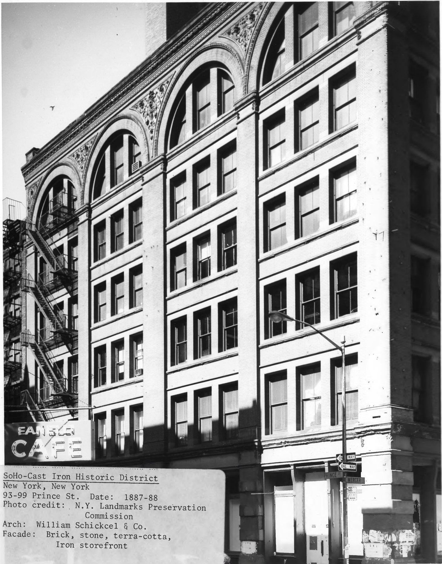
SoHo-Cast Iron Historic District New York, New York 93-99 Prince St. Date: 1887-88 Arch: William Schickel & Co. Facade: Brick, stone, terra-cotta, Iron storefront