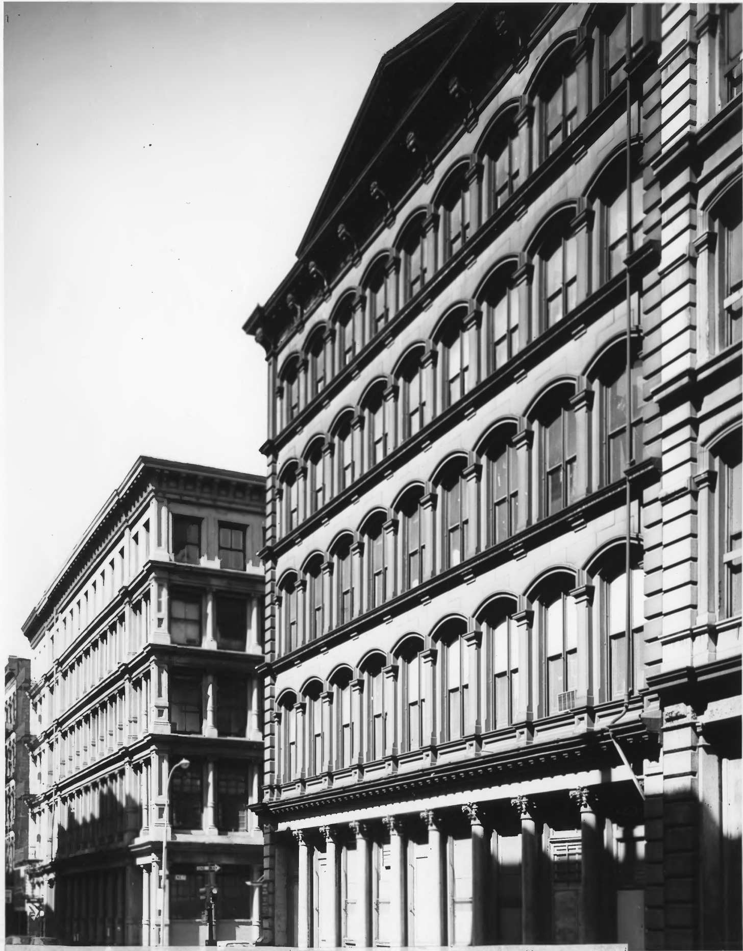
SoHo-Cast Iron Historic District, N.Y.