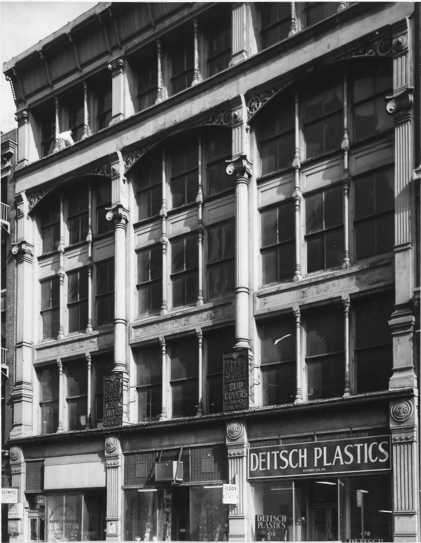
SoHo-Cast Iron Historic District, N.Y.