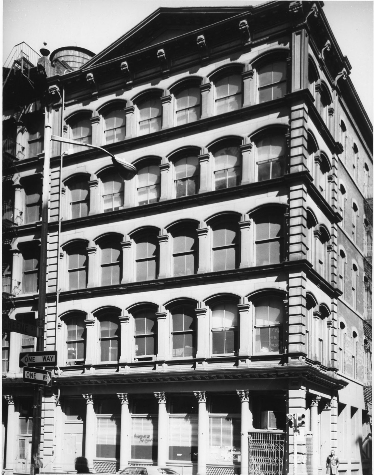
SoHo-Cast Iron Historic District, N.Y.