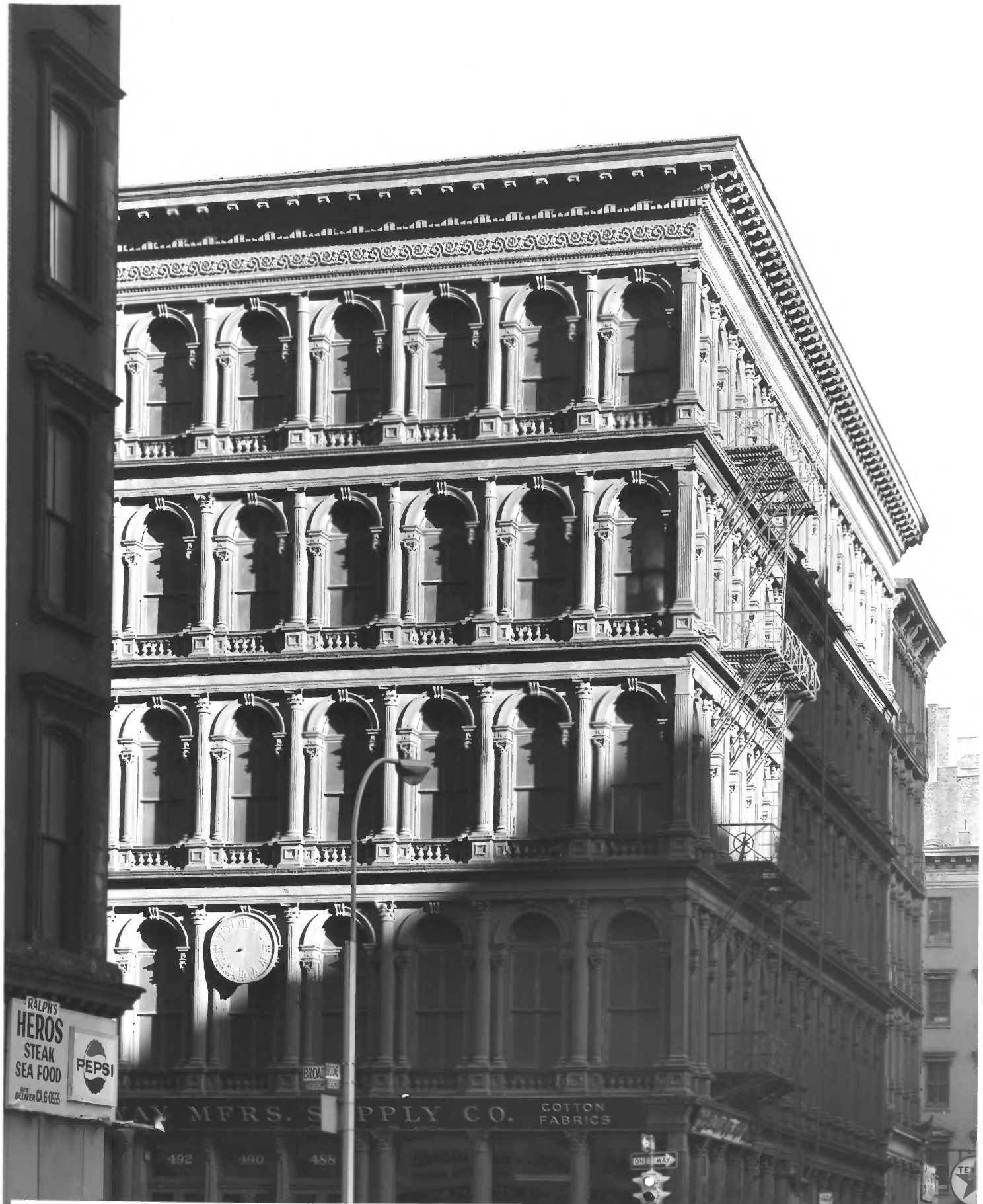
Haghwout Building, New York, N.Y.