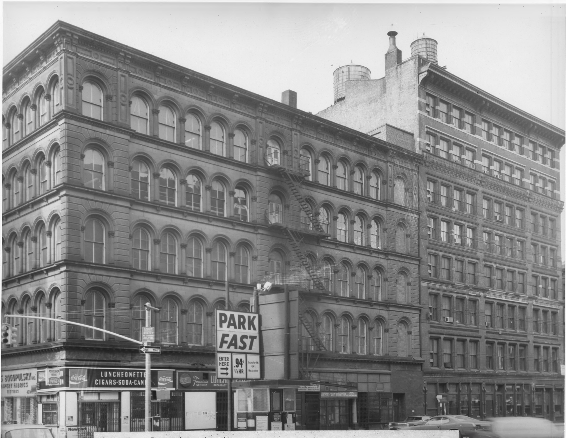
SoHo-Cast Iron Historic District, N.Y.