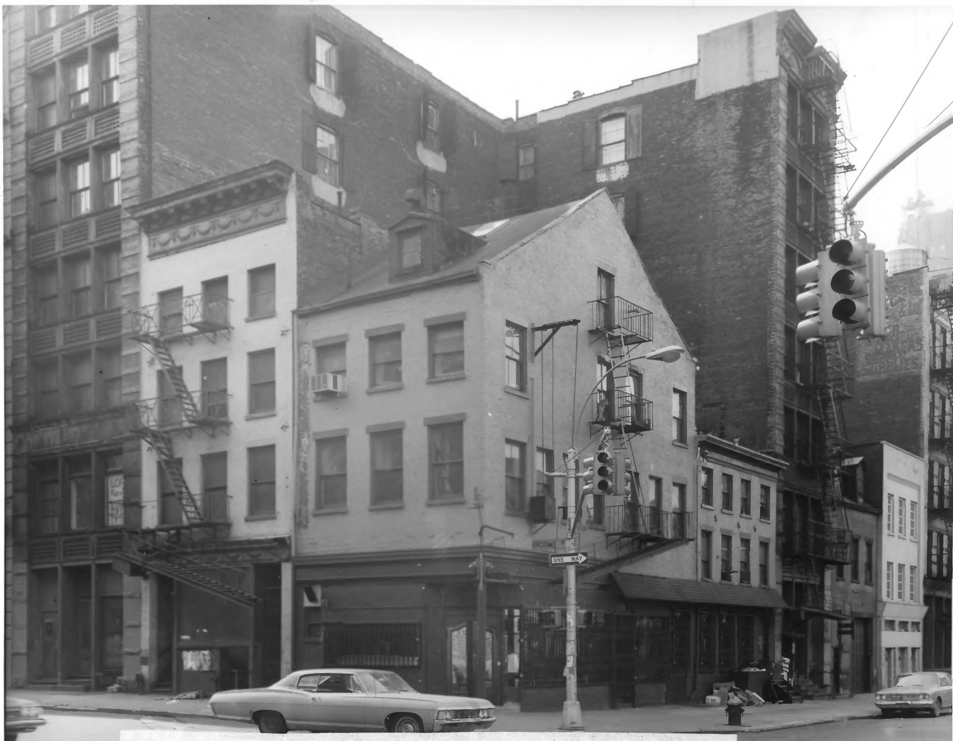
SoHo-Cast Iron Historic District, N.Y.