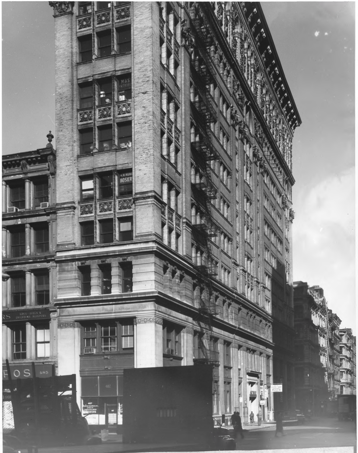
SoHo-Cast Iron Historic District, N.Y.