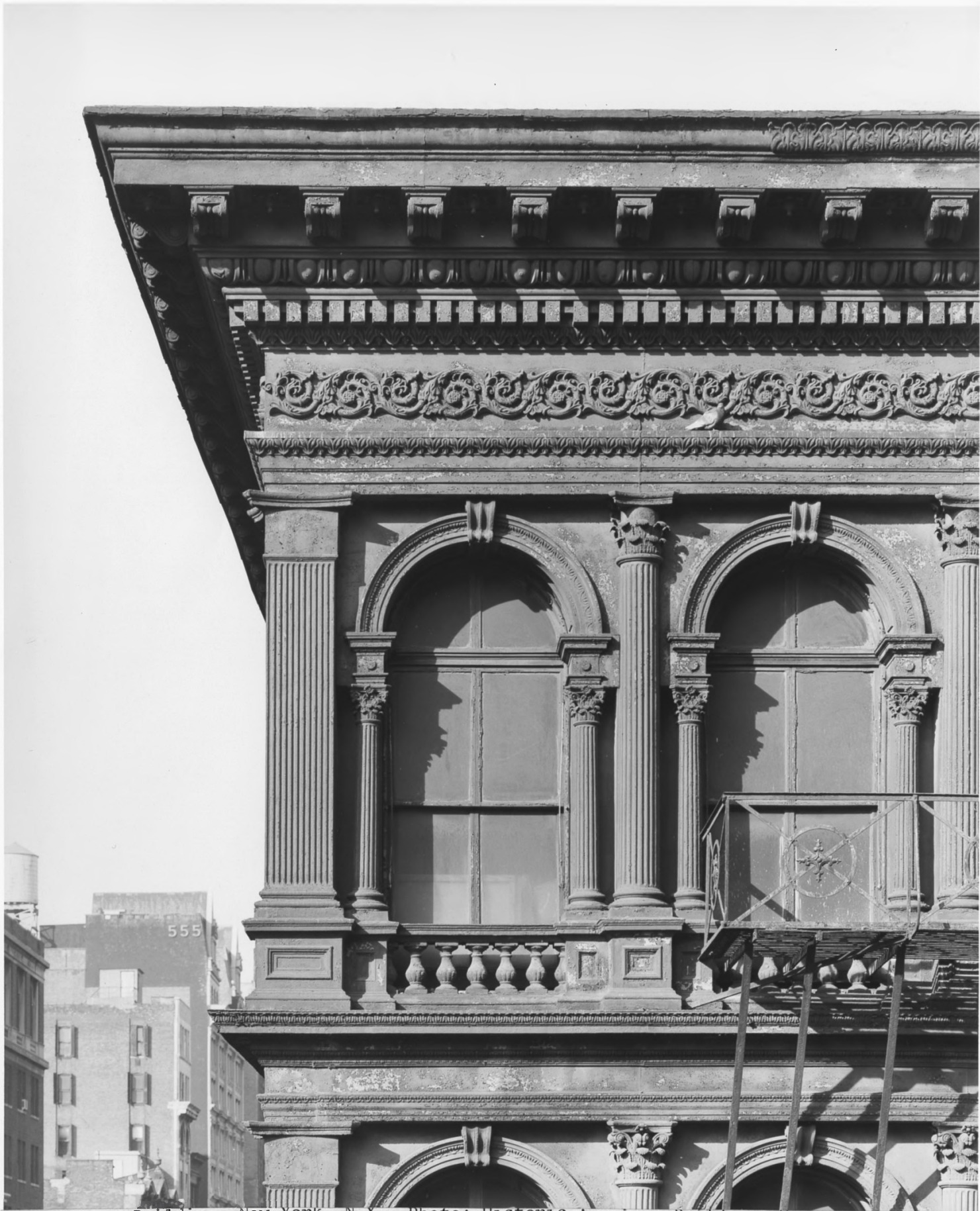
Haughwout Building, New York, N.Y.