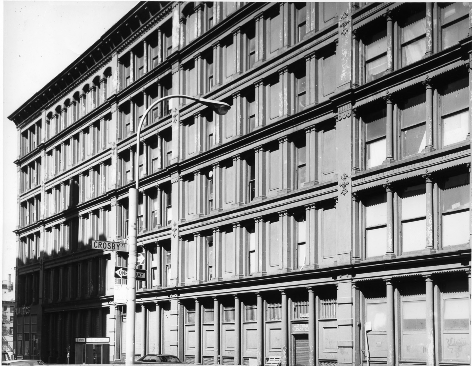
SoHo-Cast Iron Historic District, N.Y.