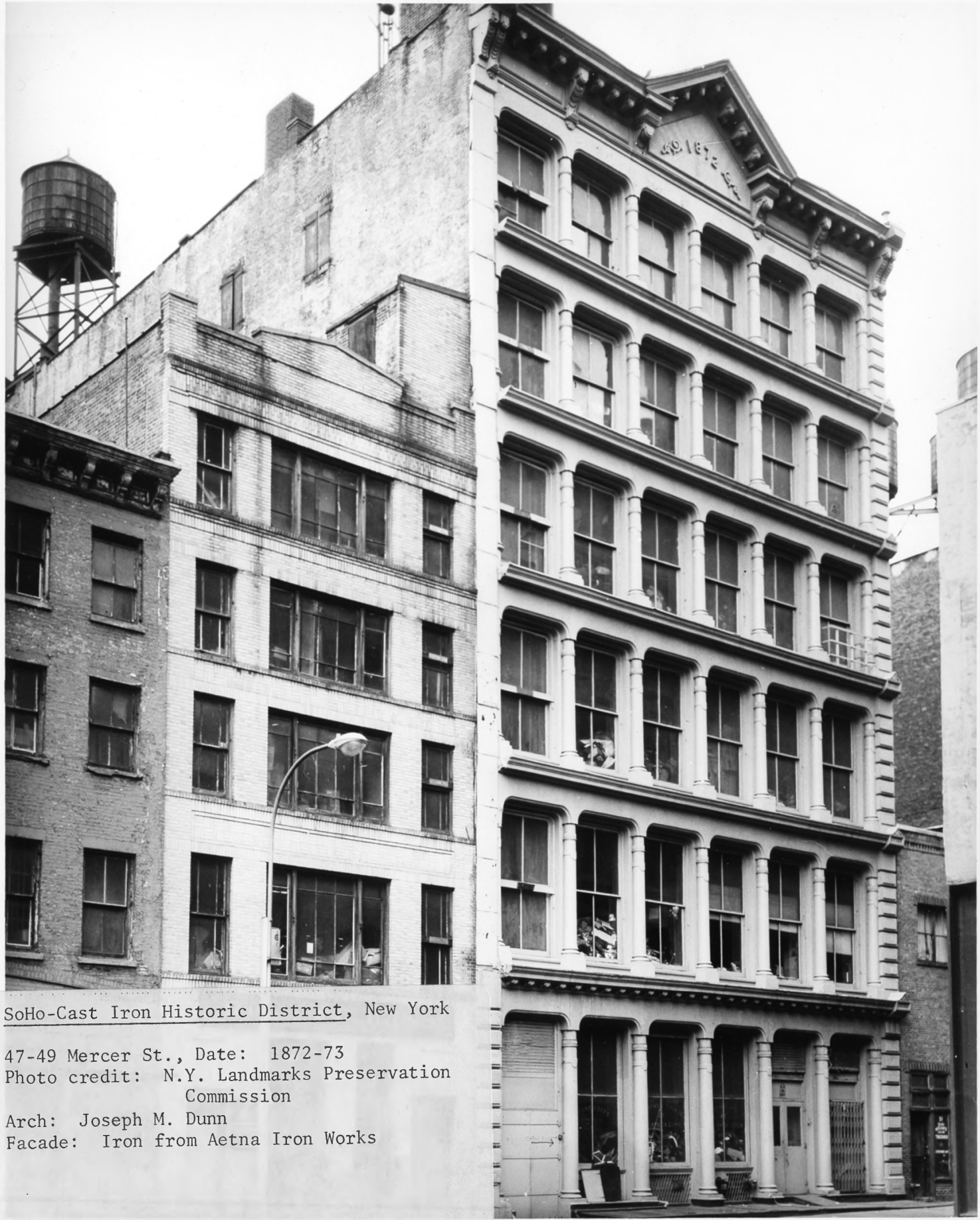
SoHo-Cast Iron Historic District, New York