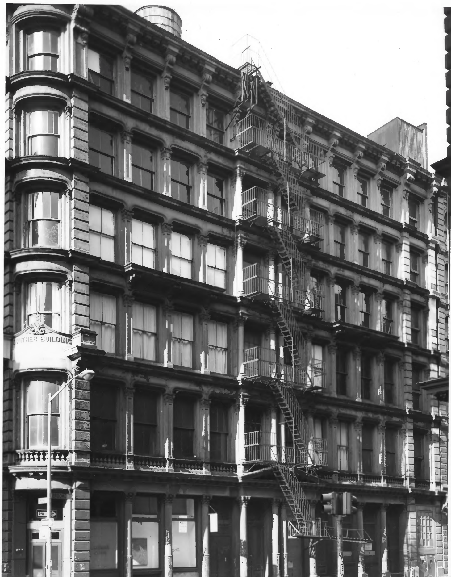
SoHo-Cast Iron Historic District, N.Y.