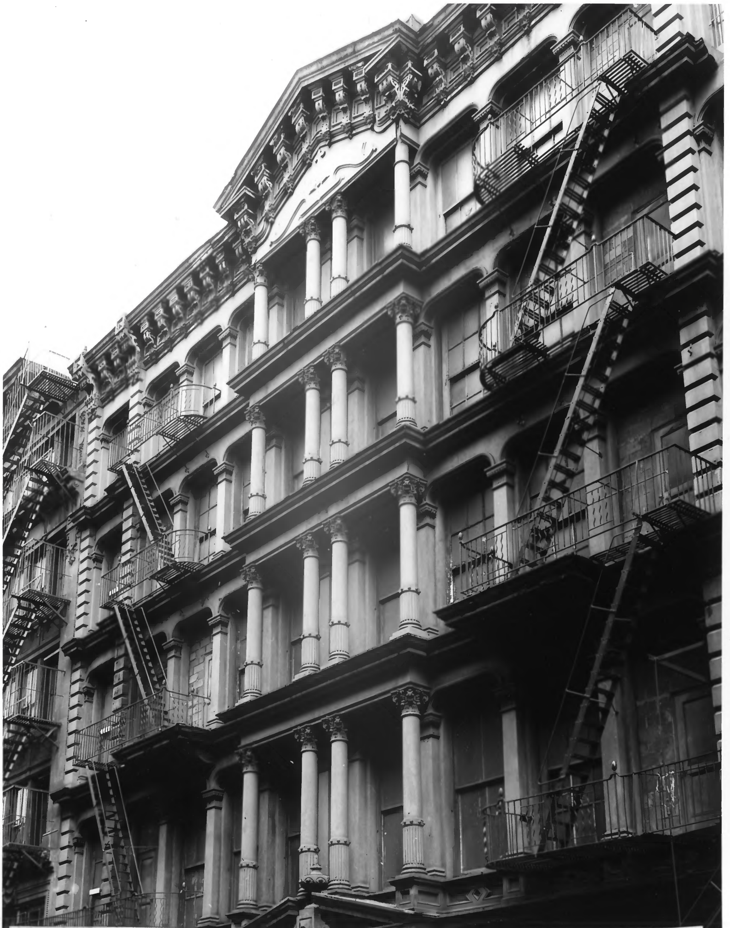
SoHo-Cast Iron Historic District, N.Y.