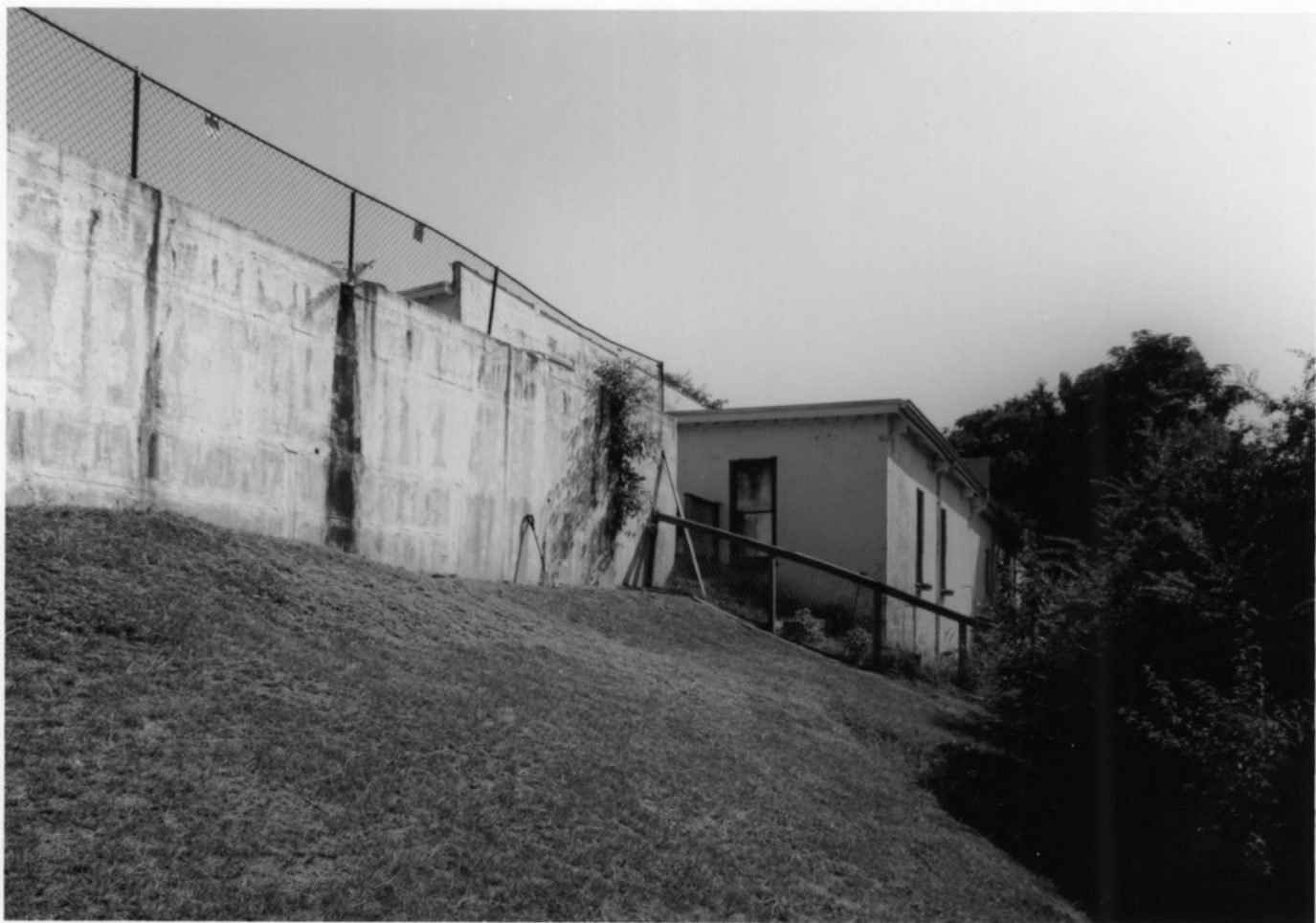
Athens Manufacturing Company Clarke Co., Ga. 27/37