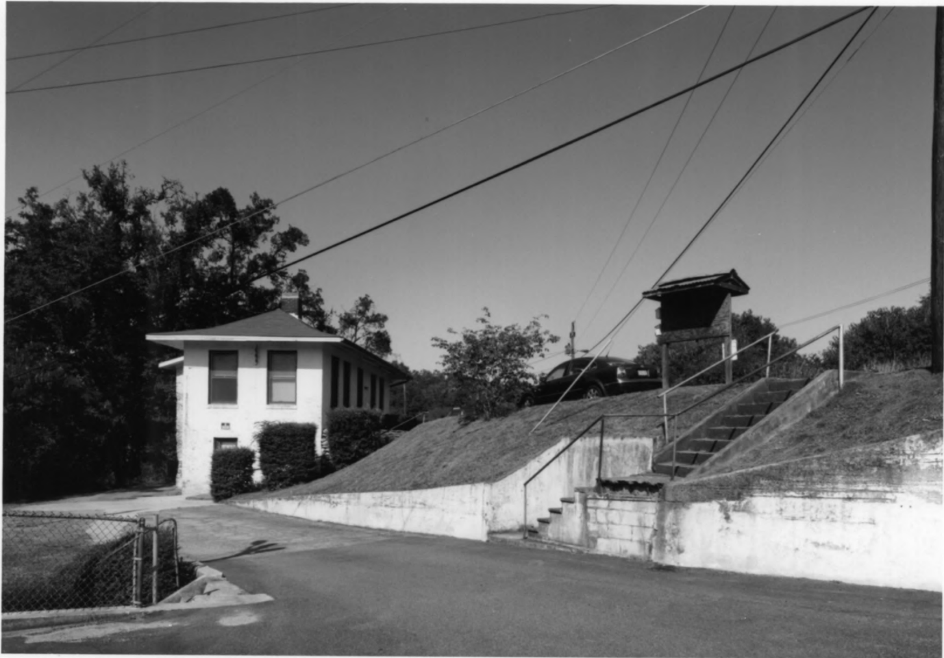
Athens Manufacturing Company Clarke Co., Ga. 23/37