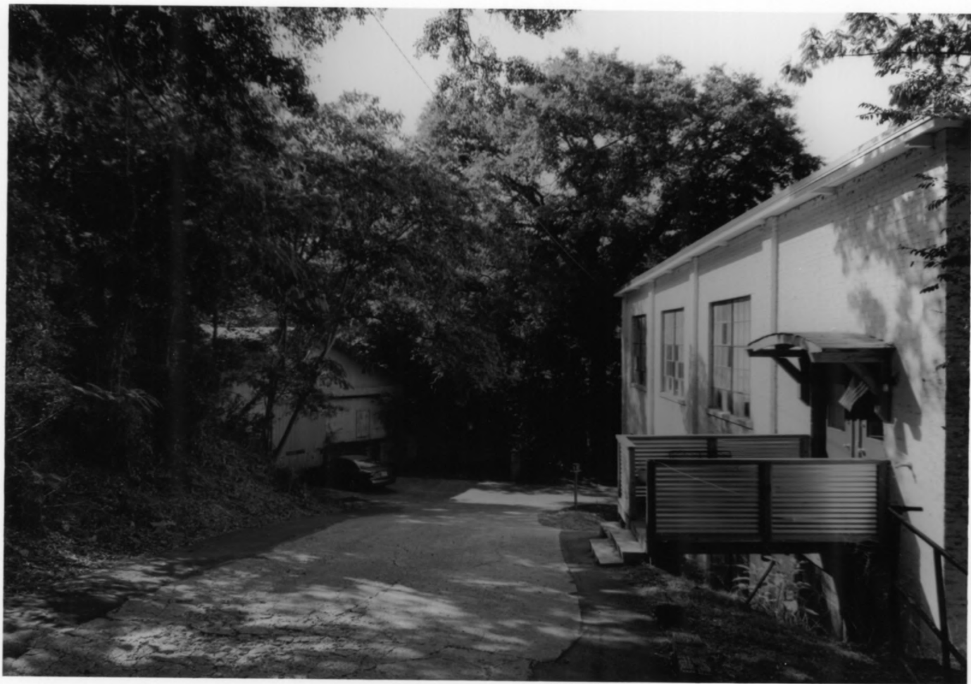
Athens Manufacturing Company Clarke Co., Ga. 35/37