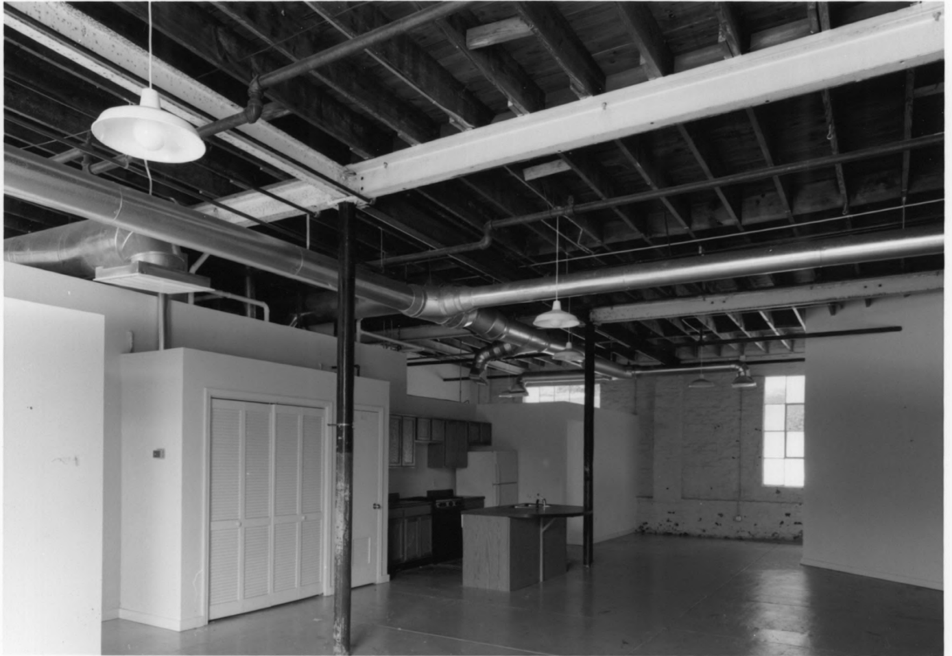
Athens Manufacturing Company Athens, Clarke Co., Ga. 30/37