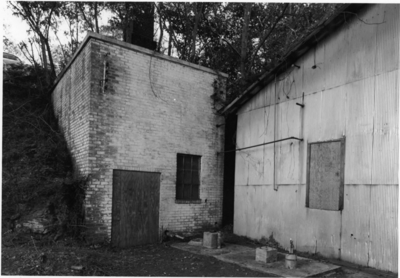
Athens Manufacturing Company Clarke Co., Ga. 36/37