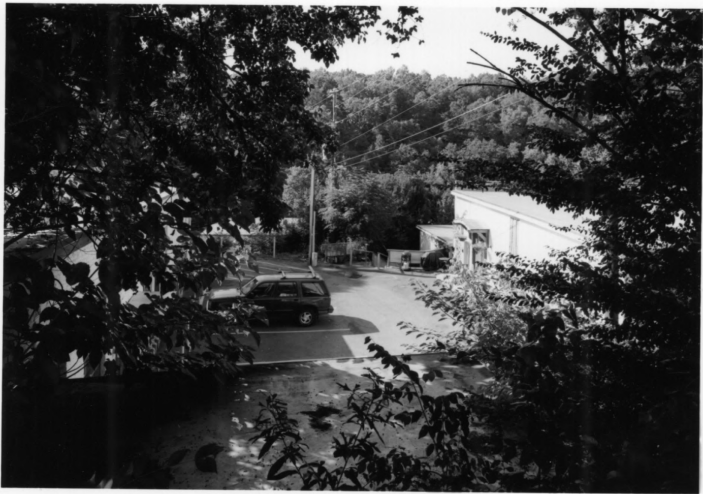
Athens Manufacturing Company Clarke Co., Ga. 31/37