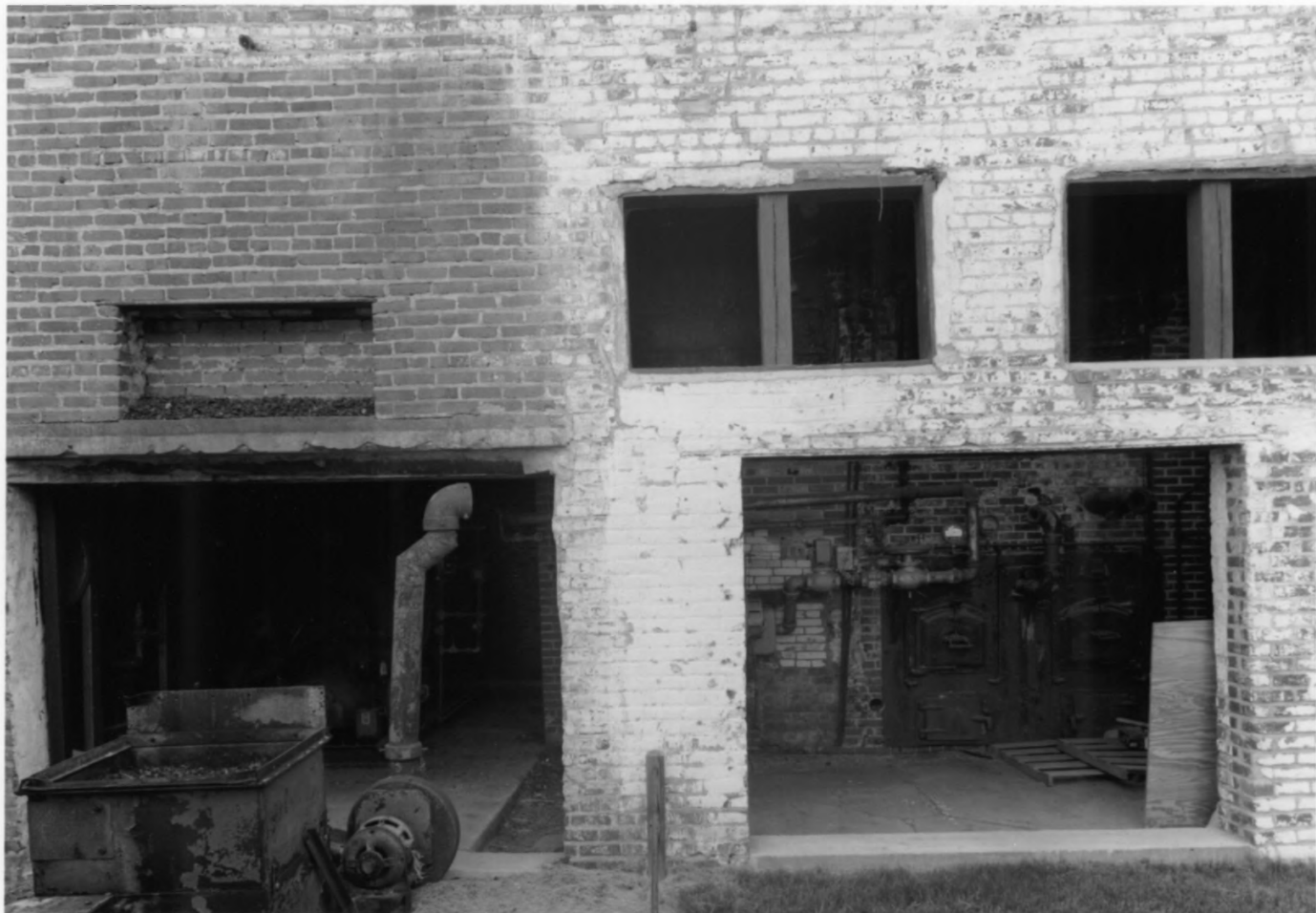
Athens Manufacturing Company Clarke Co., Ga. 14/37