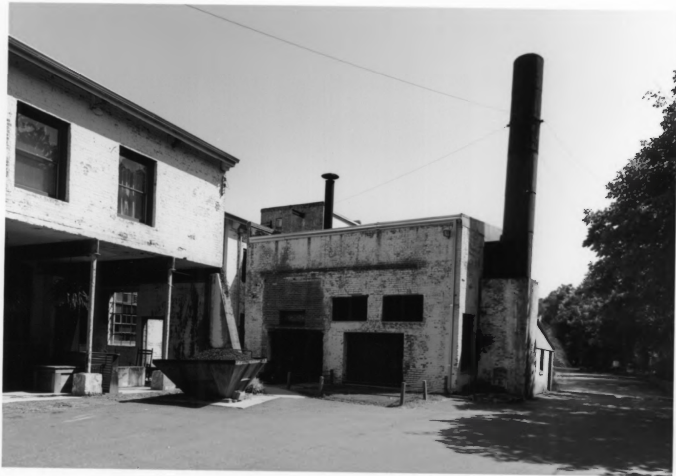
Athens Manufacturing Company Clarke Co., Ga. 13/37