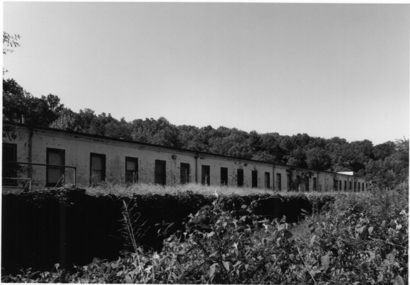
Athens Manufacturing Company Clarke Co., Ga. 1/37