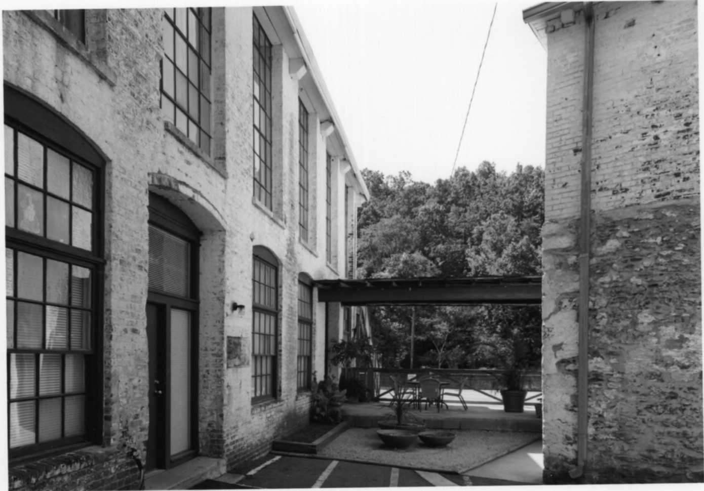
Athens Manufacturing Company Clarke Co., Ga. 18/37