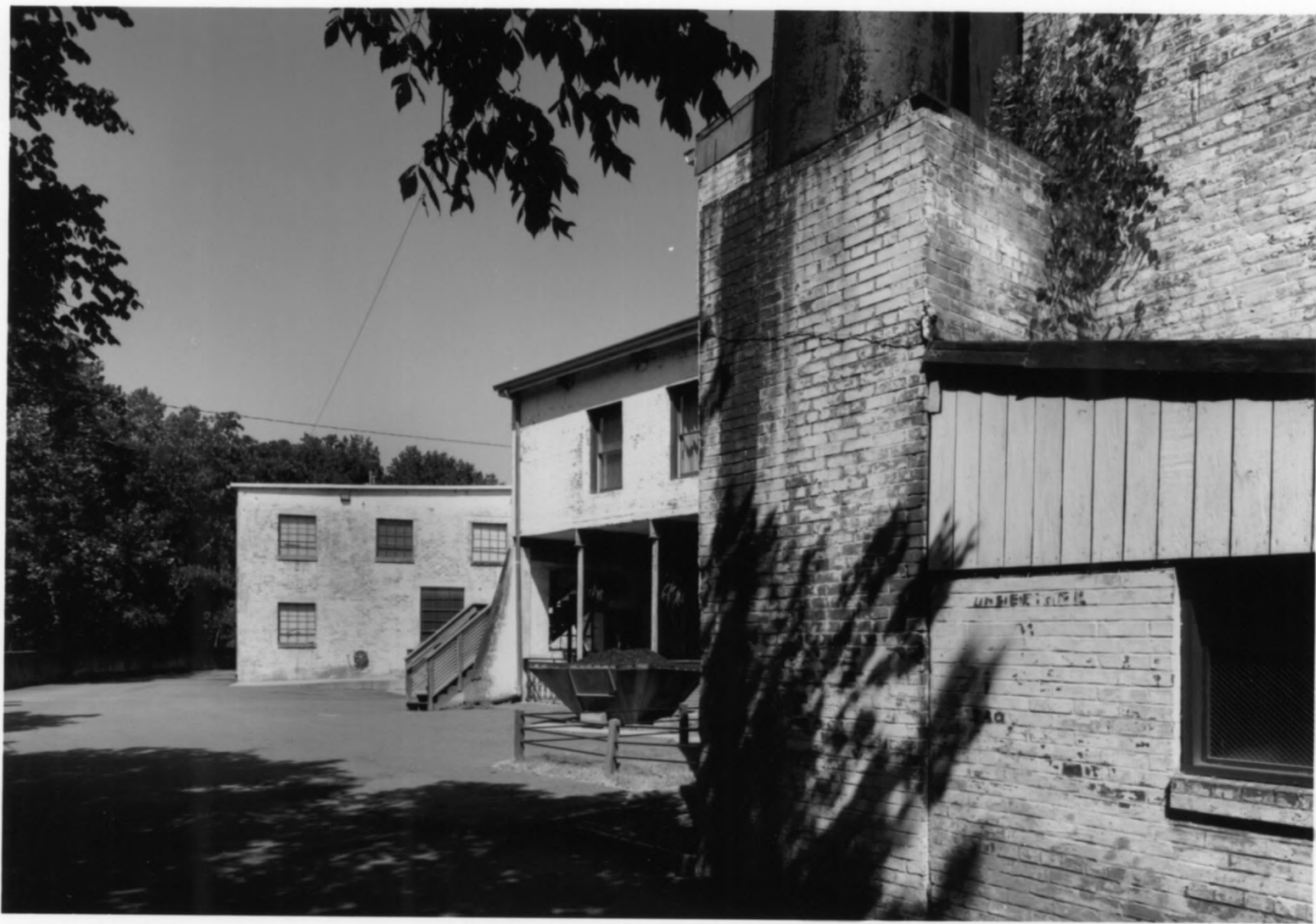
Athens Manufacturing Company Clarke Co., Ga. 11/37