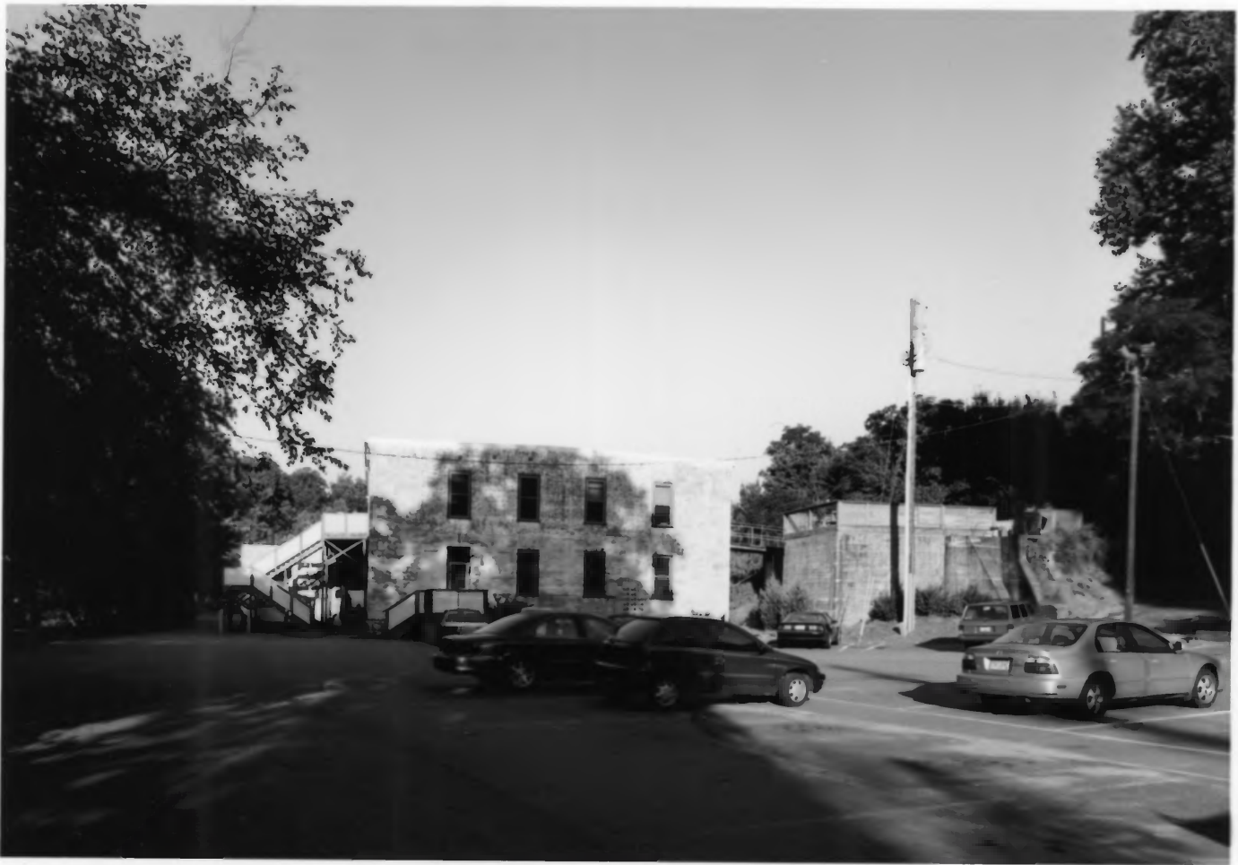
Athens Manufacturing Company Clarke Co., Ga. 6/37