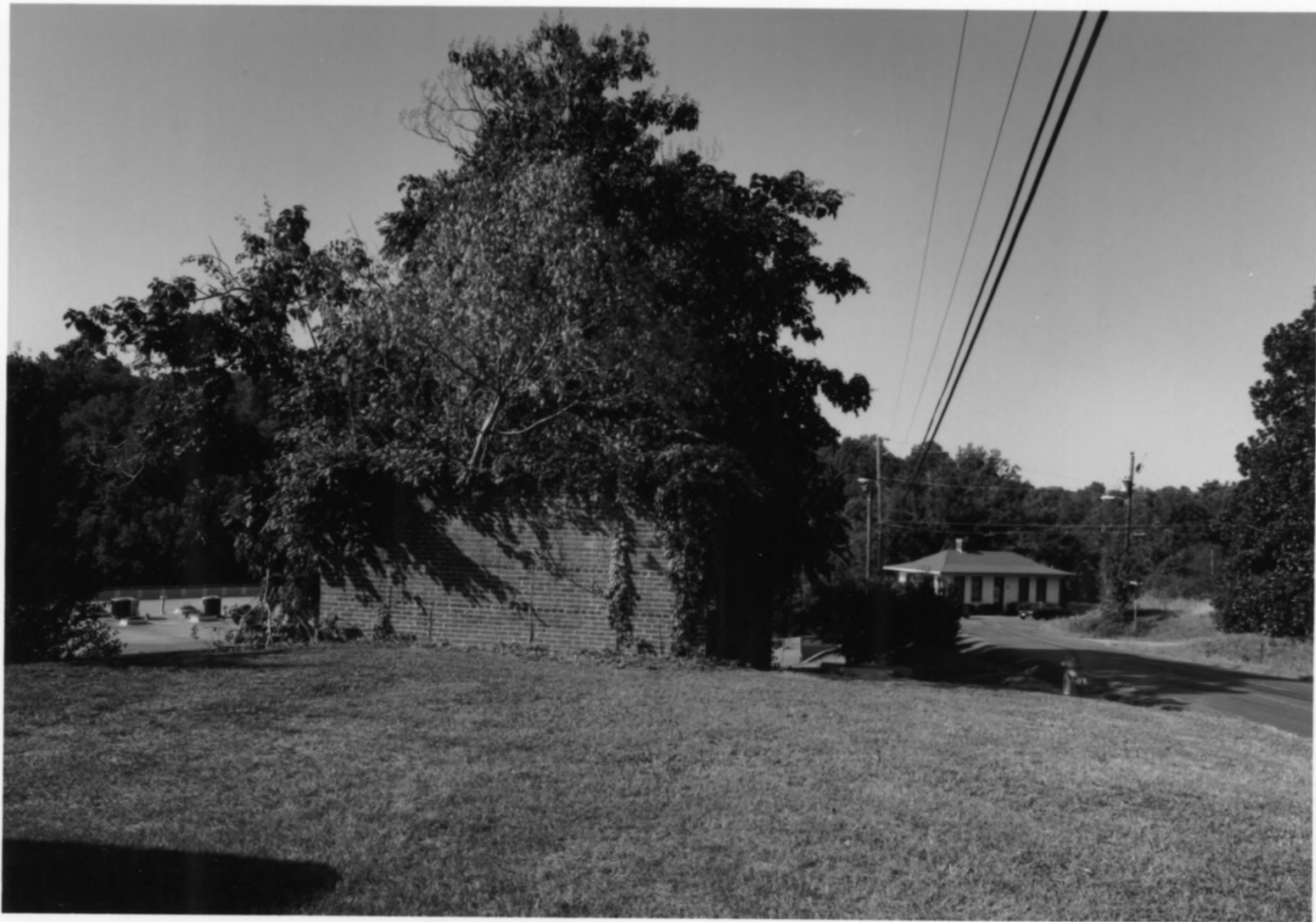
Athens Manufacturing Company Clarke Co., Ga. 25/39