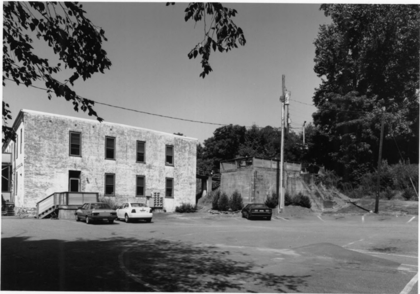
Athens Manufacturing Company Clarke Co., Ga. 7/37