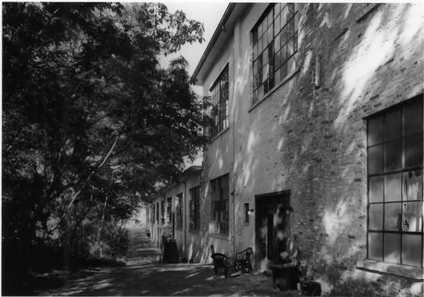
Athens Manufacturing Company Clarke Co., Ga. 33/37