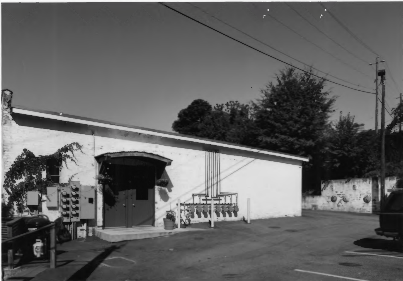
Athens Manufacturing Company Clarke Co., Ga. 28/37