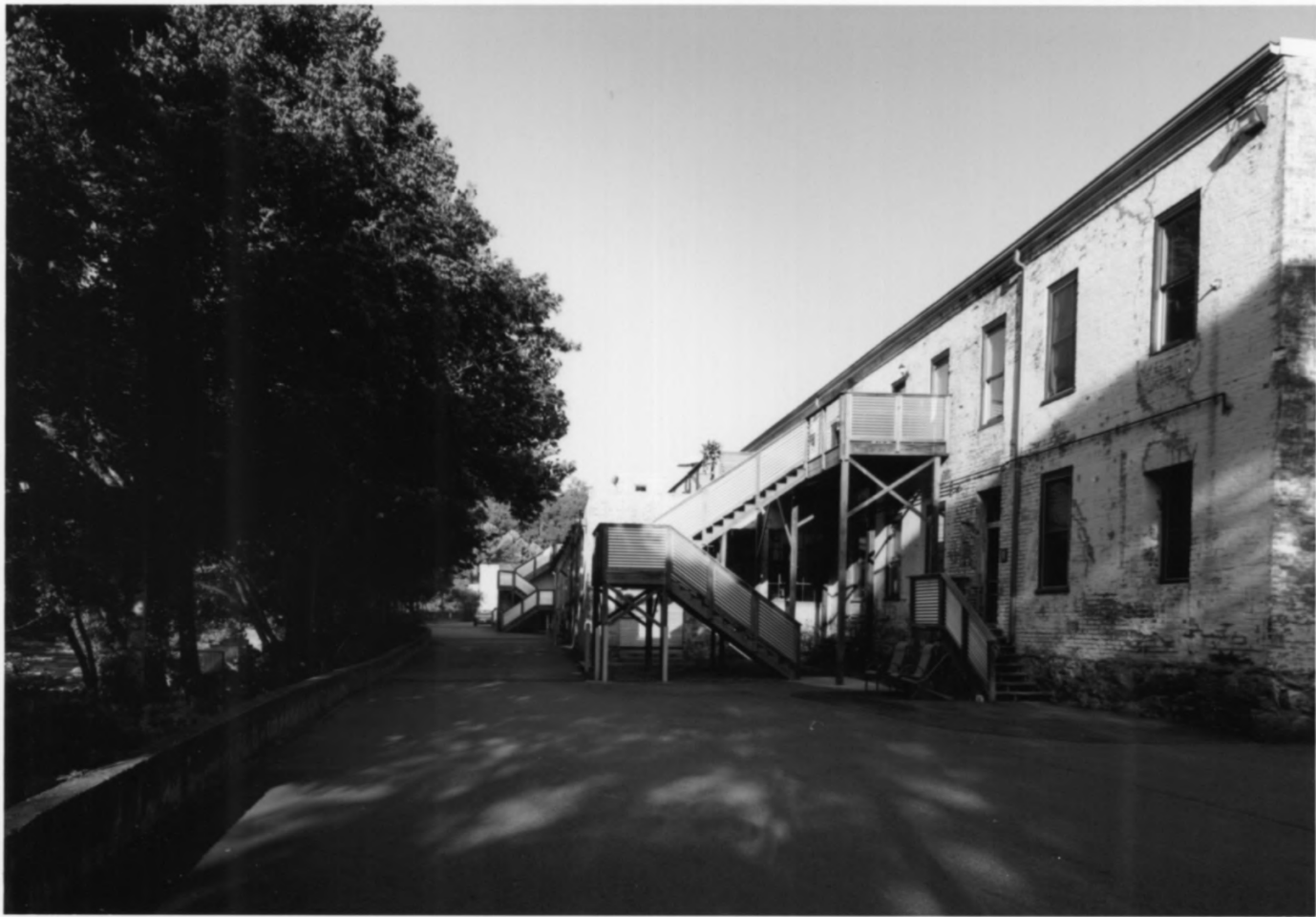
Athens Manufacturing Company Clarke Co., Ga. 8/37