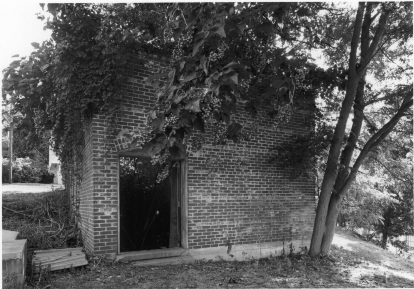
Athens Manufacturing Company Clarke Co., Ga. 26/37