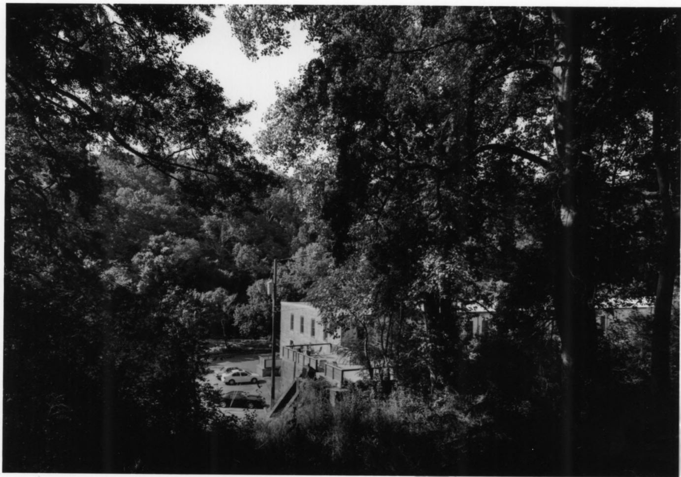
Athens Manufacturing Company Clarke Co., Ga. 37/37