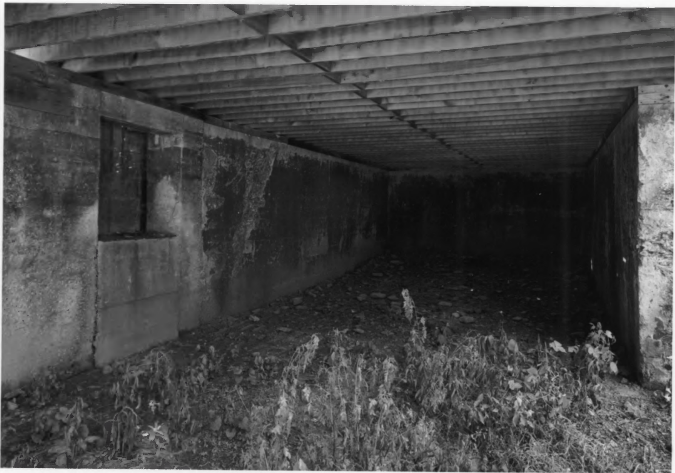
Athens Manufacturing Company Clarke Co., Ga. 4/37