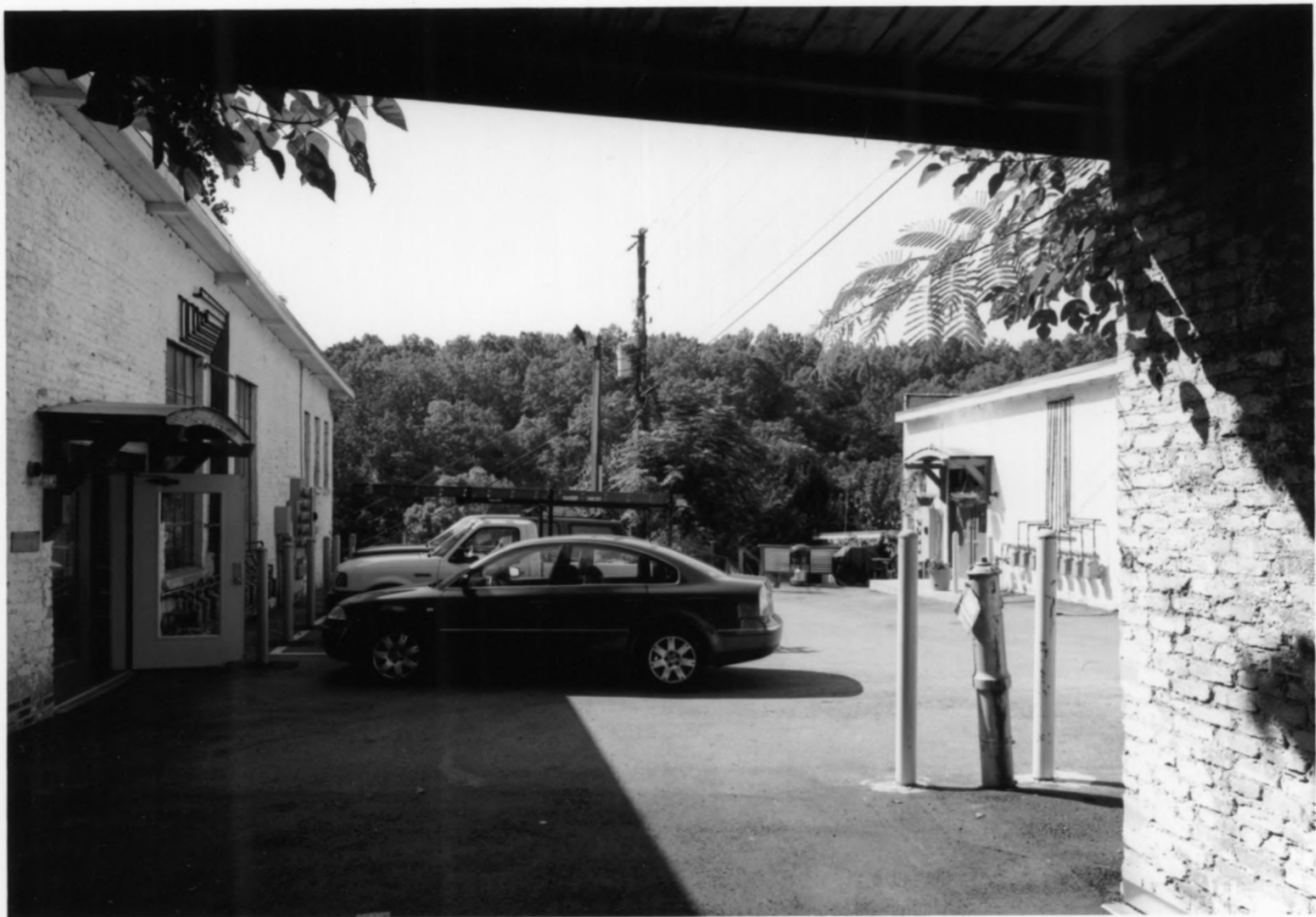
Athens Manufacturing Company Clarke Co., Ga. 32/37