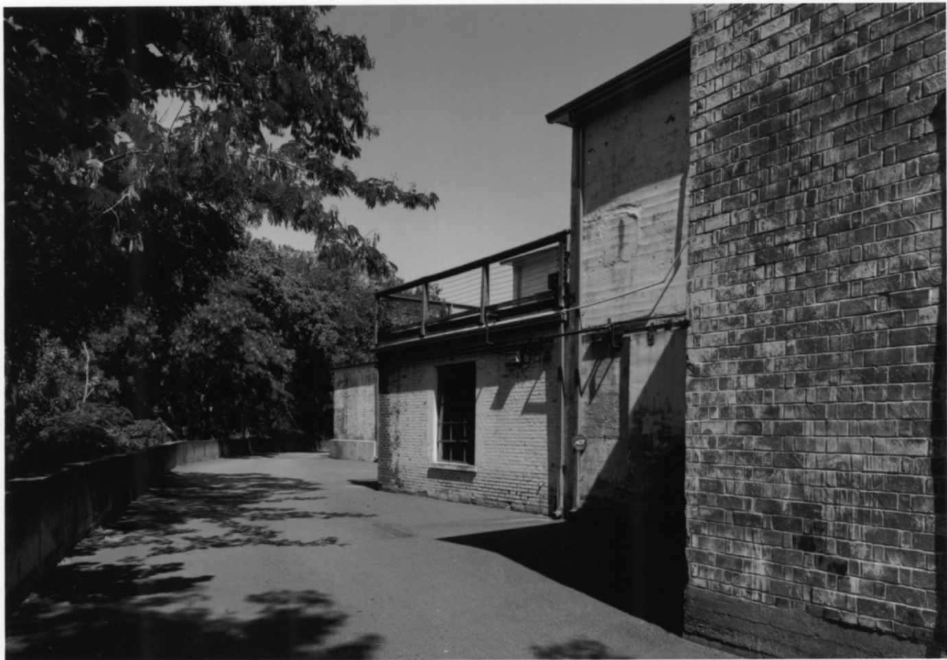
Athens Manufacturing Company Clarke Co., Ga. 20/37