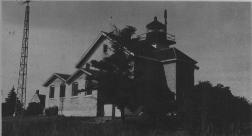
East End & North Side Dwelling Bldg. (East End F.S. Bldg. to left)