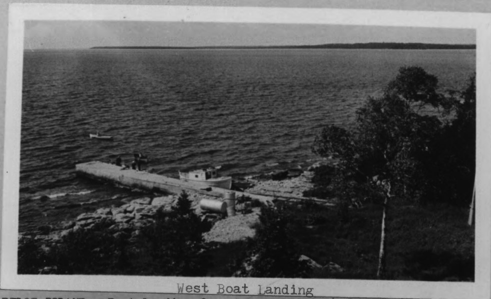
West Boat landing