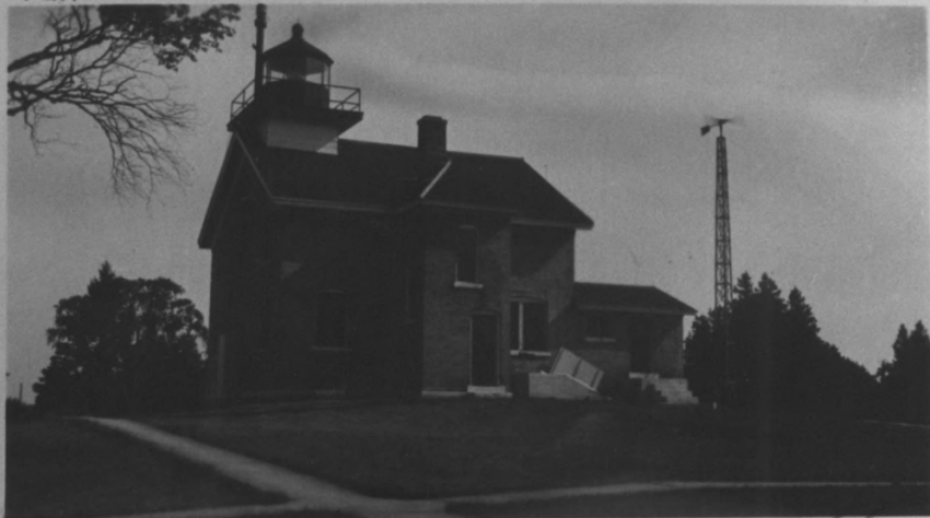
South side & West End of Dwelling Bldg.