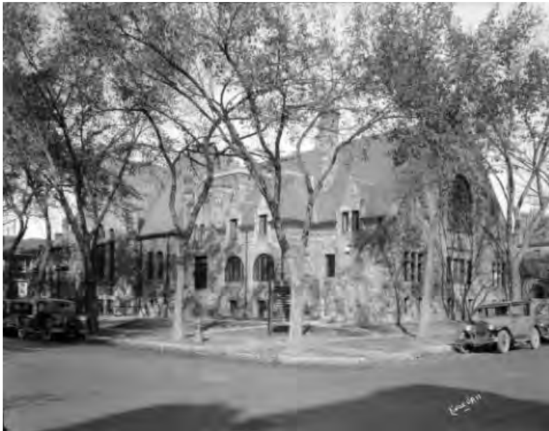
H2: Church from same perspective as Historic Photo 1, ca. 1925-30; note southwest porch now has windows installed in the west arched openings and the south opening is blocked in with stone.