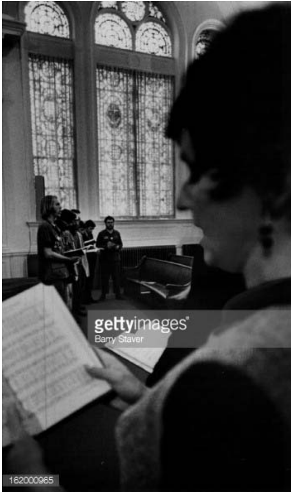
H6. Vietnam Veterans Against the War members sing with the congregation at First Unitarian Church, October 1971