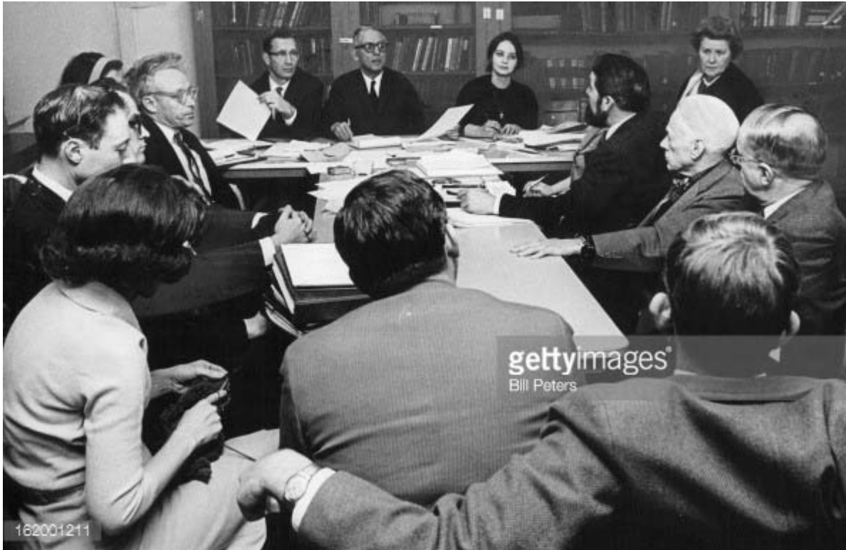
H5. Members of the Colorado Council to Abolish Capital Punishment meet at First Unitarian church February 1966