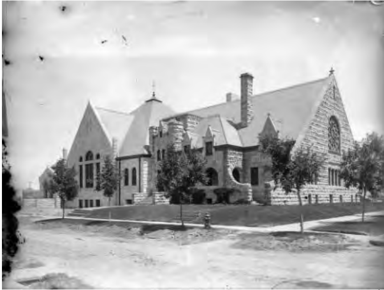
H1: West side of church in ca. 1895-1900, as seen from the corner of 14 th and Lafayette; note southwest porch remains open.