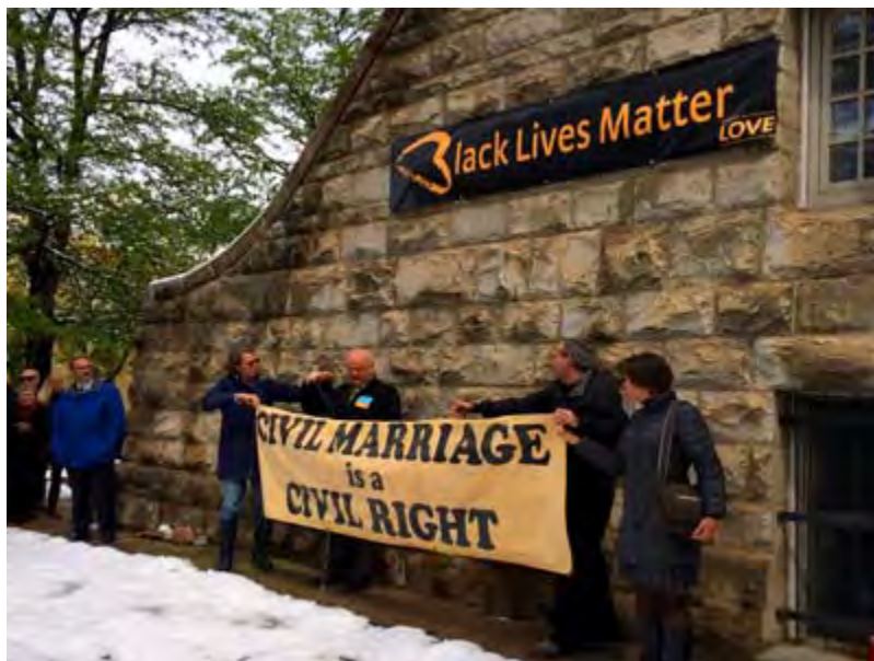
H12. Diversity is celebrated (caption).