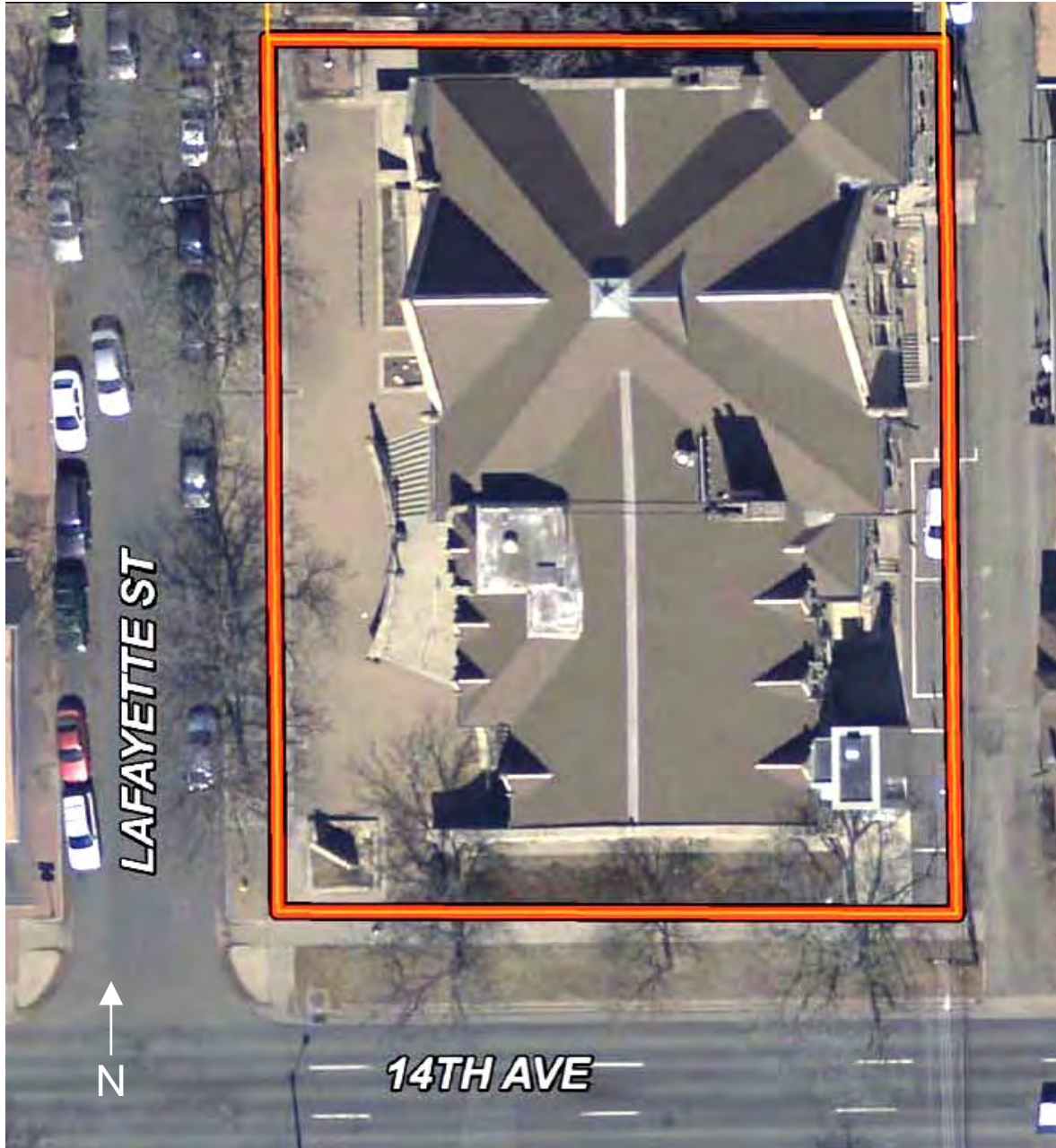
Site plan of First Unitarian Church, from the Denver Landmark Preservation Commission application (2015).