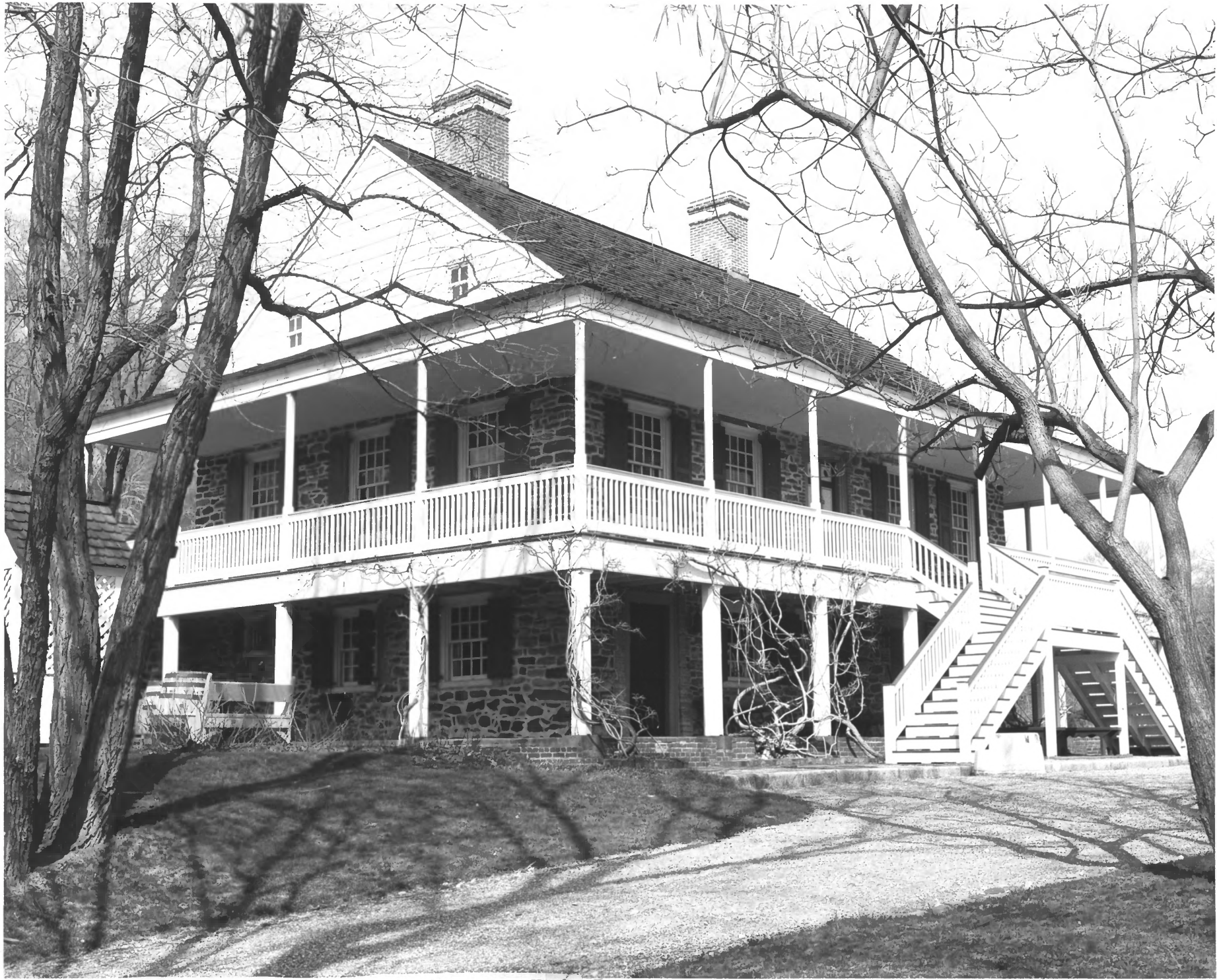
Van Cortlandt Manor House, Croton-on Hudson, New York