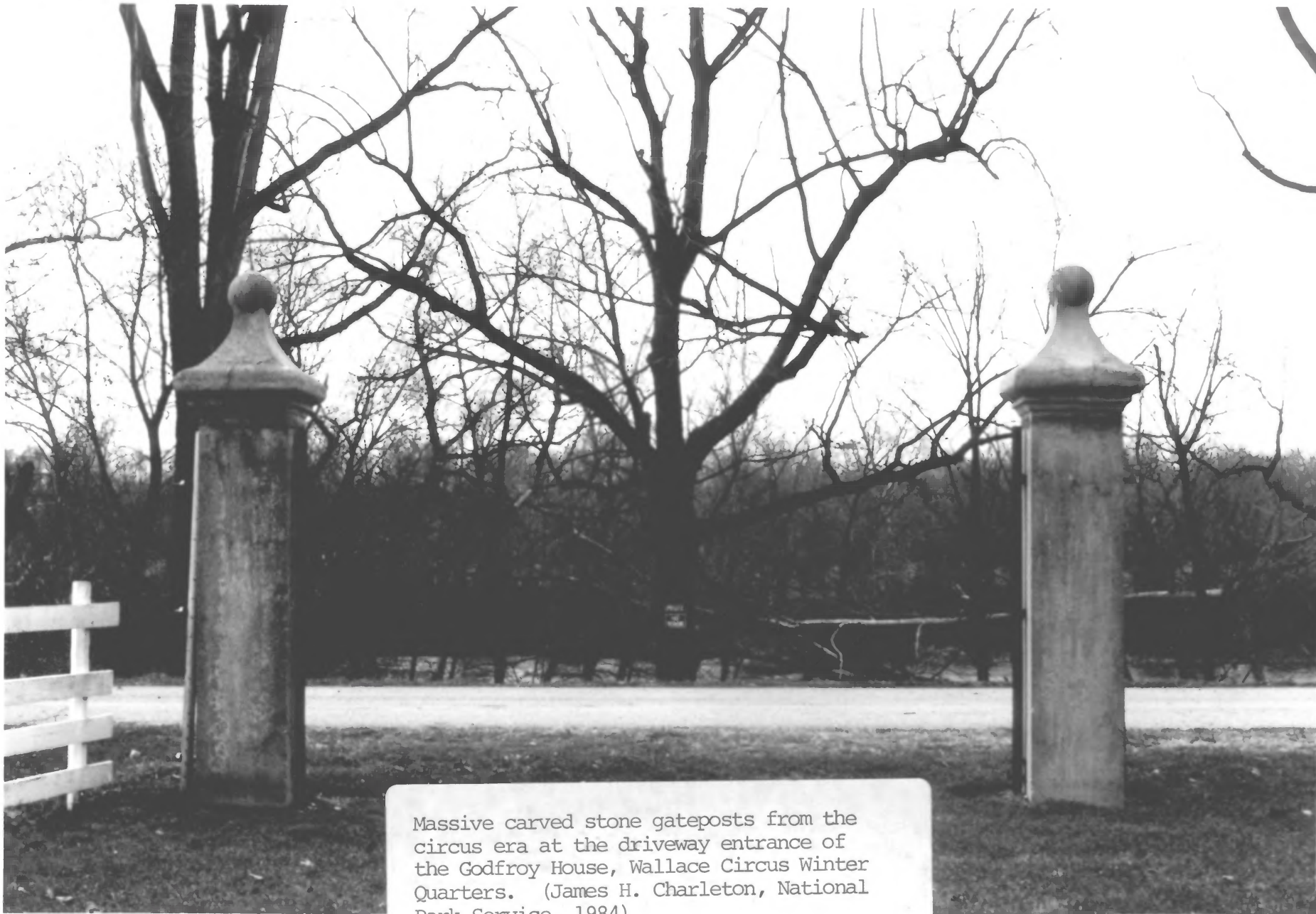
Massive carved stone gateposts from the circus era at the driveway entrance of the Godfroy House, Wallace Circus Winter Quarters.