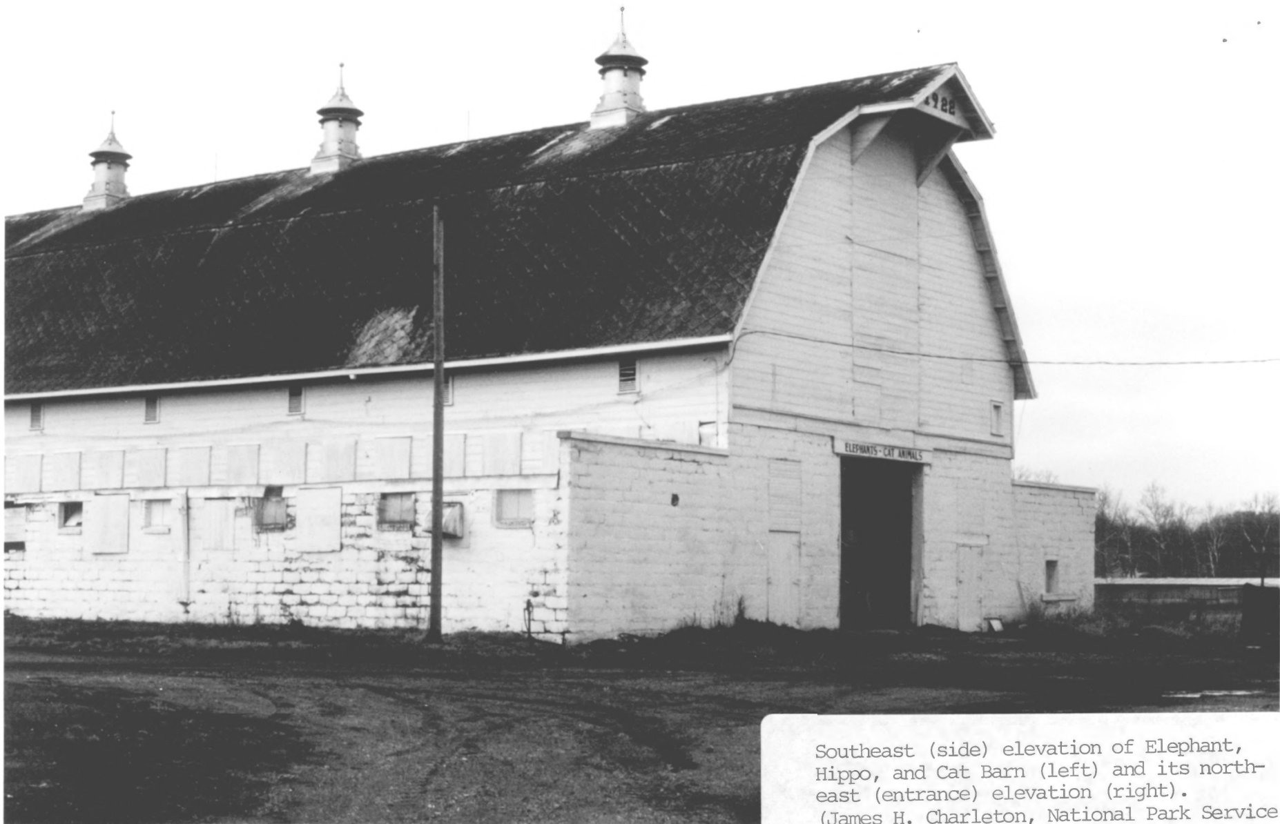
Southeast (side) elevation of Elephant, Hippo, and Cat Barn (left) and its north-east (entrance) elevation (right).