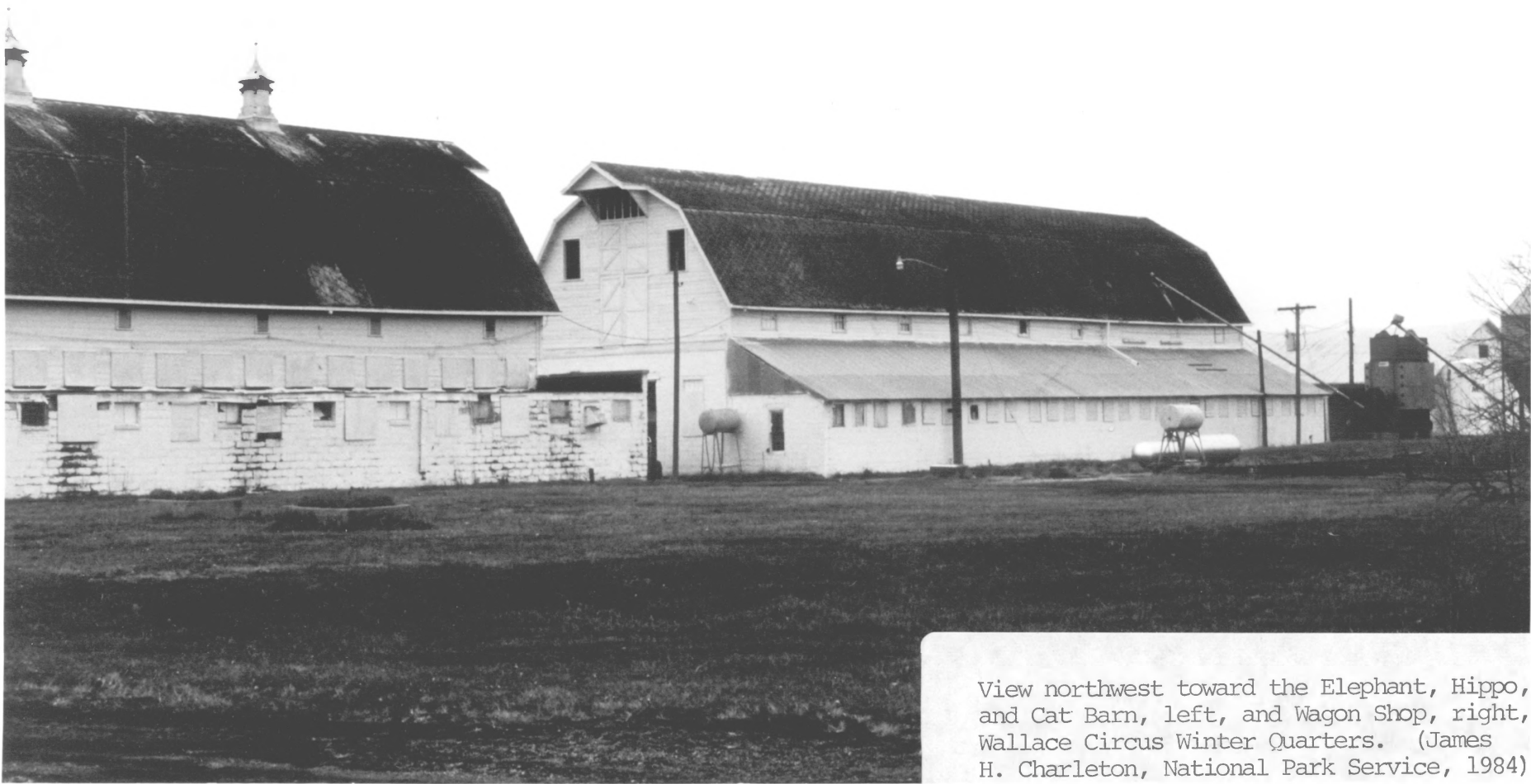
View northwest toward the Elephant, Hippo, and Cat Barn, left, and Wagon Shop, right, Wallace Circus Winter Quarters.