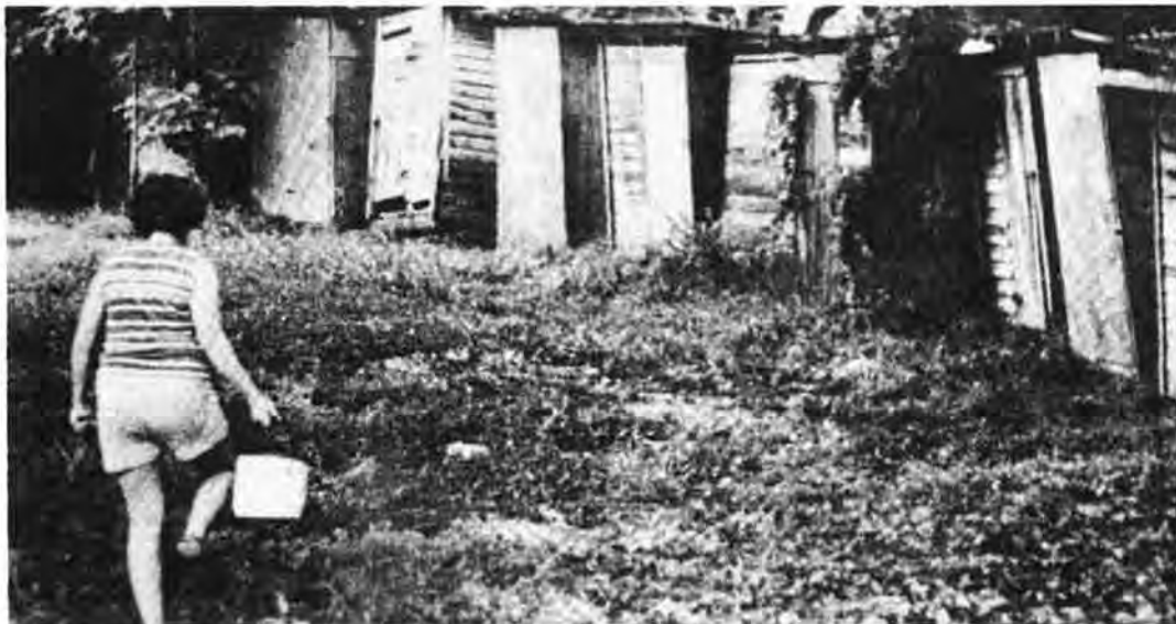
Fig. 2. Row of privies, ca. 1970. (Terry Brotherton, Rock Spring Campground , Vol. II: 683.)