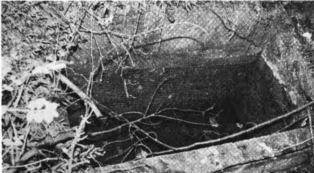
Fig. 1. Mud Spring, 2002. (Terry Brotherton, Rock Spring Campground , Vol. II: 683.)

Section Number Photos Page 21 Rock Spring Camp Ground, Boundary Increase Lincoln County, North Carolina