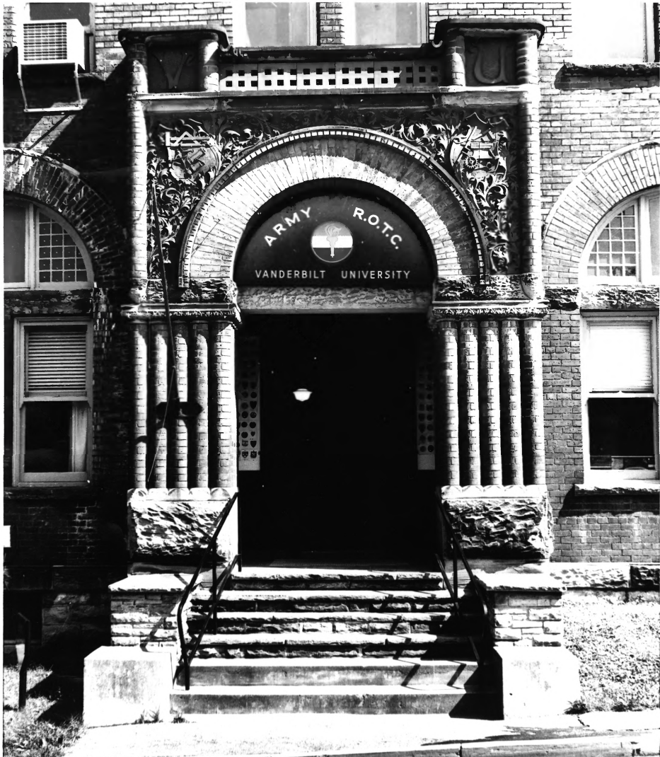
Mechanical Engineering Hall Vanderbilt University detail of entrance April 1977