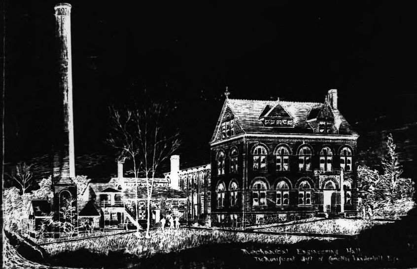
Mechanical Engineering Hall The magnificent gift of General Vanderbilt, Esq.