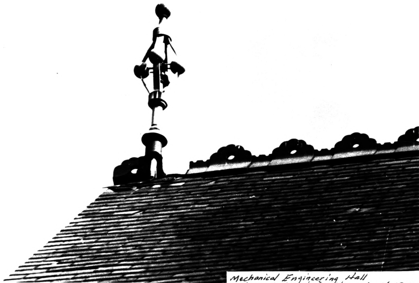
Mechanical Engineering Hall Vanderbilt University - April 1977 detail of roof line & ornament.