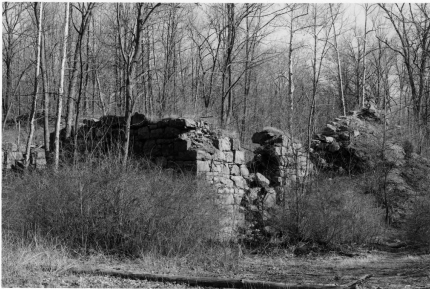
FURNACE # 2 ↑