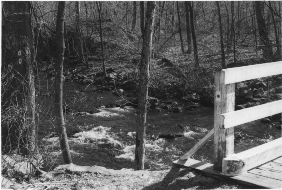
SWIFT FLOWING WANAQUE RIVER RUNS THRU TRACT