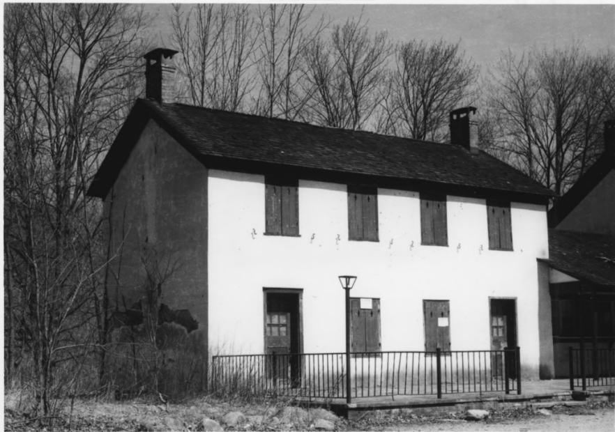
18 TH CENTURY STONE STORE #1