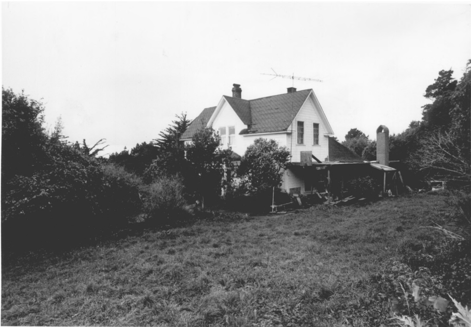
SOUTH & EAST