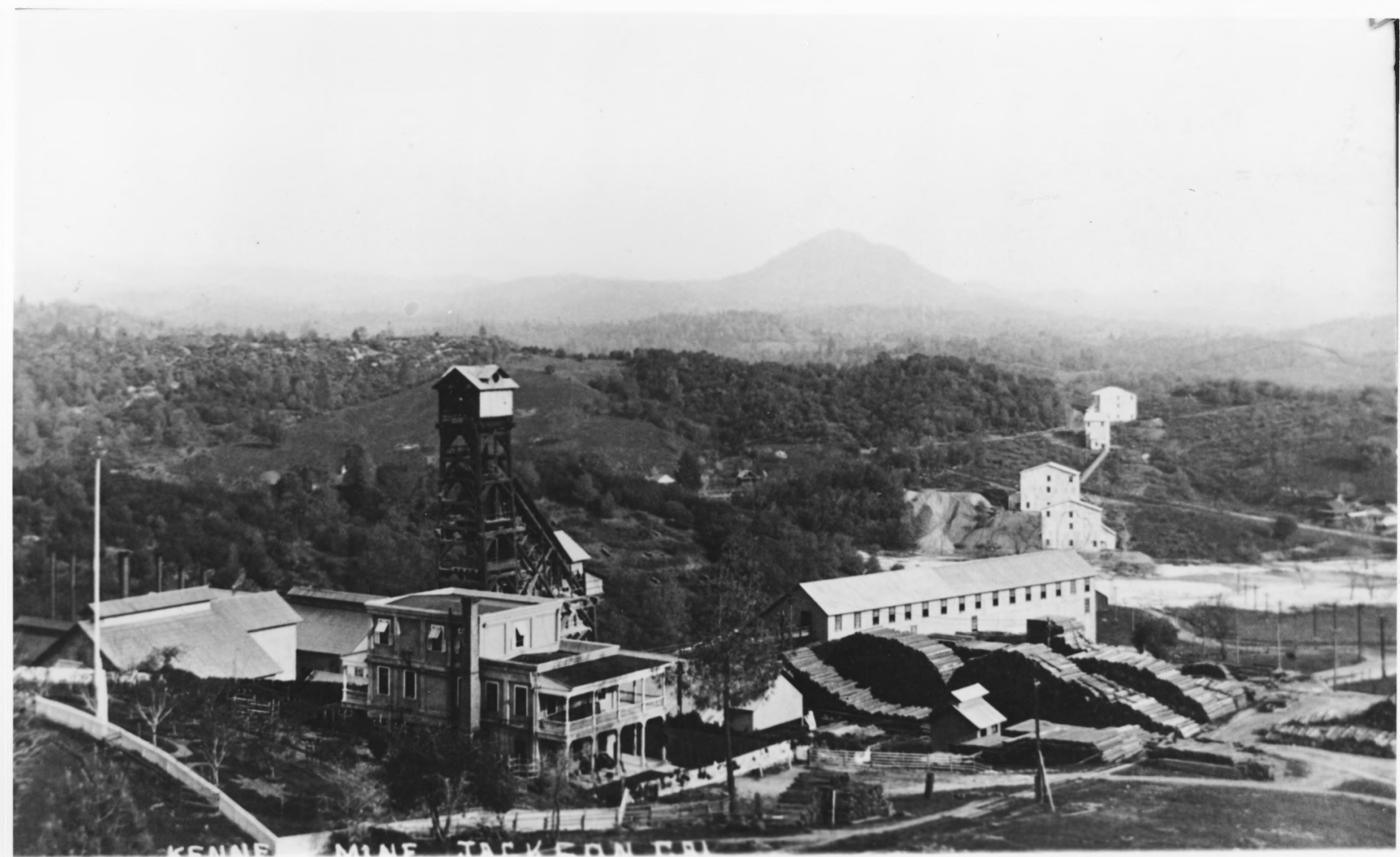
KSNNE MINE JACKSON CO